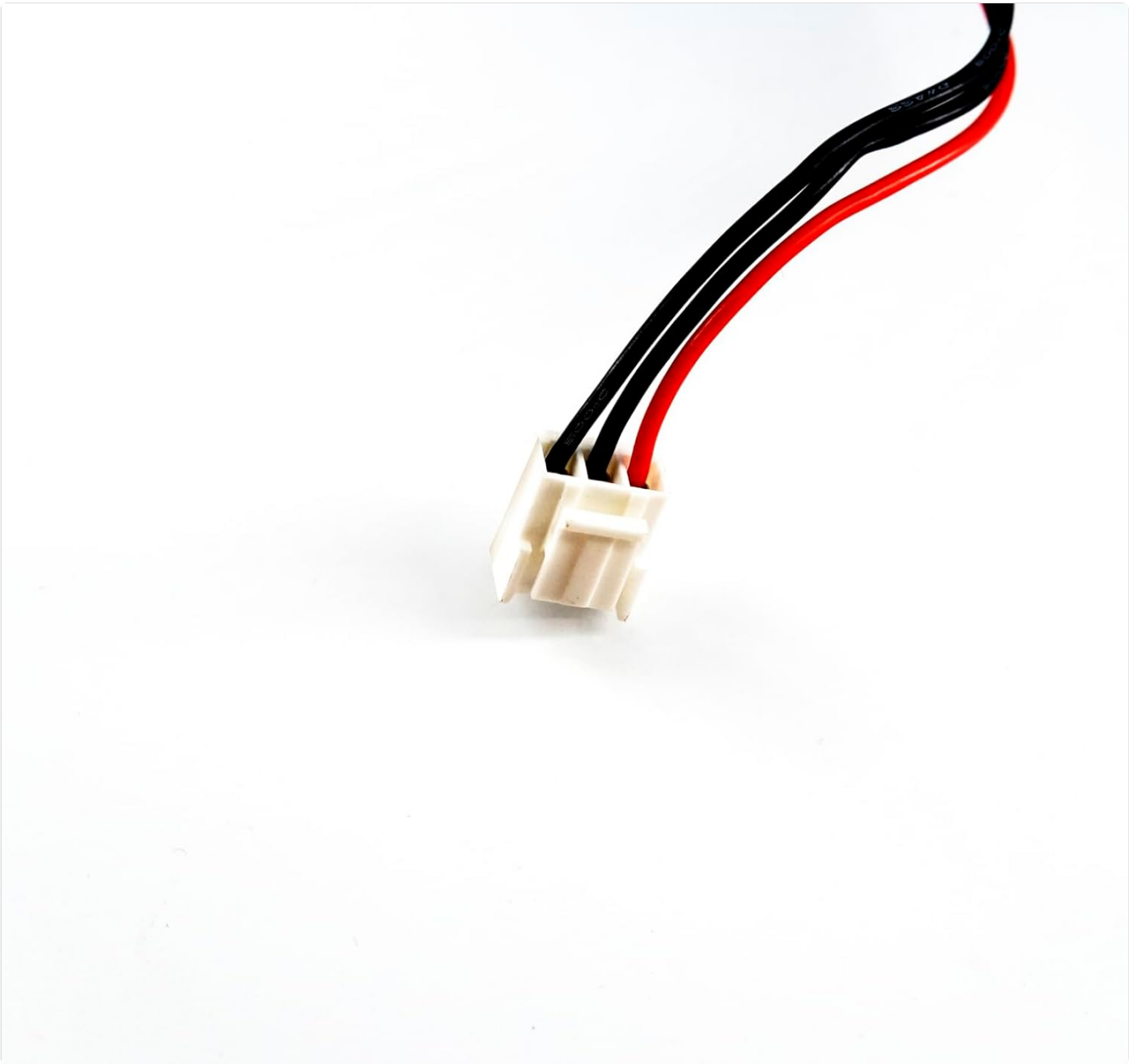
Figure 3.3: Detailed view of the battery's white multi-pin connector, essential for proper installation.