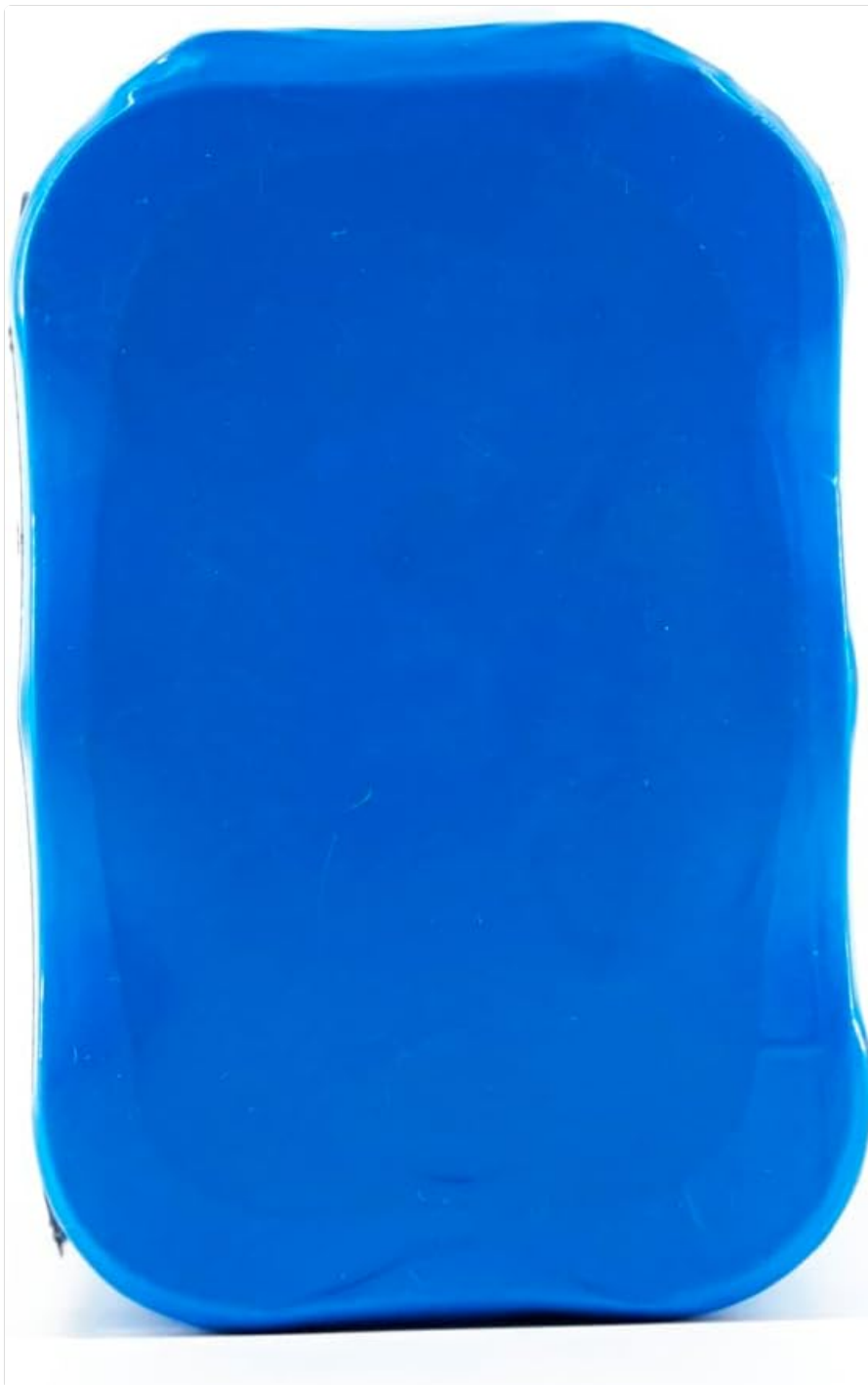
Figure 3.4: Bottom view of the battery, showing its smooth, blue protective casing.