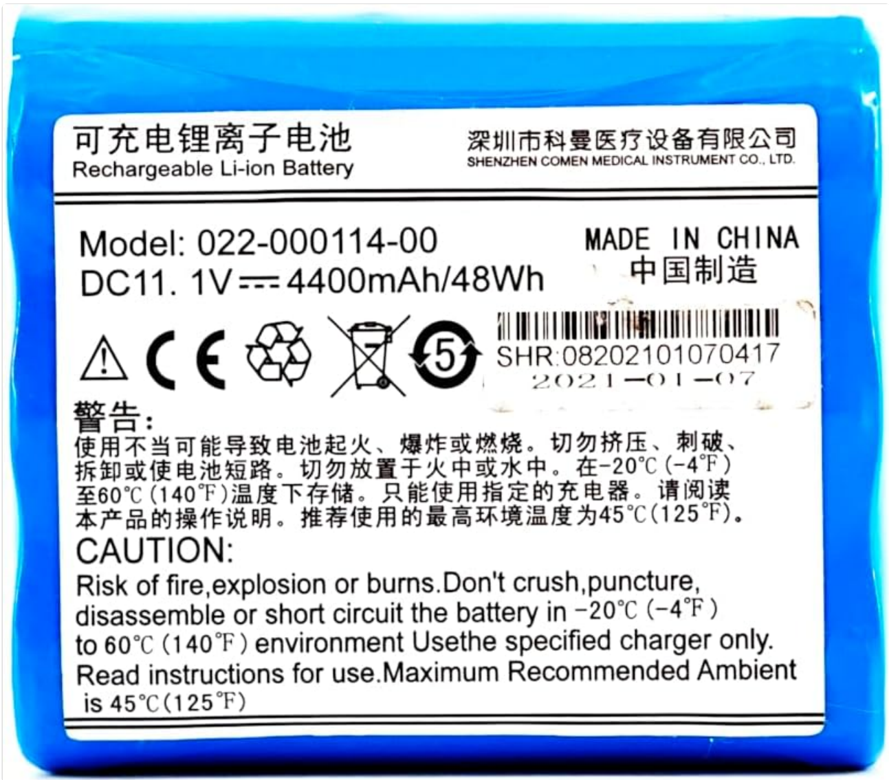
Figure 2.1: Battery label displaying critical safety warnings and technical specifications in English and Chinese.