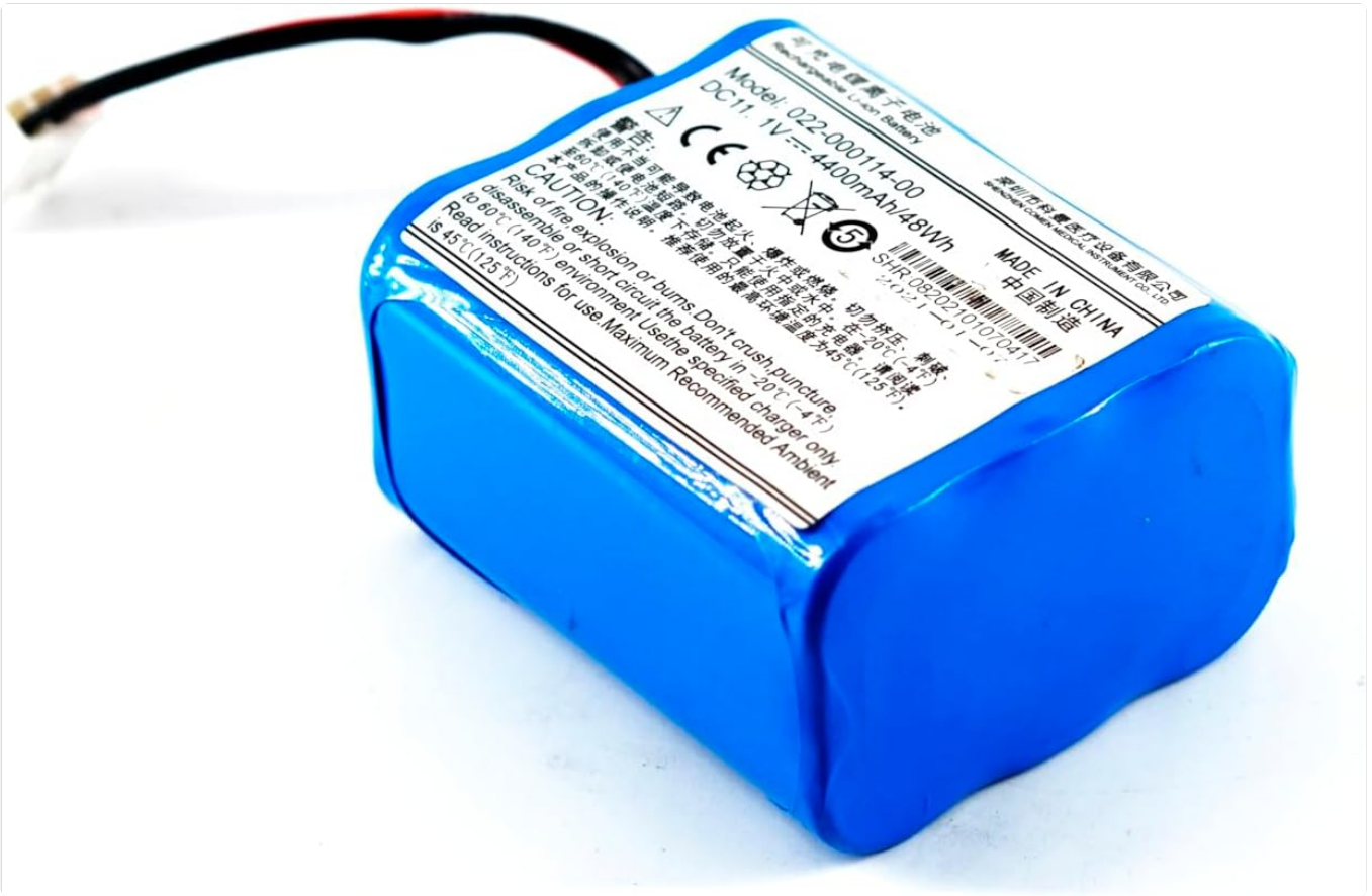
Figure 3.1: Overall view of the battery, showing its blue casing and top label.