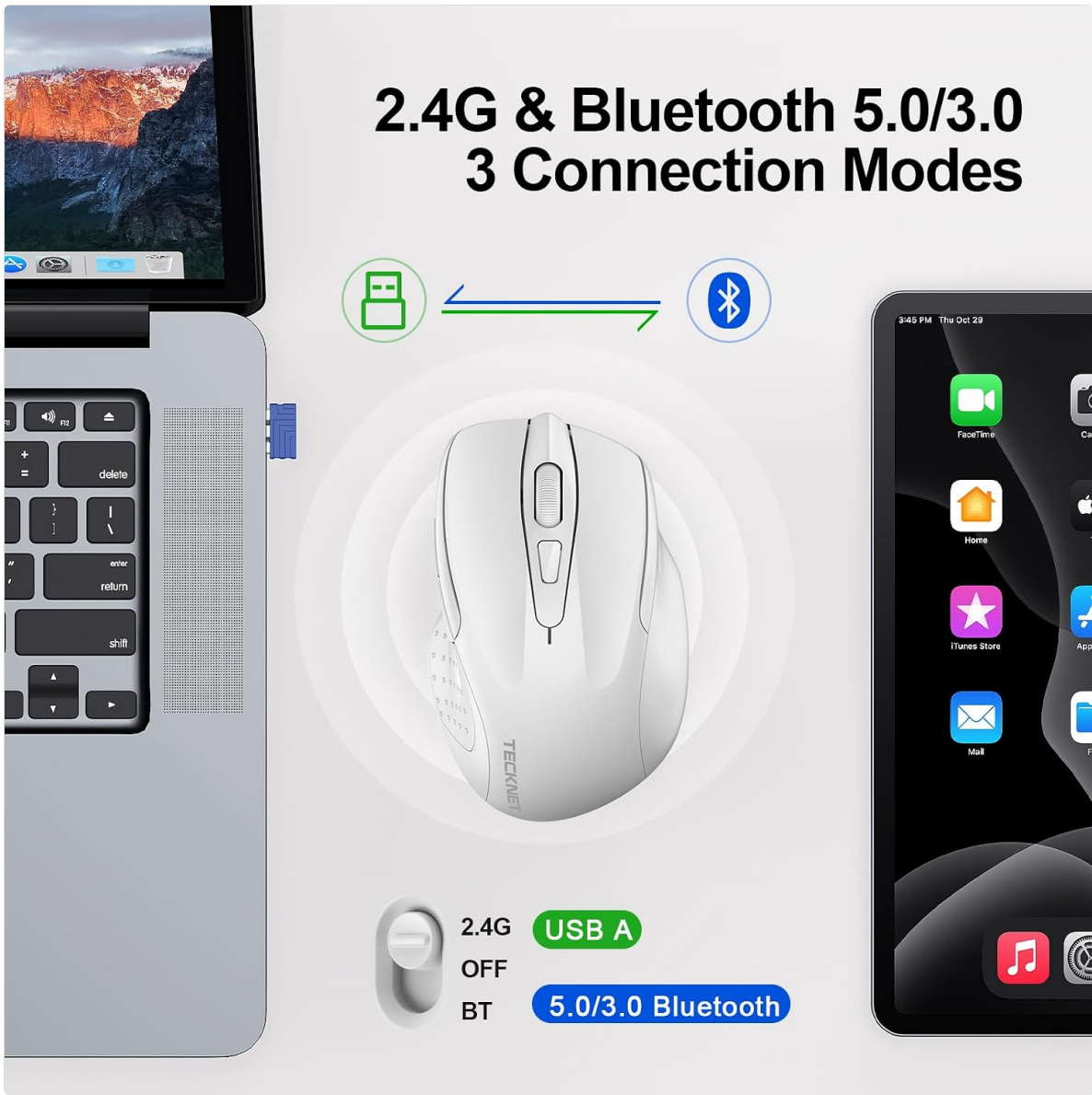
Image: Diagram showing the three connection modes (2.4G, Bluetooth 5.0, Bluetooth 3.0) of the TECKNET TK-MS317 mouse, connecting to a laptop and a tablet.