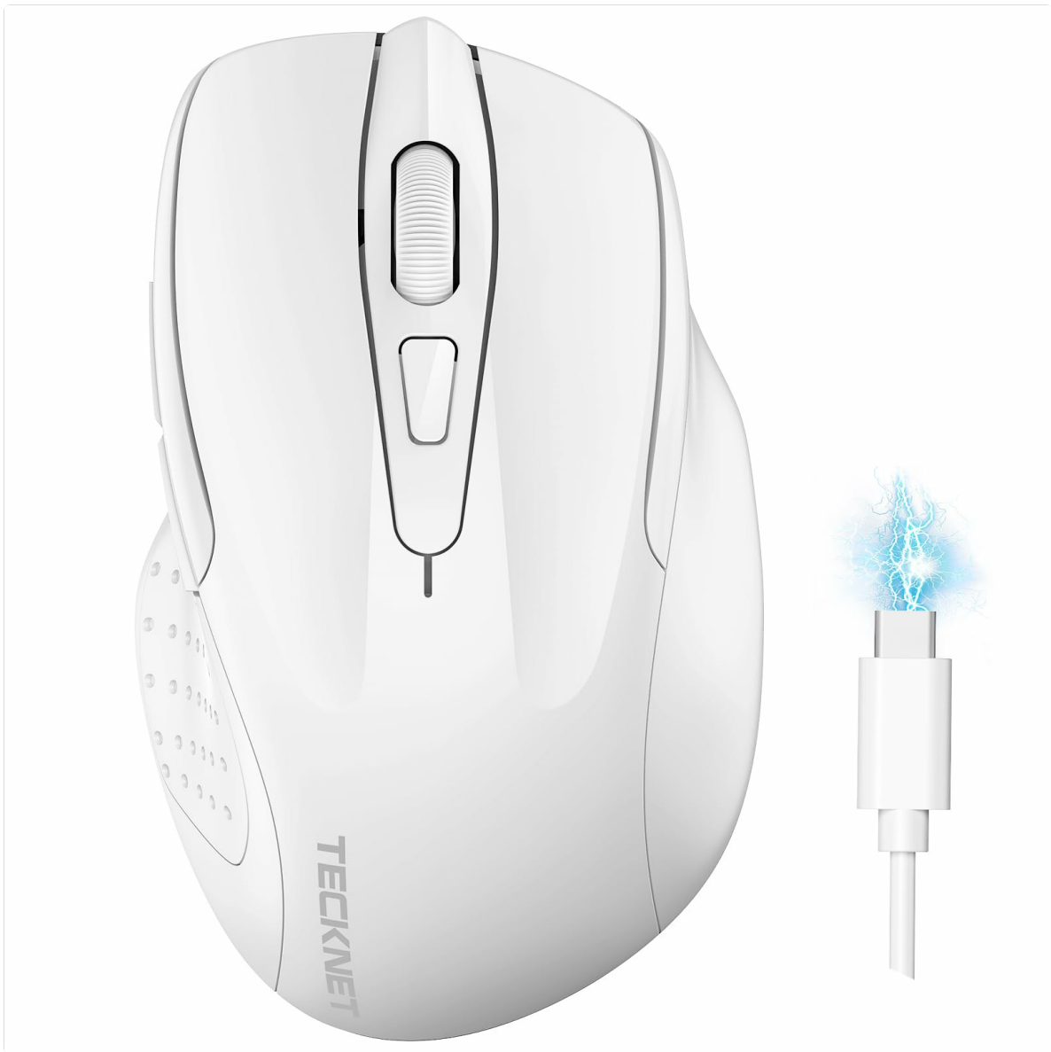
Image: The TECKNET TK-MS317 Bluetooth Wireless Mouse, showcasing its ergonomic design and sleek white finish.