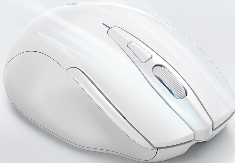
Image: Diagram illustrating the ergonomic curvature of the TECKNET TK-MS317 mouse, designed for comfortable hand fit.