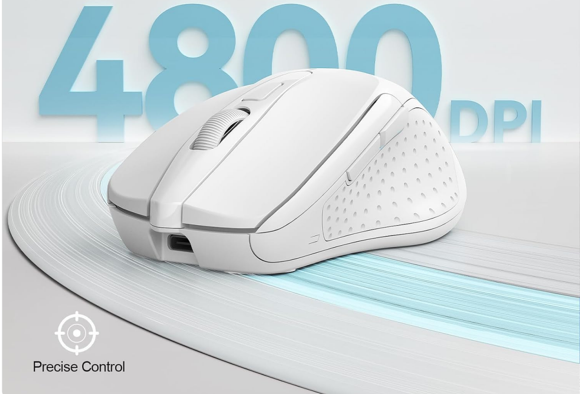
Image: Visual representation of the TECKNET TK-MS317 mouse highlighting its 6 levels of adjustable DPI, up to 4800 DPI.

Up to 4800DPI sensitivity, easily meet different needs such as office, design, games, etc.