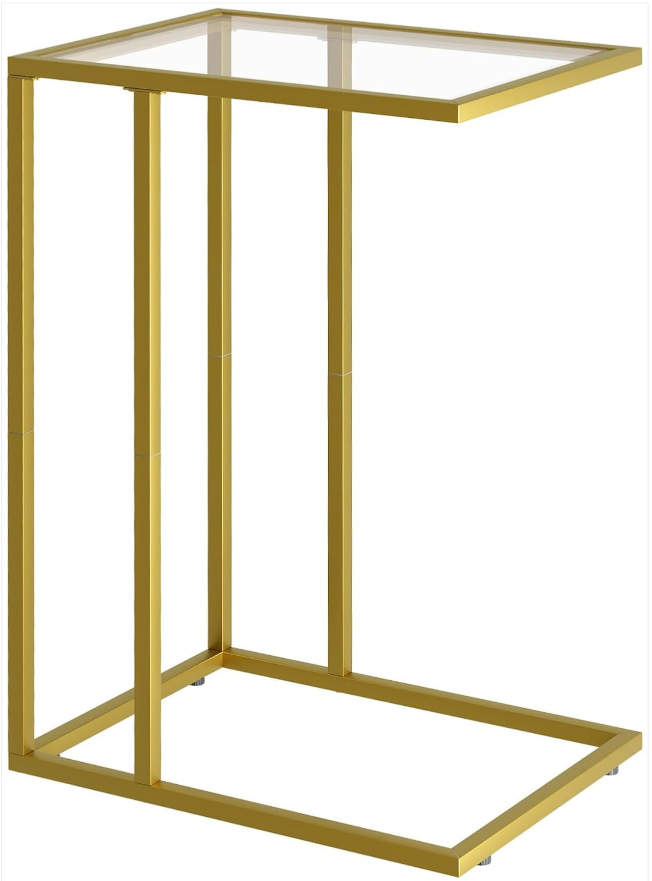
Image 1.1: The Adompacat C-Shaped End Table, featuring a gold metal frame and clear tempered glass top.