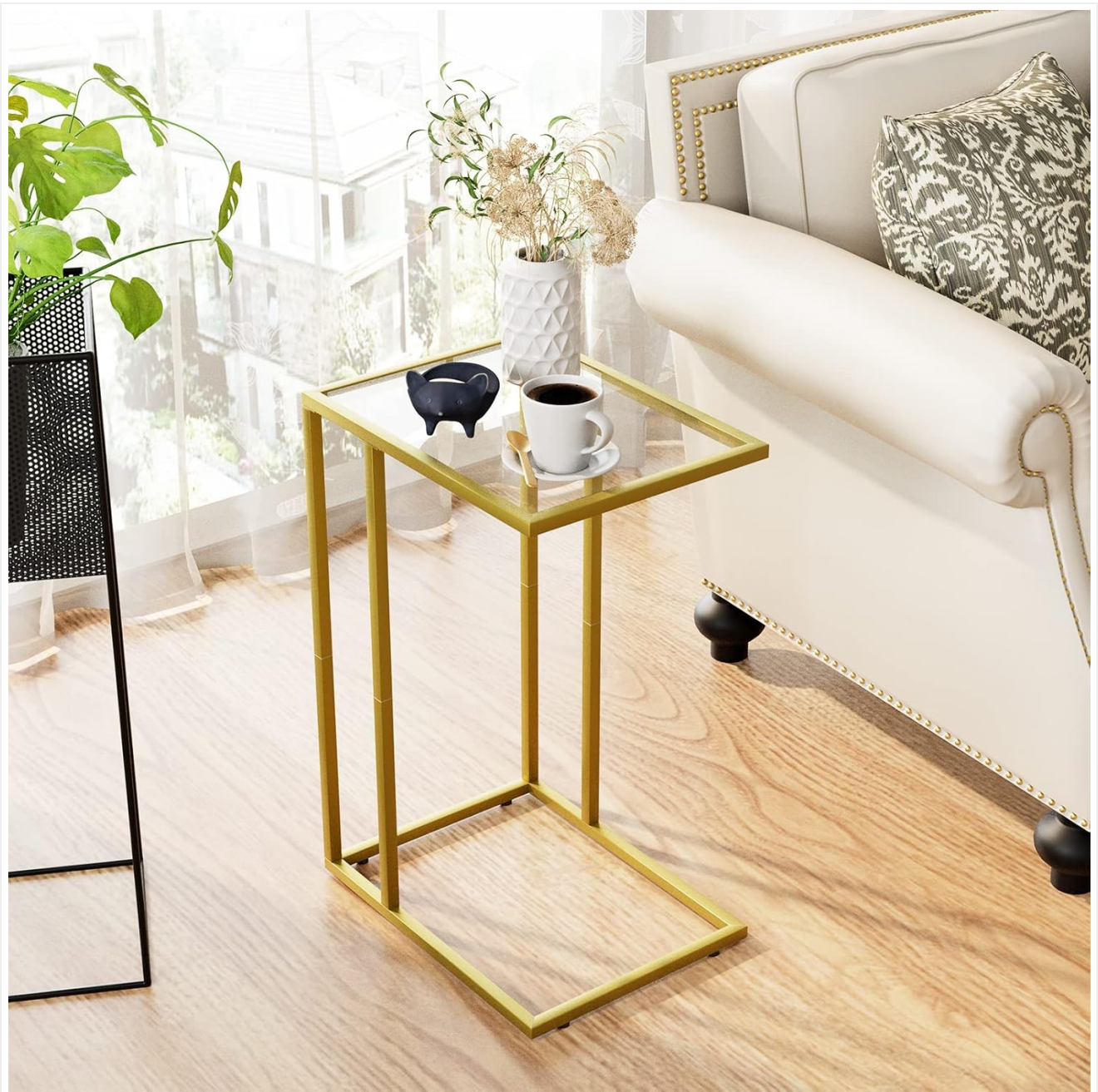
Image 5.1: The C-shaped end table positioned next to a sofa, demonstrating its practical use for holding beverages and decorative items.