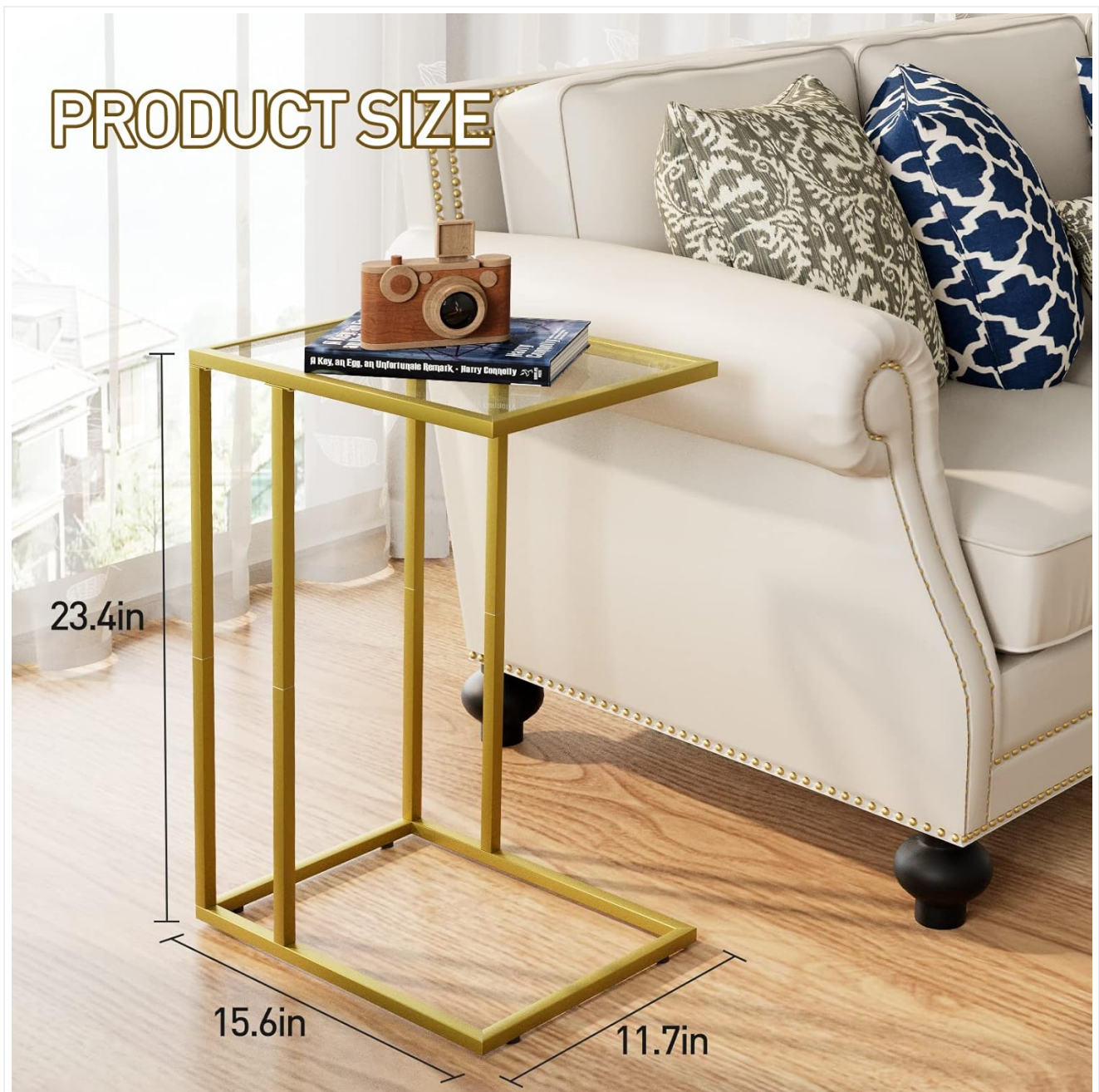
Image 4.1: Product dimensions for the Adompacat C-Shaped End Table. The table measures approximately 11.7 inches deep, 15.6 inches wide, and 23.4 inches high.