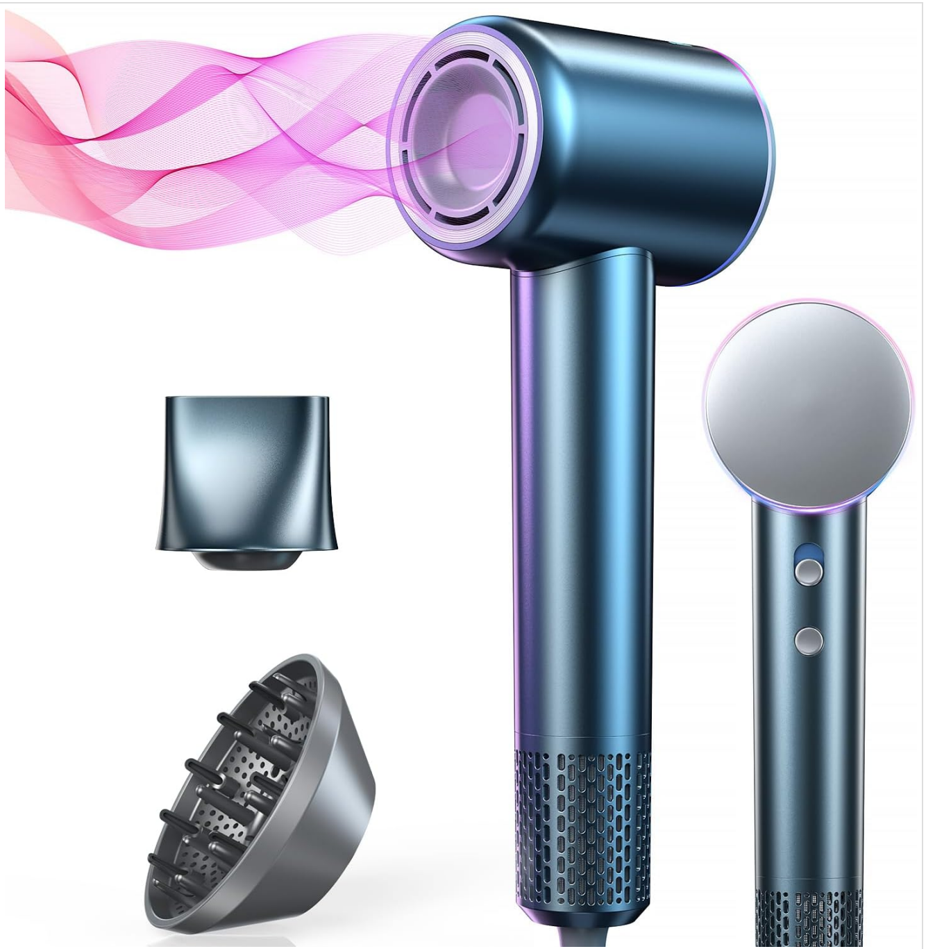
Figure 2.1: iDOO High-Speed Hair Dryer and included accessories.