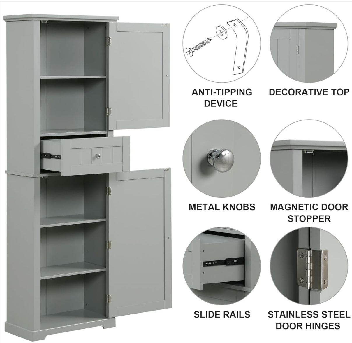
Image: Detailed view of the cabinet's hardware, highlighting the anti-tipping device for wall attachment, metal knobs, magnetic door stoppers, smooth slide rails for the drawer, and durable stainless steel door hinges.