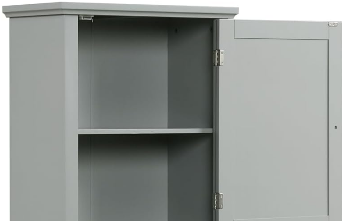
Image: A visual breakdown of the cabinet's storage capabilities, detailing the upper and lower cabinet sections with doors, the central drawer, and the adjustable shelf feature. Icons suggest storage for towels, shampoo, soaps, body lotion, and tissues.

Towels / Shampoo / Soaps / Body Lotion / Tissue