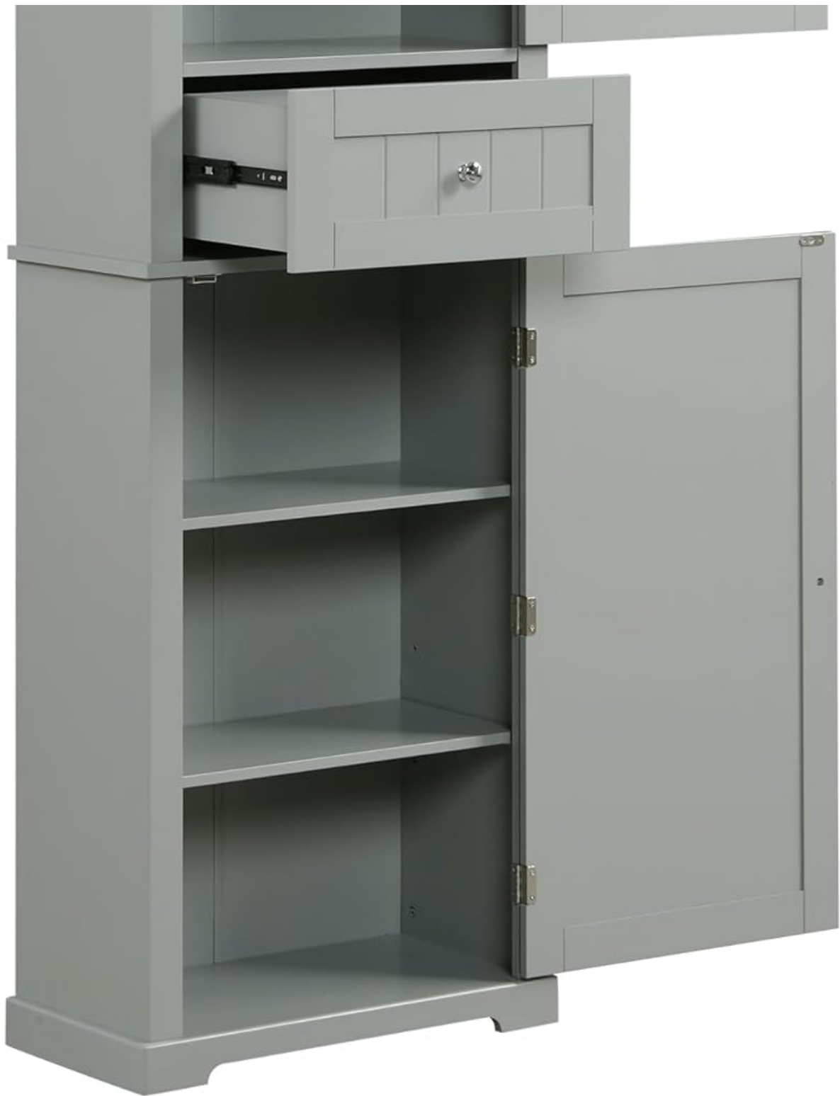
Image: The Virubi cabinet with both its upper and lower doors open, and the central drawer extended, showcasing the interior storage compartments and adjustable shelf.