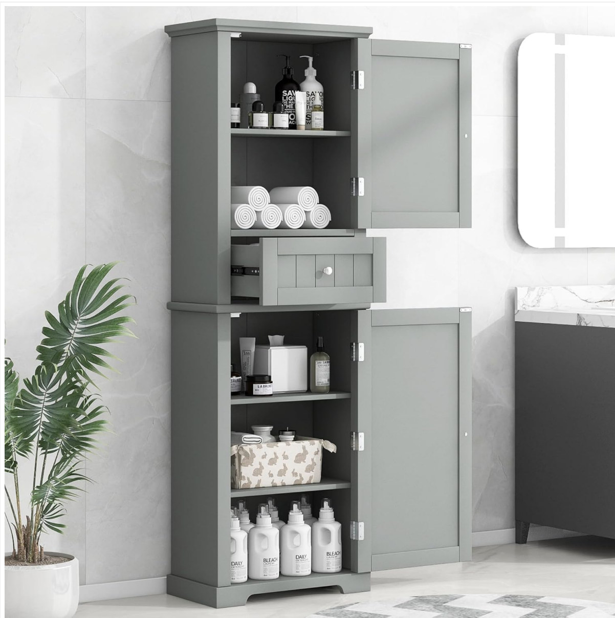
Image: The Virubi Tall Narrow Storage Cabinet in Grey, featuring two doors and a central drawer, shown in a bathroom setting with various items stored inside.