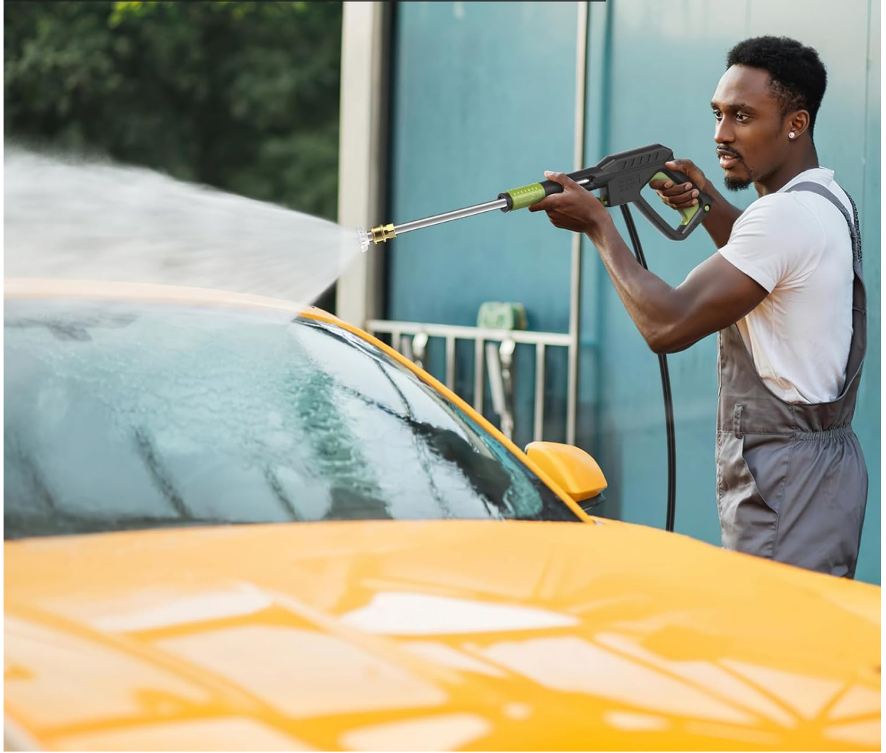
Figure 7: The included foam cannon allows for effective application of cleaning solutions.