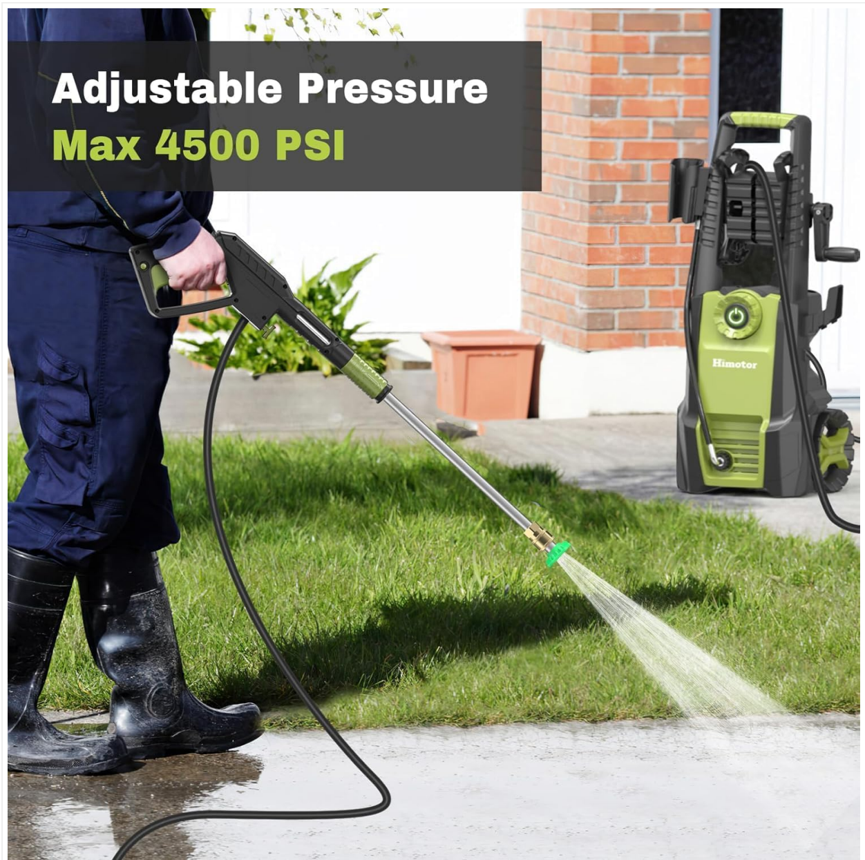
Figure 5: The pressure washer in action, showcasing its adjustable pressure for different surfaces.