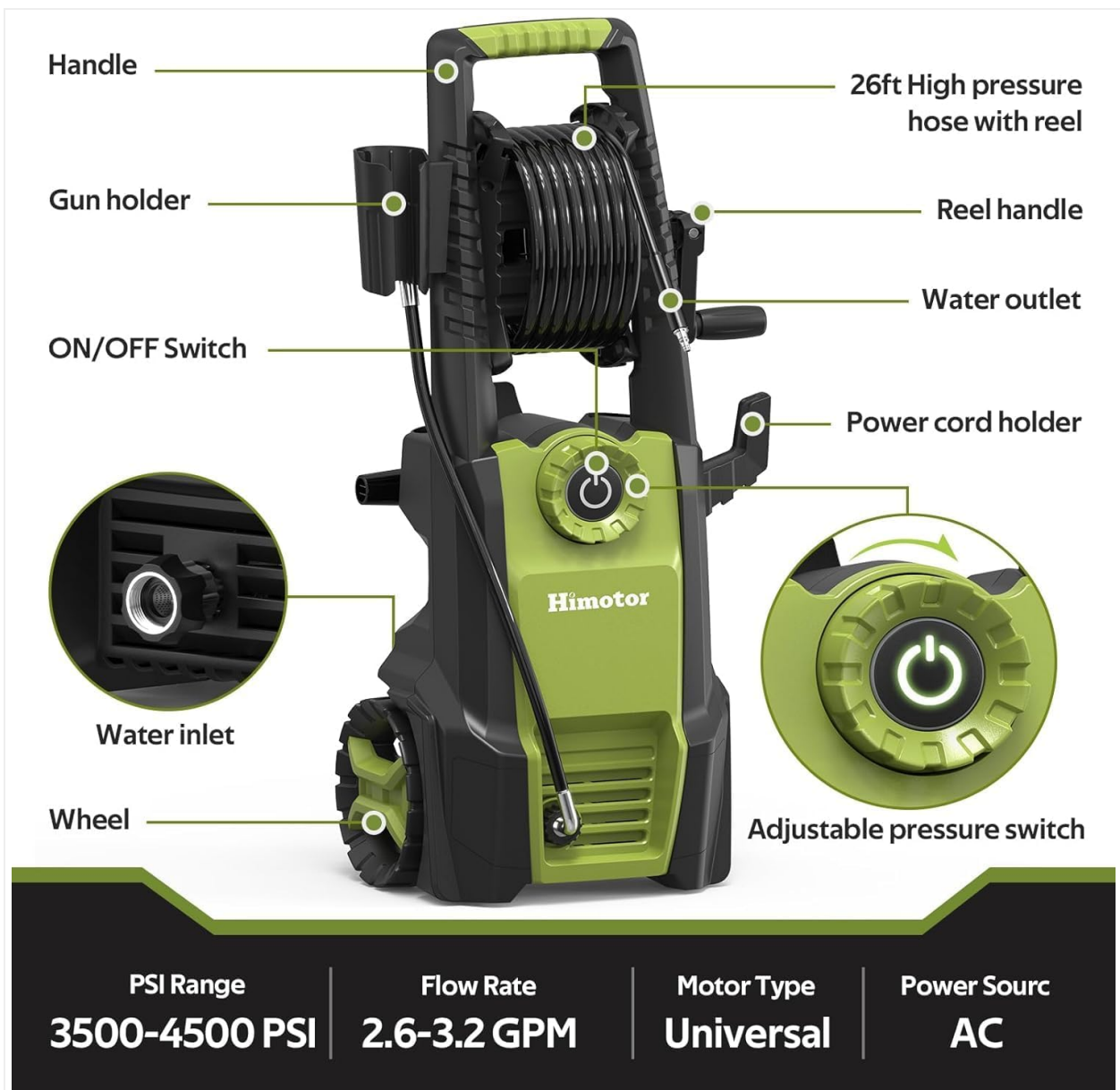
Figure 3: Detailed view of the water inlet and adjustable pressure switch.