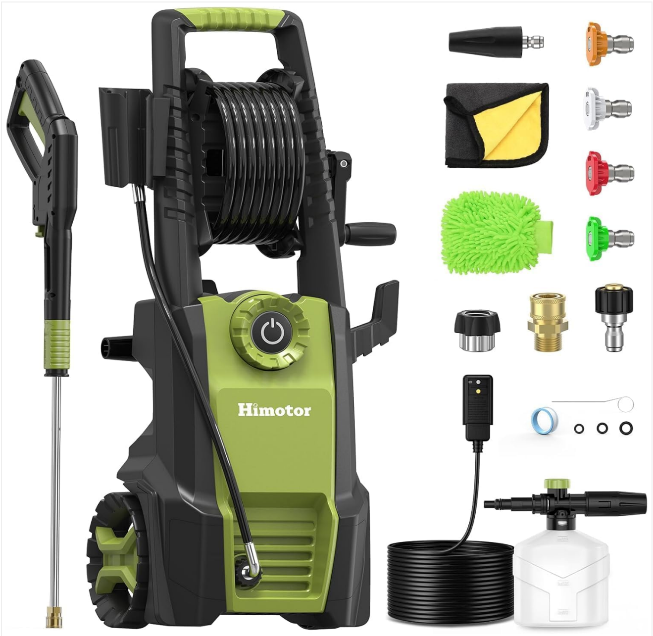
Figure 1: All components included with the HIMOTOR Electric Pressure Washer.