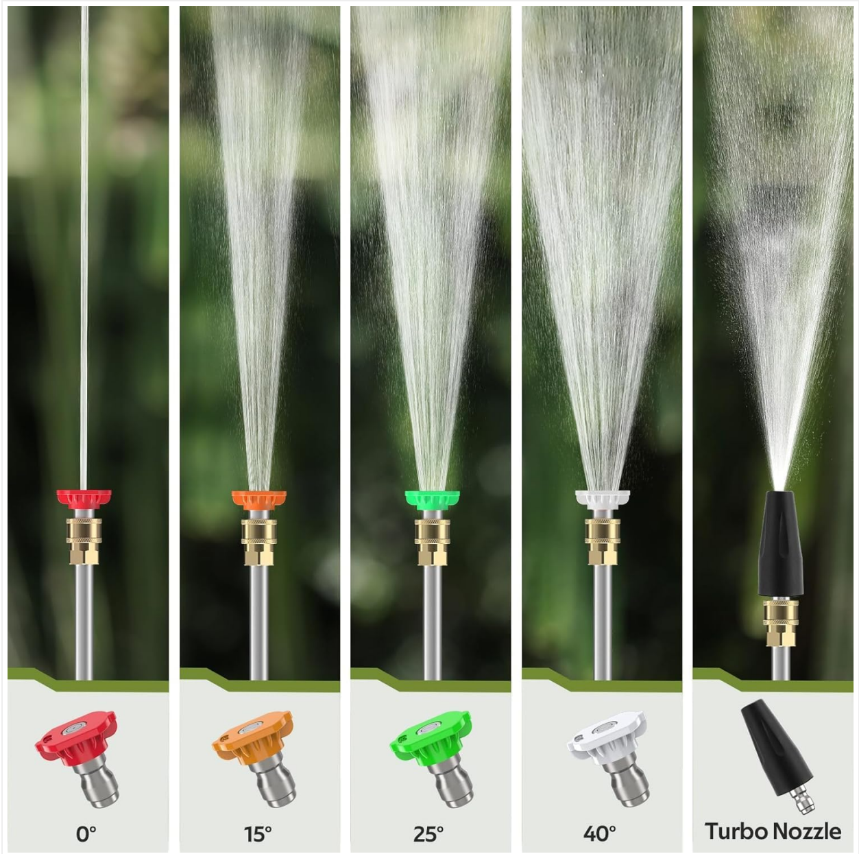
Figure 6: Various quick-connect nozzles and their spray patterns for diverse cleaning needs.