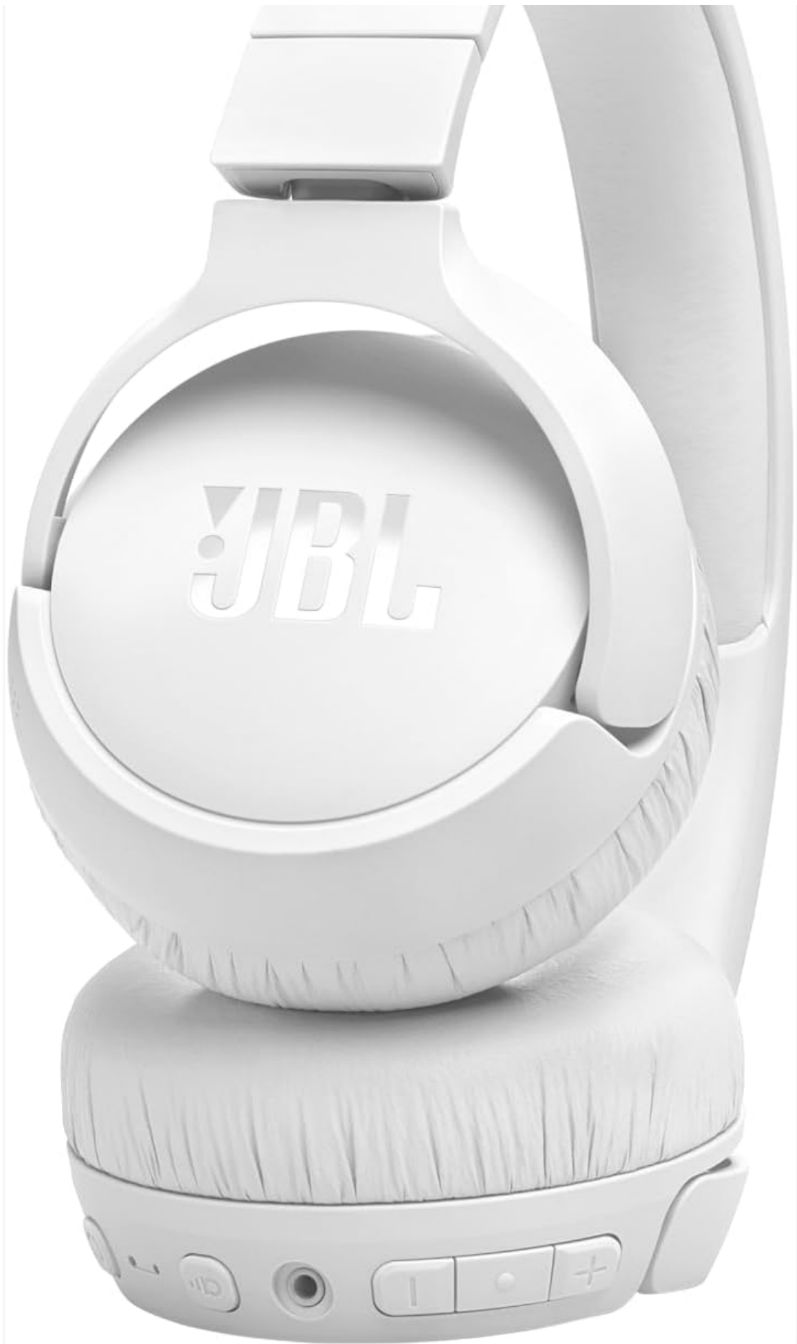
Detail of the control buttons and ports located on the earcup, allowing for easy management of music, calls, and noise control features.