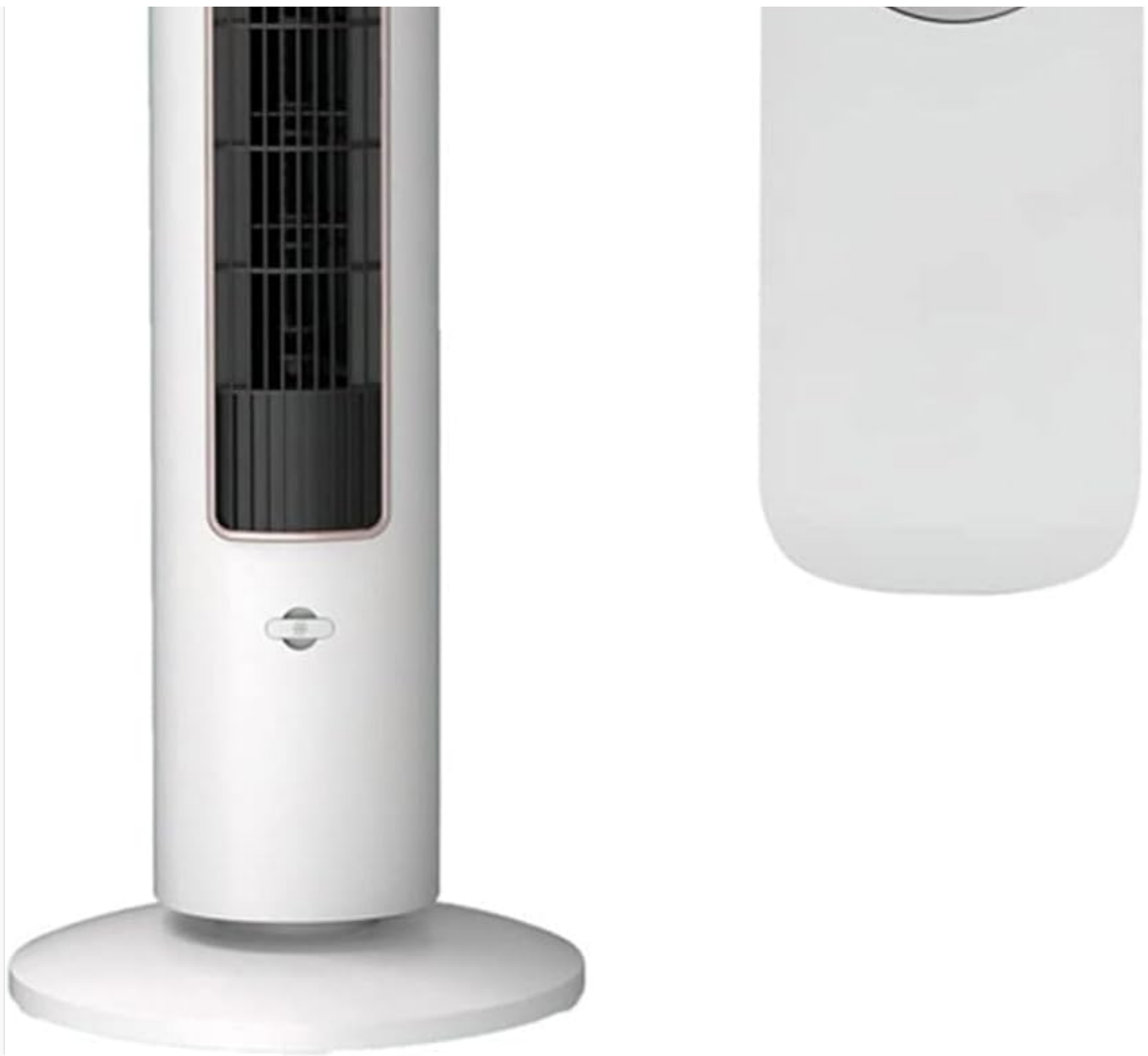
Image 1.1: The Hurricane 40 Inch Triple Action Tower Fan with its remote control.