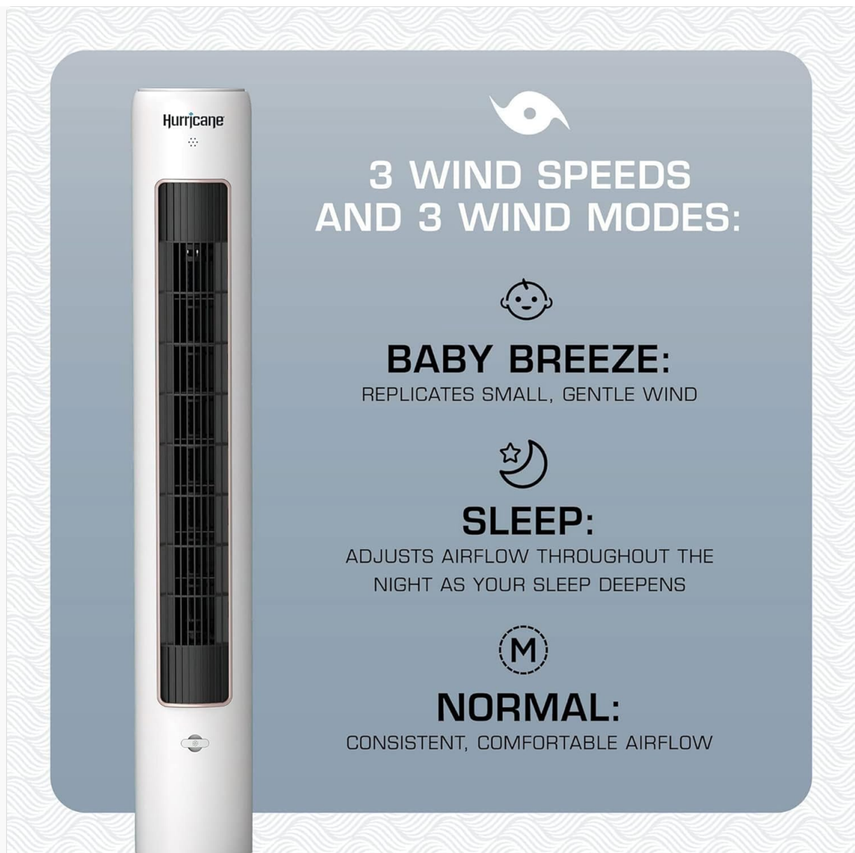
Image 5.1: The fan offers three distinct wind speeds and modes: Baby Breeze for gentle wind, Sleep for adjusted airflow, and Normal for consistent comfort.