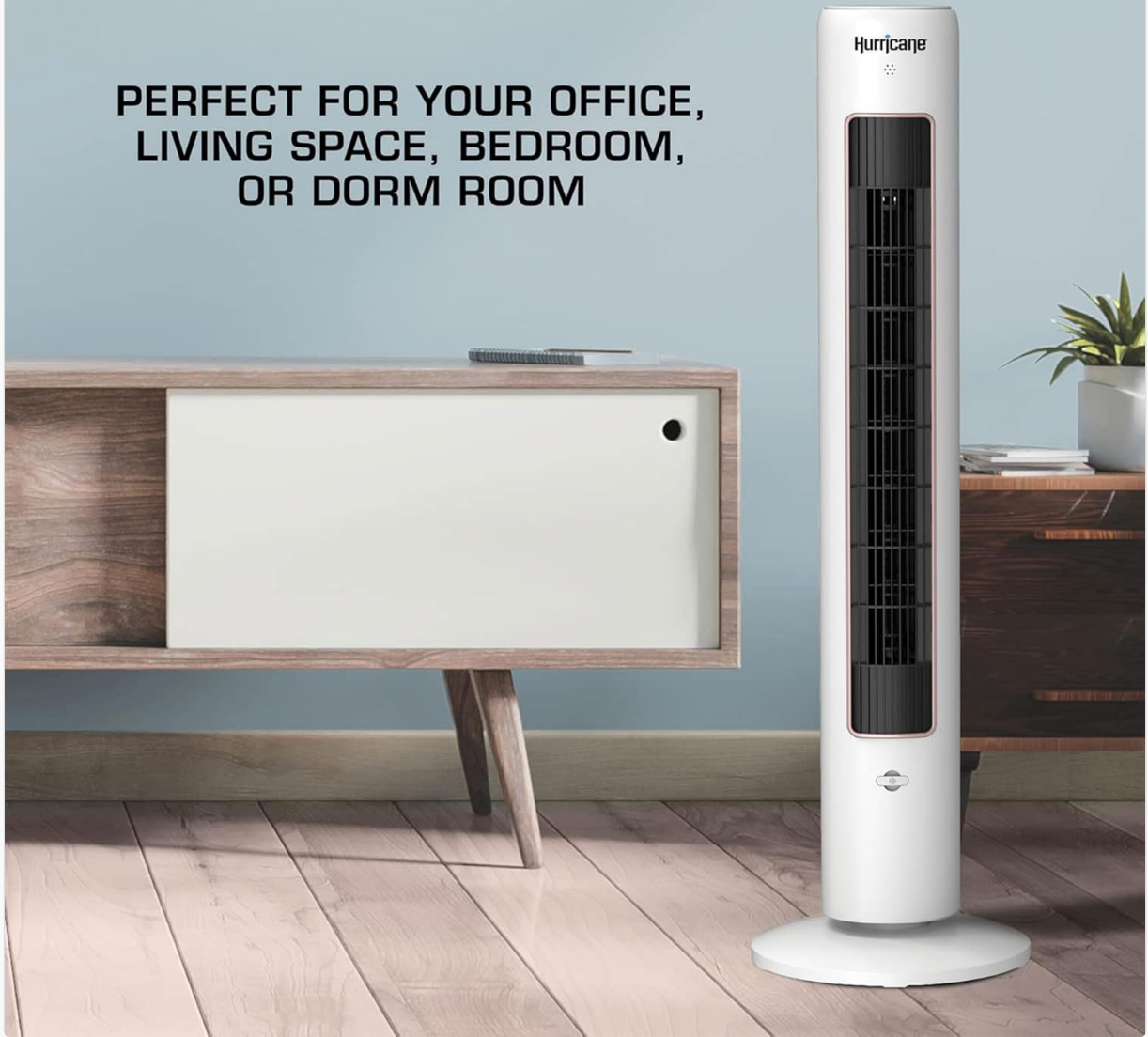
Image 3.1: The Hurricane Tower Fan seamlessly integrates into various room settings.

PERFECT FOR YOUR OFFICE, LIVING SPACE, BEDROOM, OR DORM ROOM