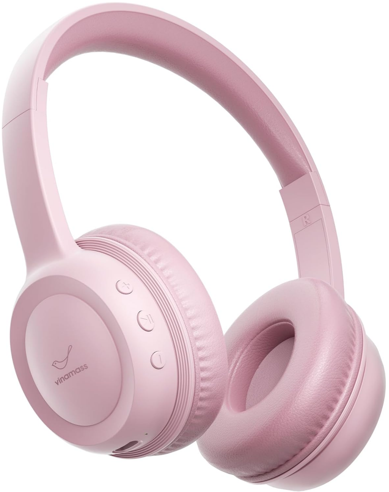
Image: Front view of the pink vinamass Kids Bluetooth Headphones E63, showcasing the over-ear design and control buttons on the earcup.