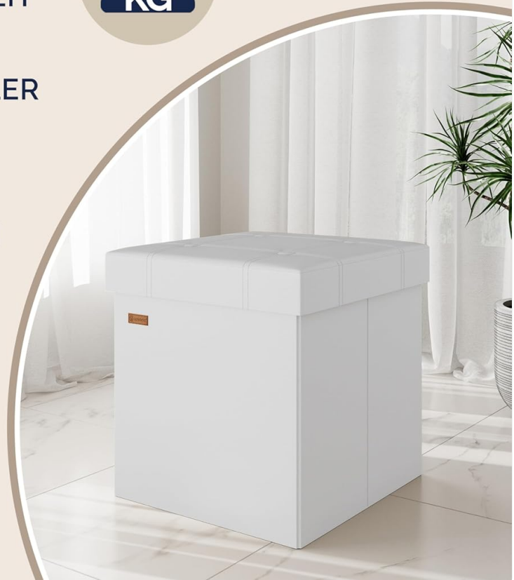
Image: This graphic highlights the product's durability, emphasizing its high static load capacity of 300 kg, extra stable lid, and robust MDF frame.