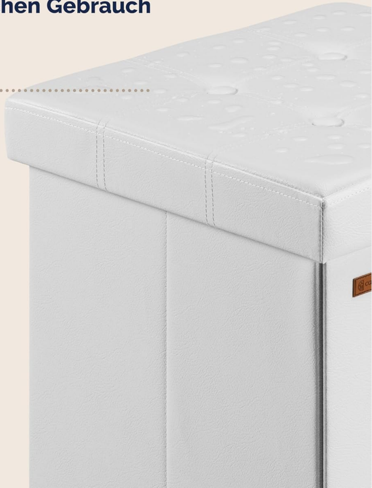
Image: This graphic illustrates the easy-care nature of the ottoman, showing its resistance to dust and moisture, and highlighting the stable inner base.