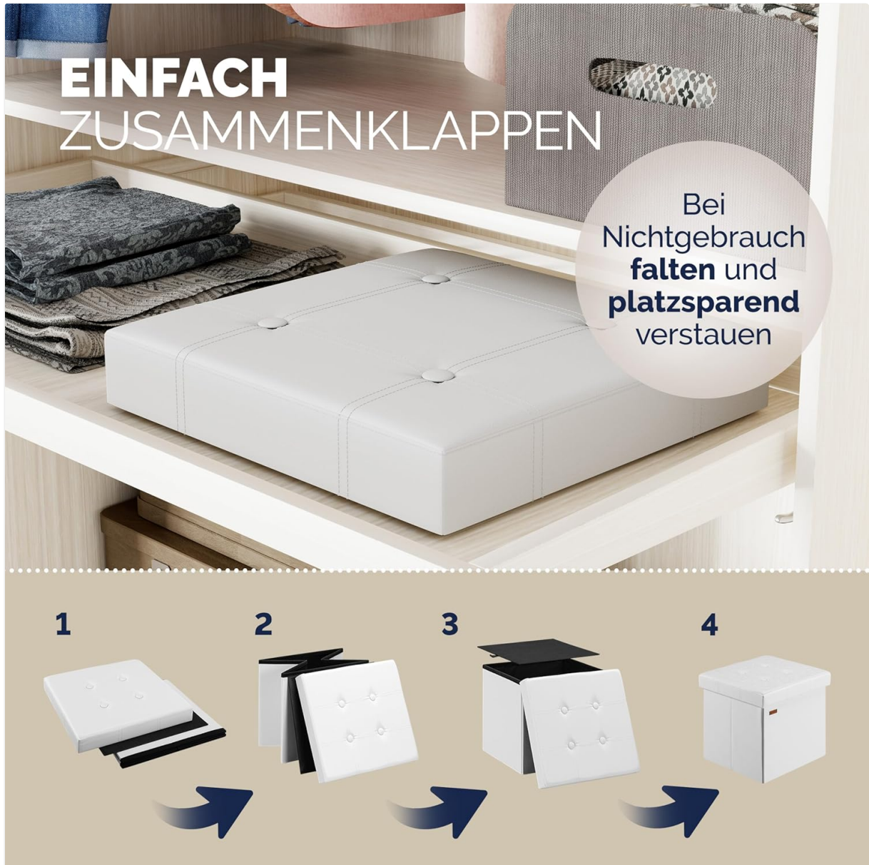
Image: Step-by-step guide for unfolding the ottoman. The image shows the lid, the folded body, inserting the bottom panel, and the fully assembled ottoman.

To fold the ottoman for storage, simply reverse these steps: remove the lid, take out the bottom panel, and collapse the main body flat.