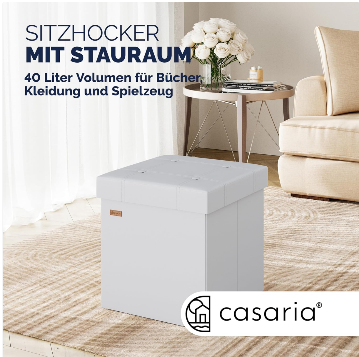
Image: A white Casaria ottoman in a living room, demonstrating its use as both a seat and a storage solution.