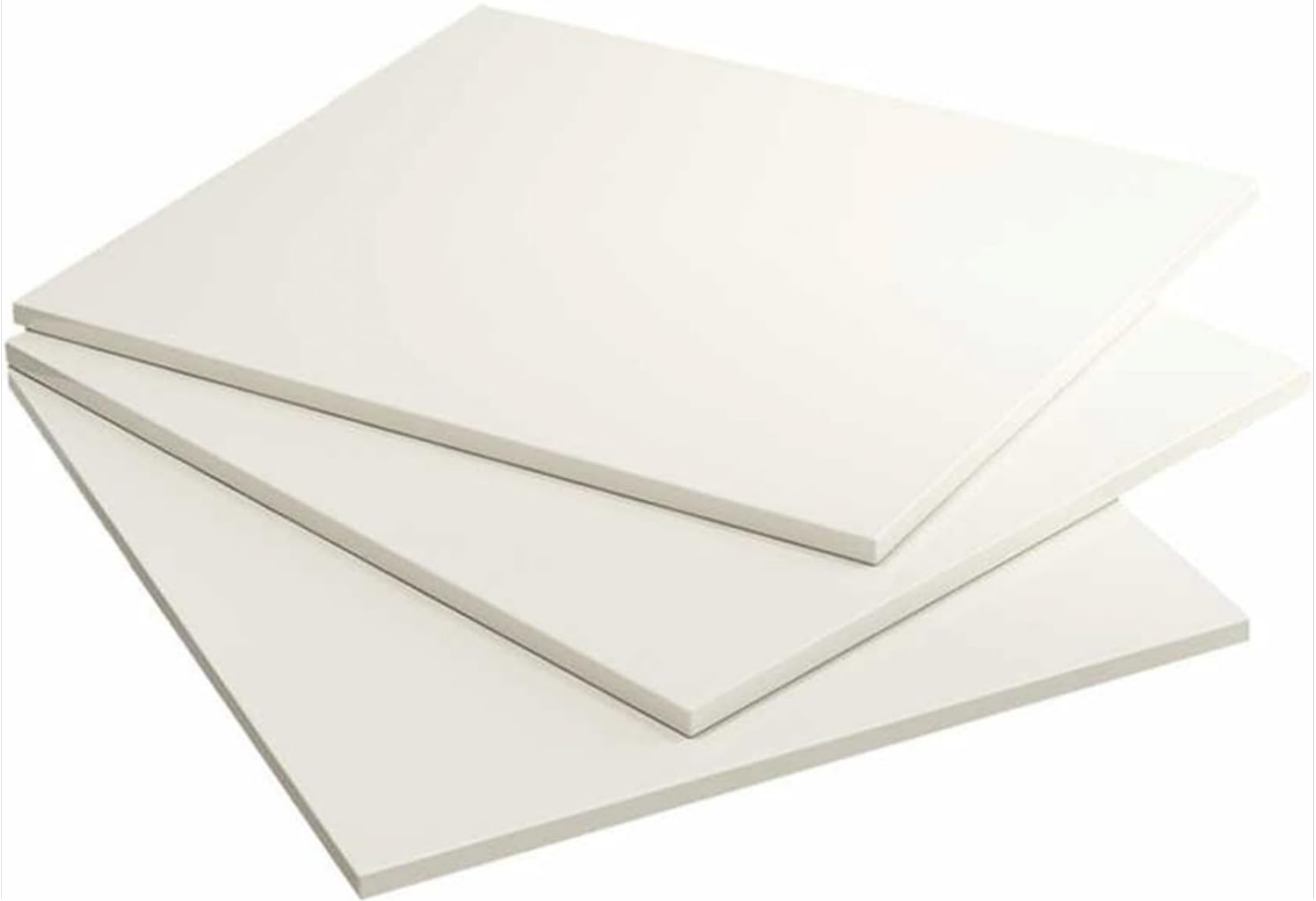
Figure 5.1: The vanity is made from high-quality, environmentally friendly, healthy, and odorless double-sided melamine paint-free board, offering moisture-proof, wear-resistant, and stable properties.

High Quality, Environmentally Friendly, Healthy and Odorless, Moisture-Proof, Wear-Resistant and Stable