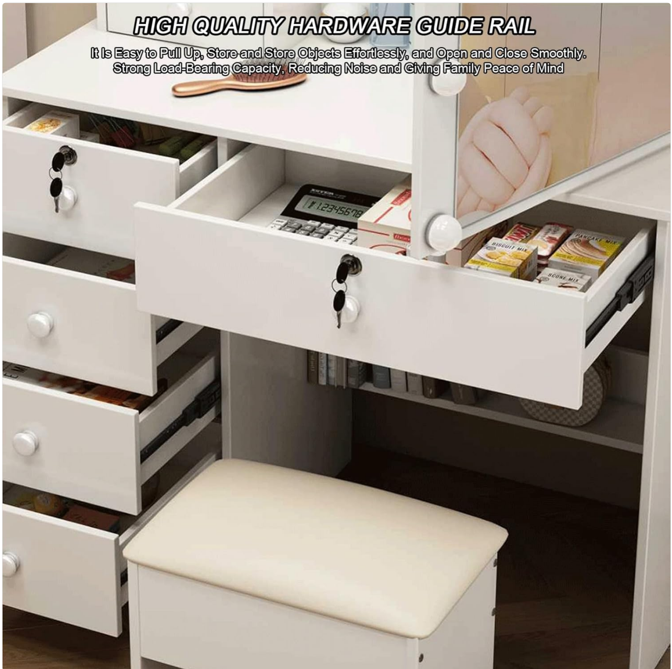
Figure 4.2: The multi-layer storage rack and integrated storage box provide intimate and practical classified storage for cosmetics.

It Is Easy to Pull Up, Store and Store Objects Effortlessly, and Open and Close Smoothly. Strong Load-Bearing Capacity, Reducing Noise and Giving Family Peace of Mind