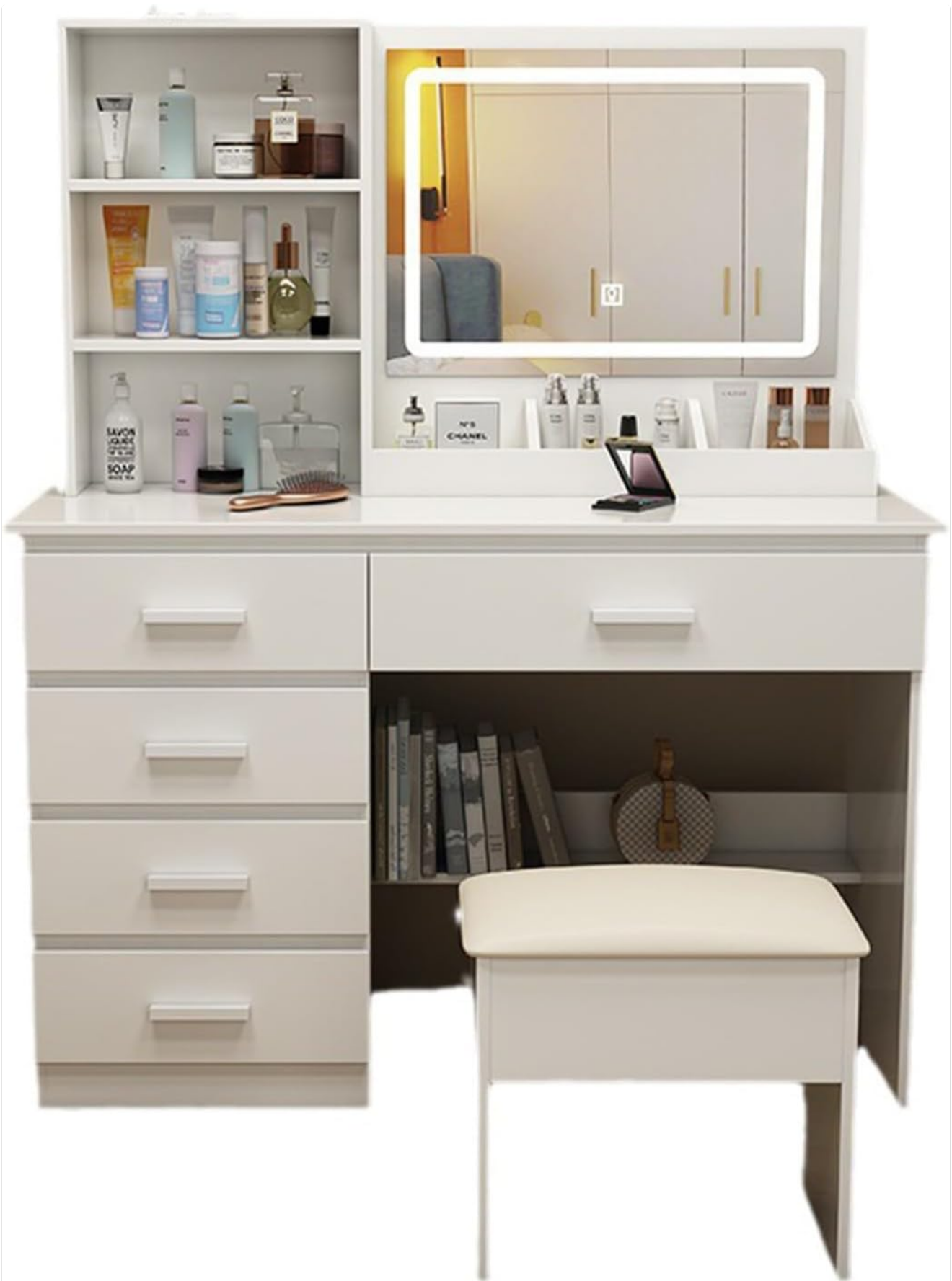
Figure 2.1: Overview of the FairyHover White Makeup Vanity with LED mirror, side storage, and stool.