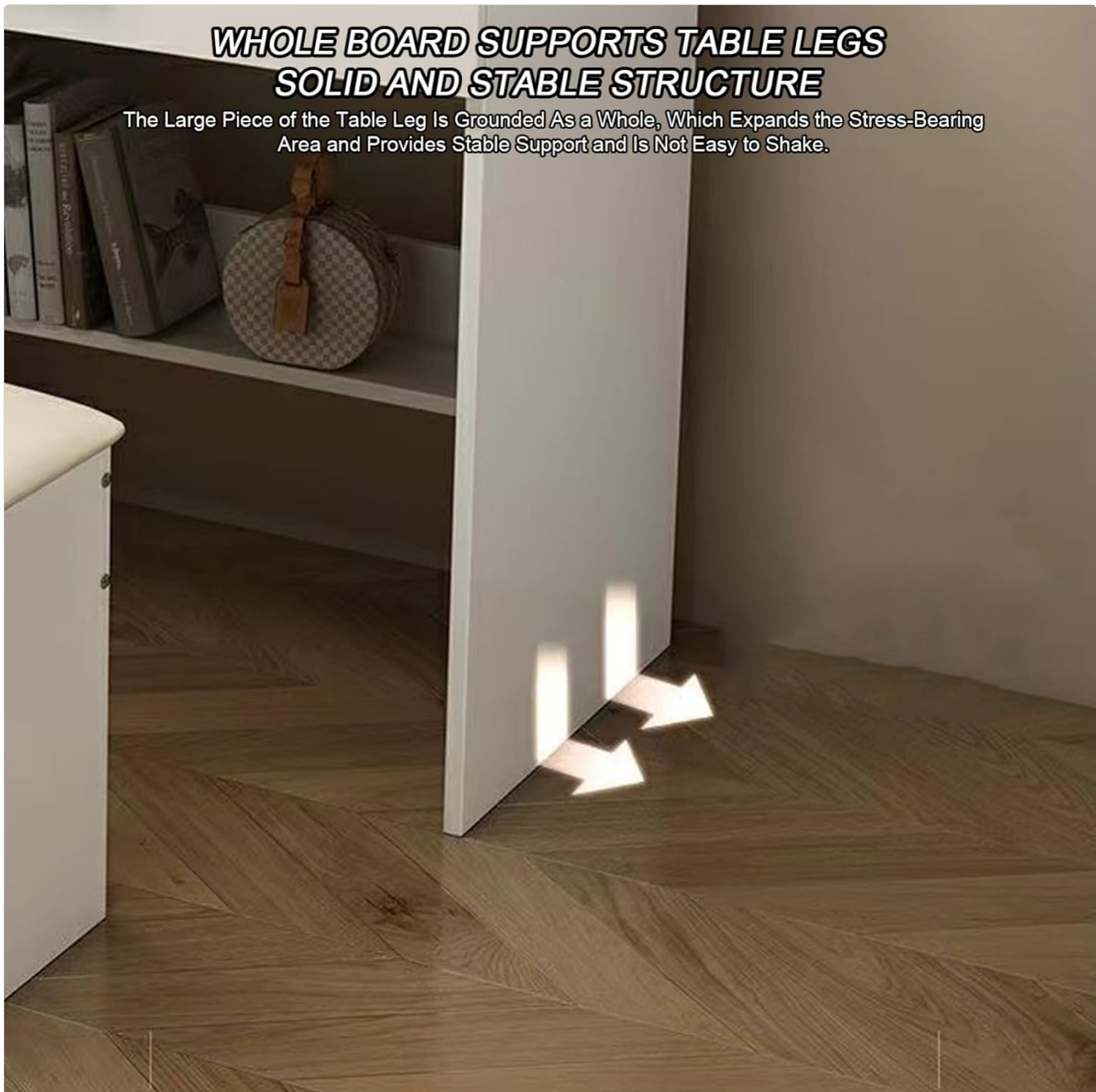
Figure 3.2: The whole board supports the table legs, providing a solid and stable structure that expands the stress-bearing area.

7. Final Check: Ensure all screws are tightened, and the vanity is stable.