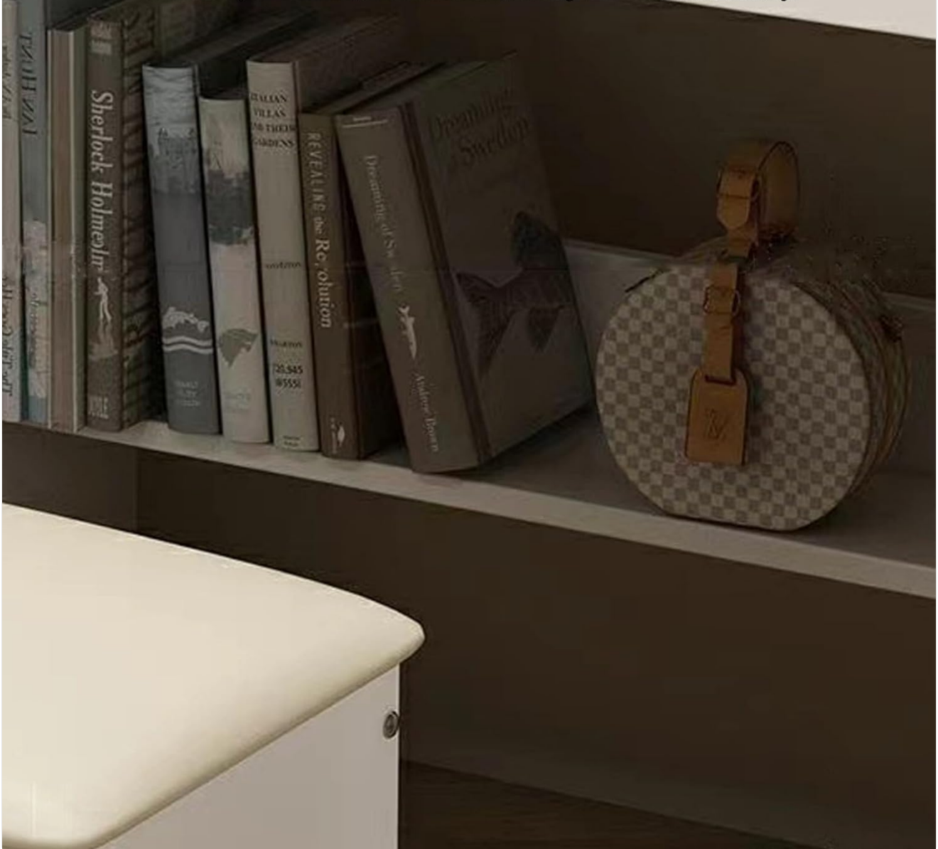
Figure 4.3: The lower shelf storage board maximizes space utilization, allowing for more efficient organization of items.

Maximize Space Utilization, Store More Items, and Organize Them More Efficiently.