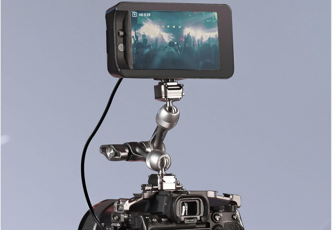
Figure 4: The ball head's spiral pattern enhances friction for a secure load capacity of up to 3kg.

The ball head's surface features a spiral pattern that enhances friction for a load capacity of up to 3kg.