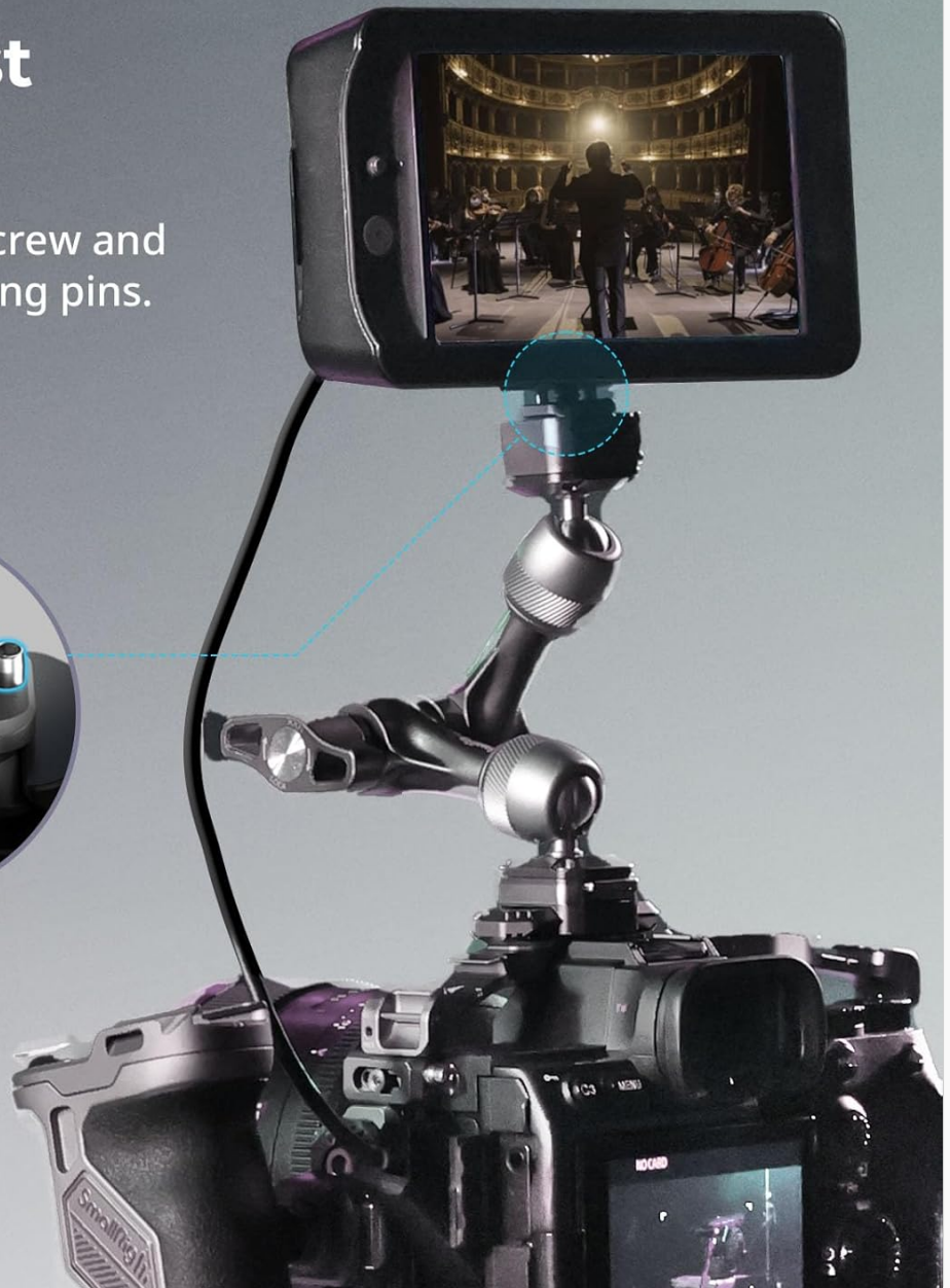
Figure 2: The anti-twist design with 1/4"-20 screws and locating pins ensures secure attachment of accessories.