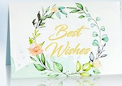
Grußkarte X 1

Image Description: This image displays a detailed sizing chart for the heated vest. It includes measurements in centimeters for Bust, Shoulder, Hips, and Length across various sizes (S, M, L, XL, XXL).