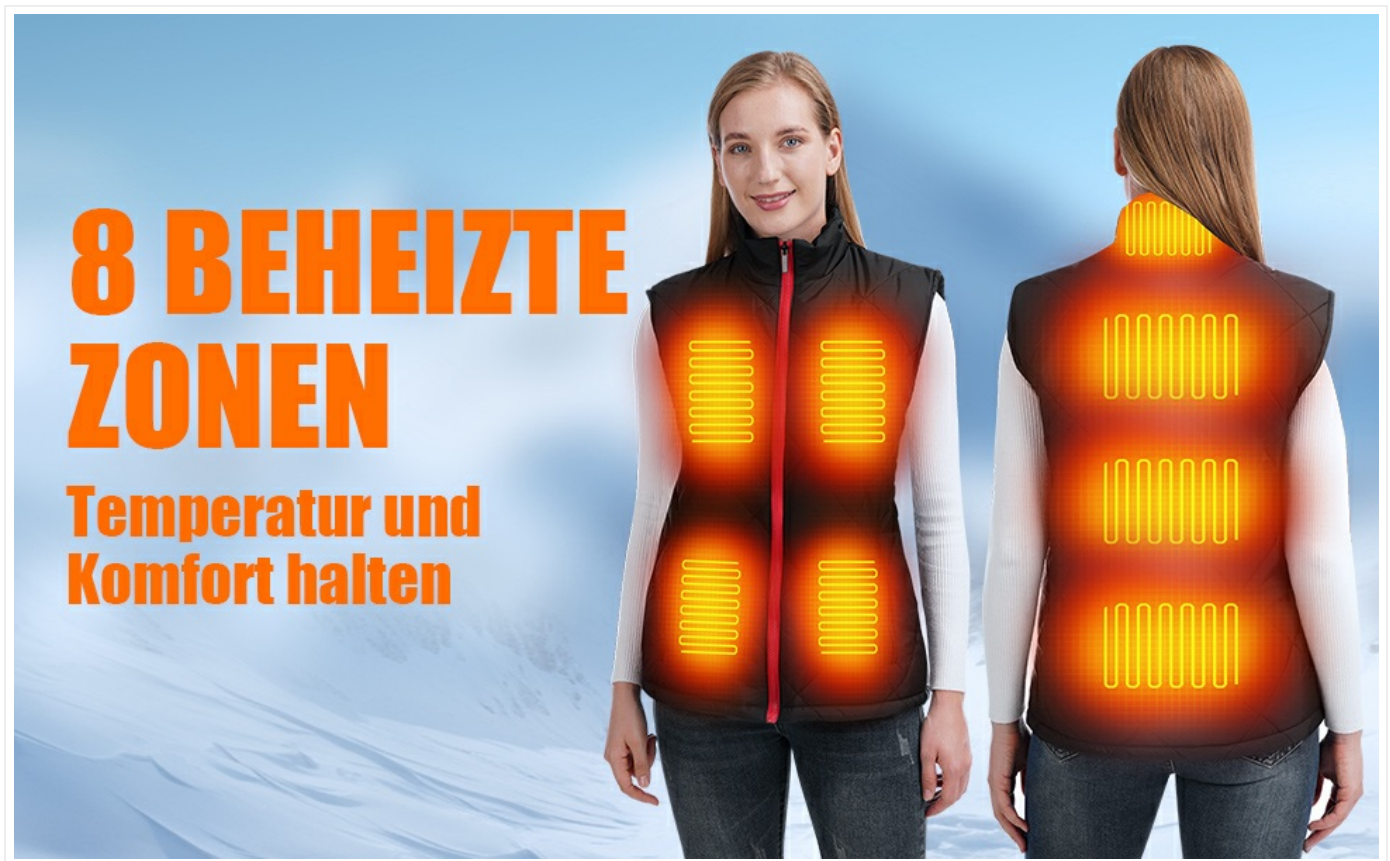
Image Description: This diagram highlights the eight heating zones within the vest. It shows four heating elements on the front (chest and abdomen) and four on the back (neck, upper back, and lower back), ensuring full body warmth.