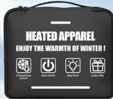
Handtasche X 1