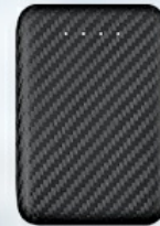
Batterie X 1