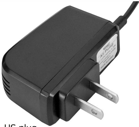
● US plug (AC 110V/60HZ)