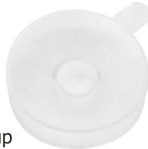
● suction cup