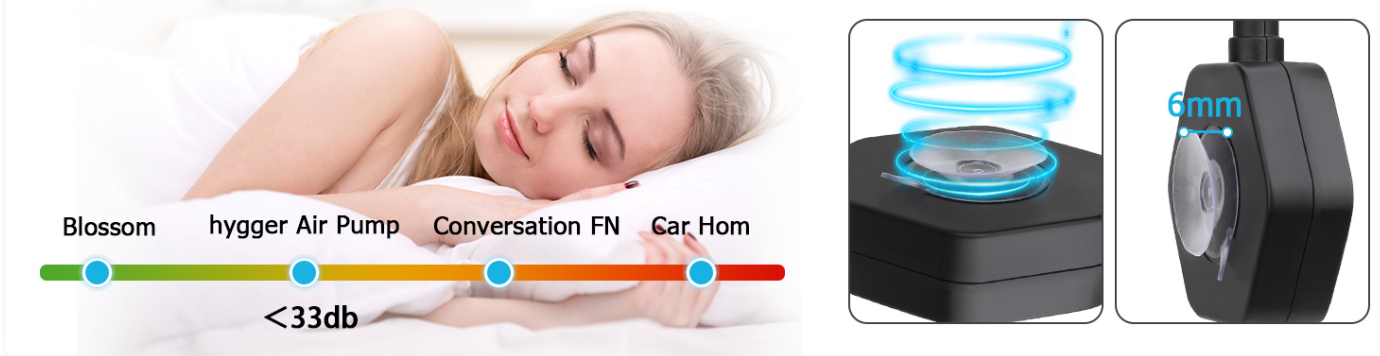
Image: The Hygger air pump is shown in a quiet setting, highlighting its ultra-silent operation, with a noise level of less than 33dB.

Special double-sided suction cup, the gap between the two suckers is 6MM, can absorb shock effectively, and you can hardly hear any vibration when working.