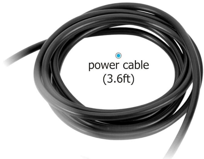
● power cable (3.6ft)

Image: A visual representation of all included components: the air pump, power adapter, air stone, air tubing, and suction cup.