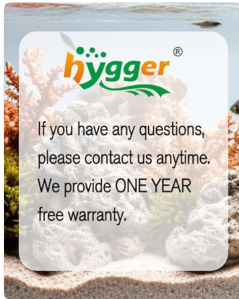
Image: Hygger's commitment to customer support and 1-year warranty.