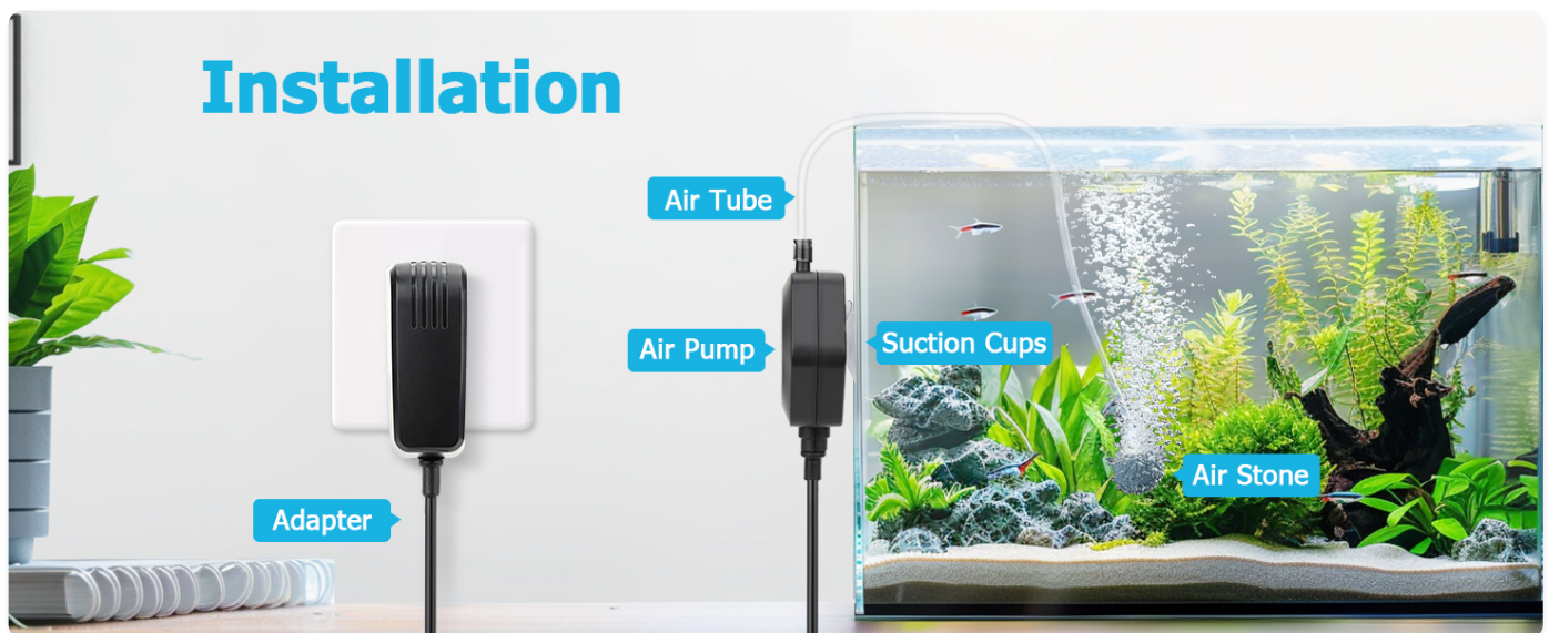
Image: Step-by-step installation diagram showing how to connect the air pump, tubing, and air stone, and place them in relation to the aquarium.