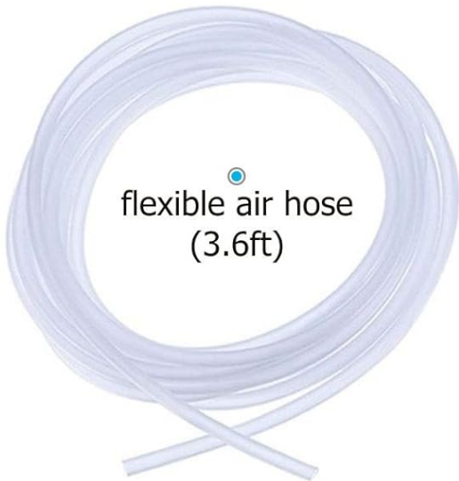
● flexible air hose (3.6ft)