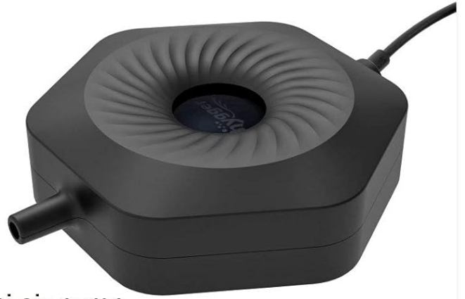
● mini air pump