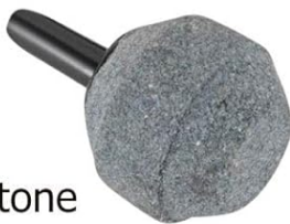
● mini air stone