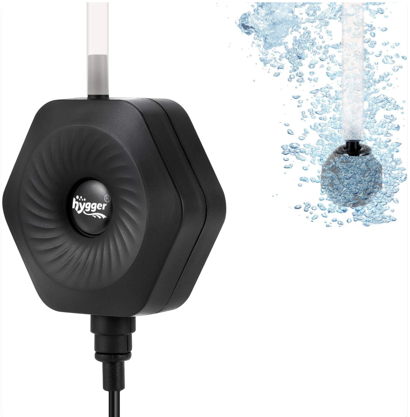
Image: The hygger Ultra Silent Mini Air Pump, showing its hexagonal shape and the air stone producing fine bubbles in an aquarium.