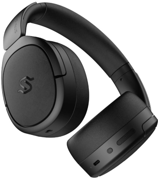
Side view of the headphones, highlighting the control buttons and ports located on the right earcup, including the USB-C port.