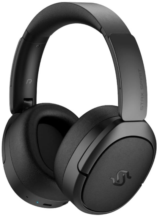
Front view of the Edifier STAX Spirit S5 headphones, showcasing their sleek black design and over-ear cups.