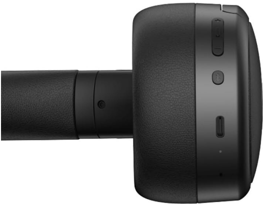
A detailed close-up of the control buttons on the earcup, showing the power button, volume controls, and the USB-C charging port.