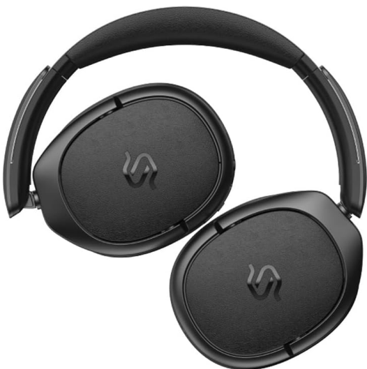
The Edifier STAX Spirit S5 headphones folded compactly, illustrating their portability and ease of storage in the included carrying case.