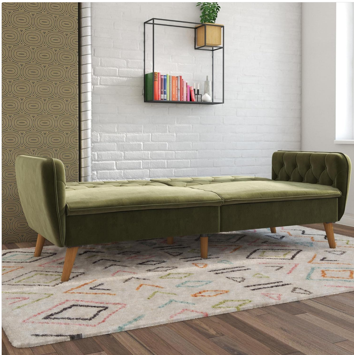
Image: The Novogratz Tallulah Memory Foam Futon in its standard sofa configuration, showcasing its velvet upholstery and tufted backrest.