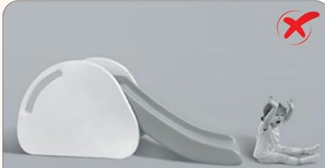
Other Slides without Buffer