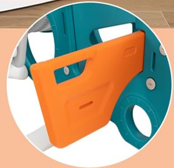
Double Openable Doors

The bus play area offers a simulated driving experience with a steering wheel, flexible lever, and openable doors.