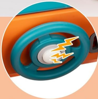
Steering Wheel with Horn