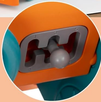
Flexible Operation Lever