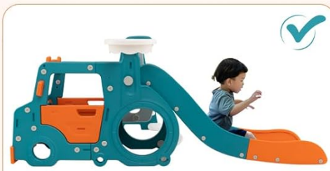
Our Slide with Buffer