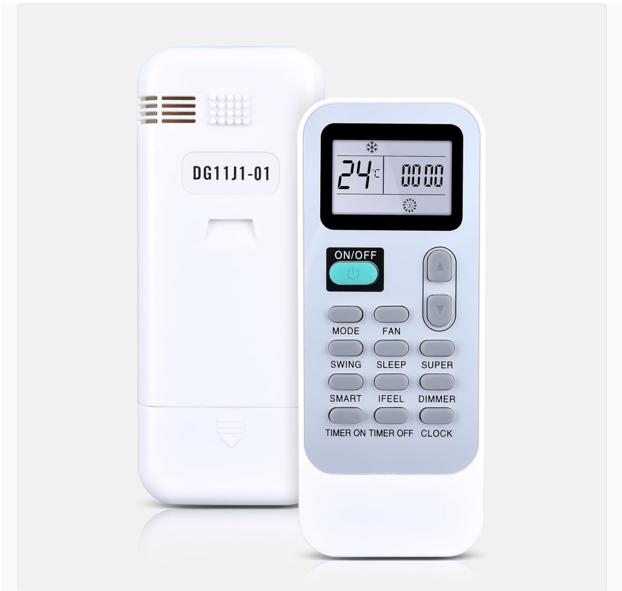
Image: Front and back view of the WDZP AC Remote Control, showing the model number DG11J1-01 on the back and the LCD display with buttons on the front.