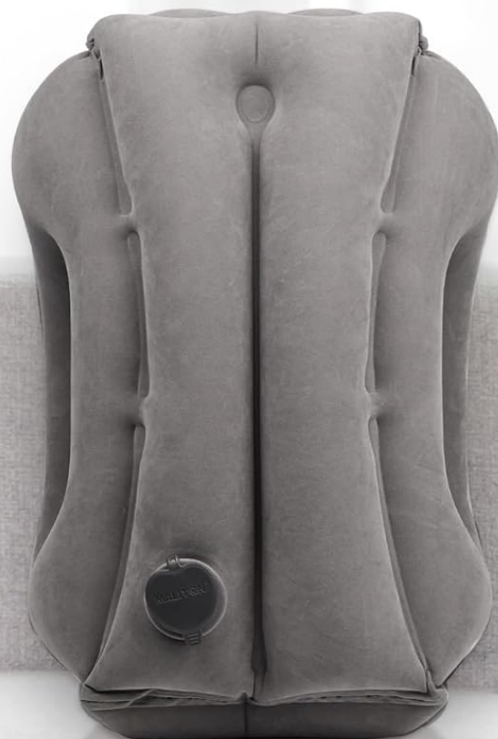
Image: Detailed view of the large air valve, illustrating the quick inflation and deflation process.