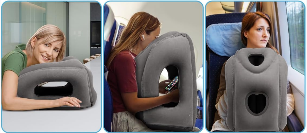
Image: Demonstrations of the pillow's versatility, showing users comfortably resting their head and arms in different orientations.