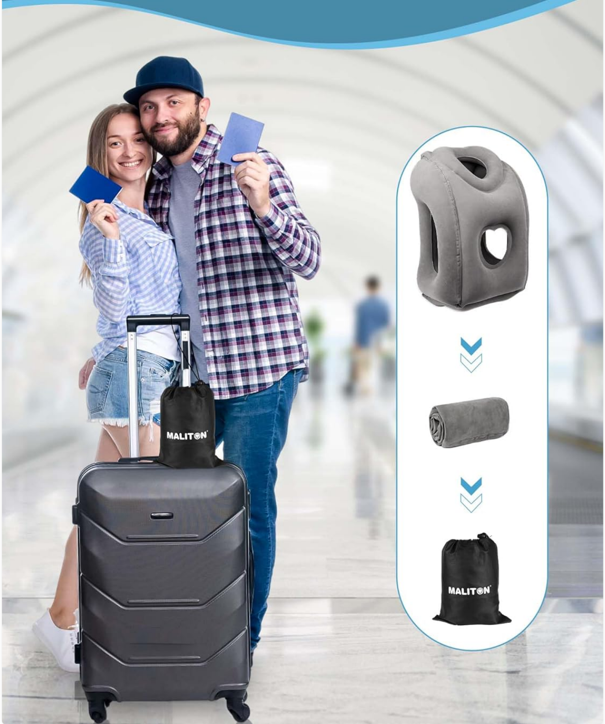
Image: Visual guide demonstrating how to easily pack and store the travel pillow in its compact bag, suitable for travel luggage.