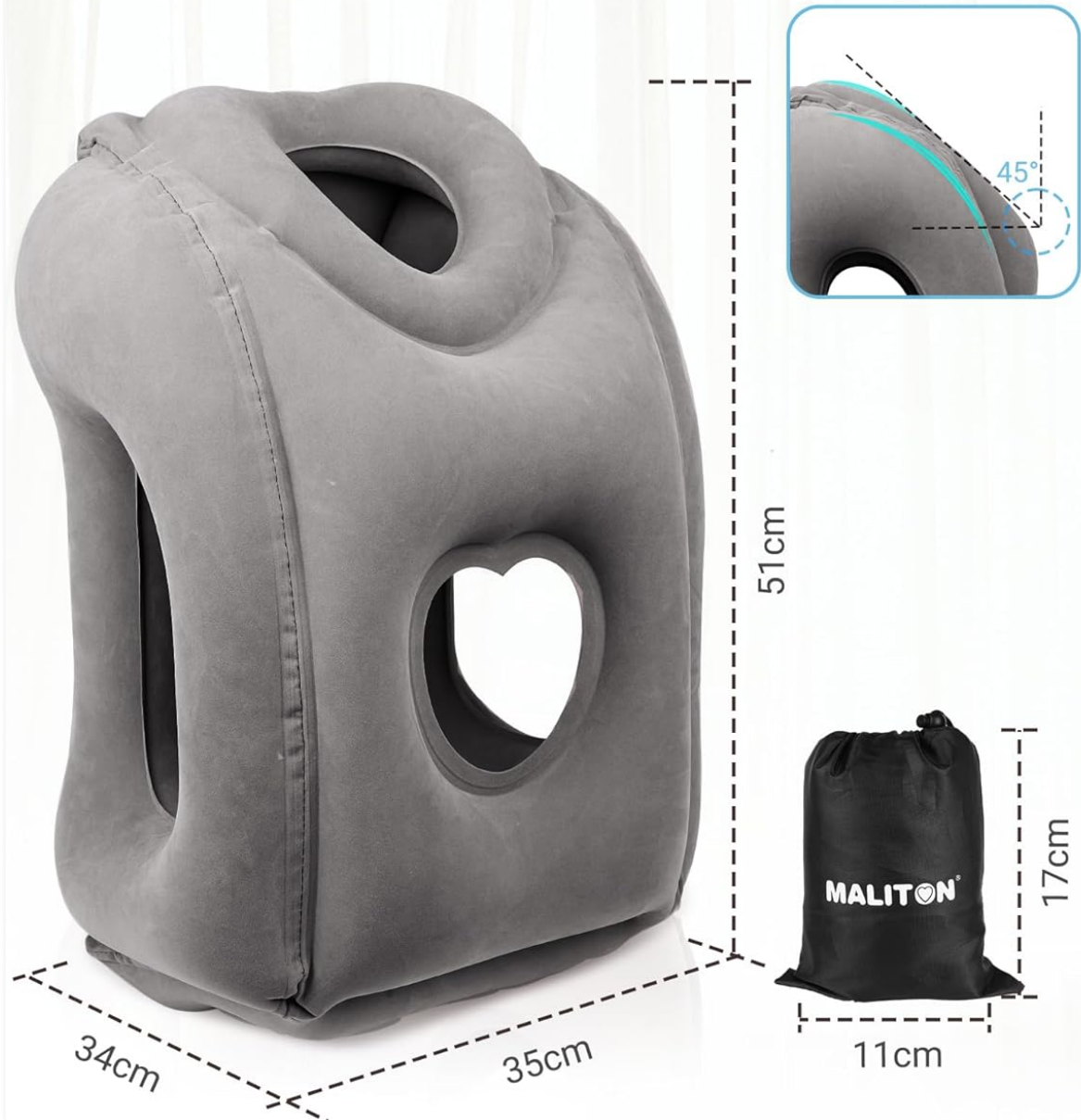
Image: Visual representation of the pillow's ergonomic angles and dimensions, including its compact storage size.