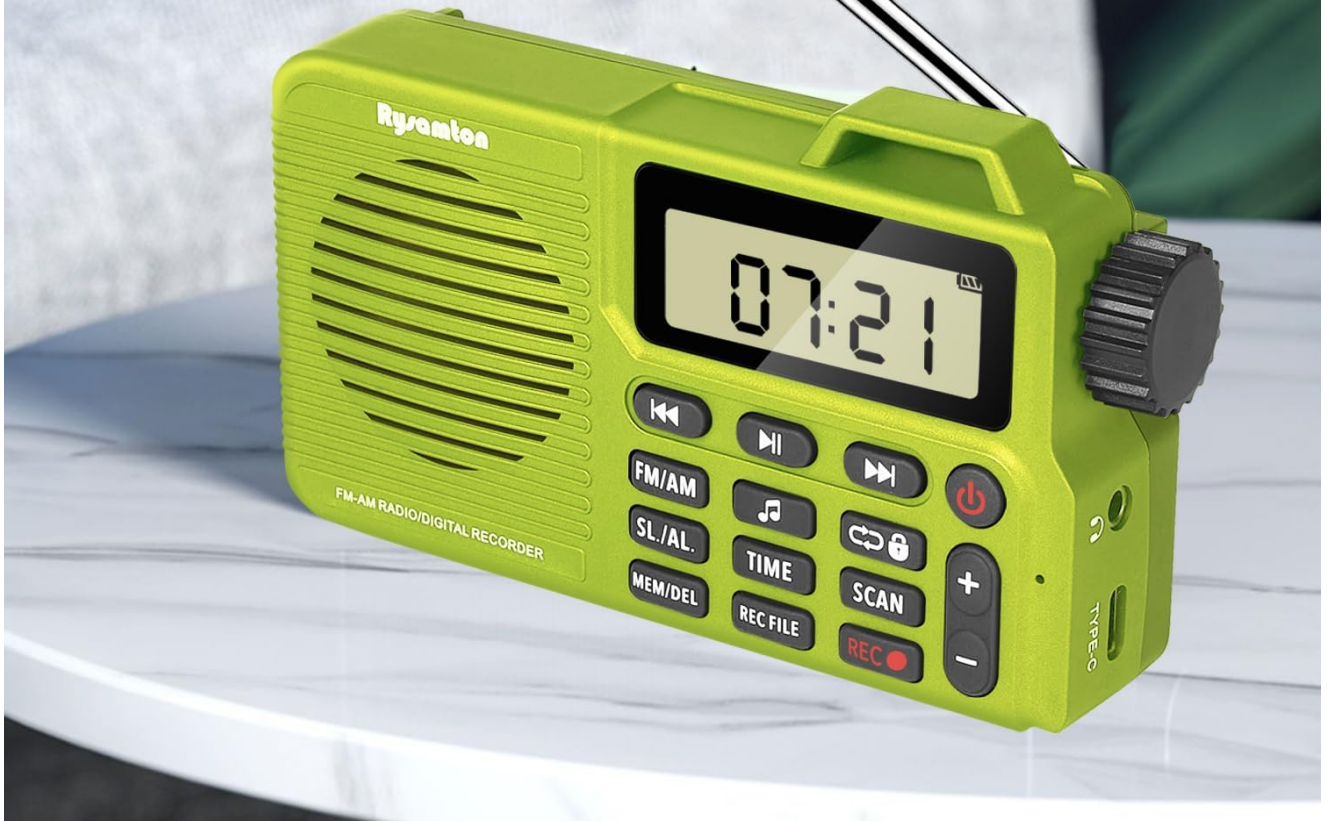
Image: An illustration highlighting the multi-functional capabilities of the Rysamton Portable Radio, including radio, recording, alarm, timer, speaker, TF card support, built-in battery, and tuning.