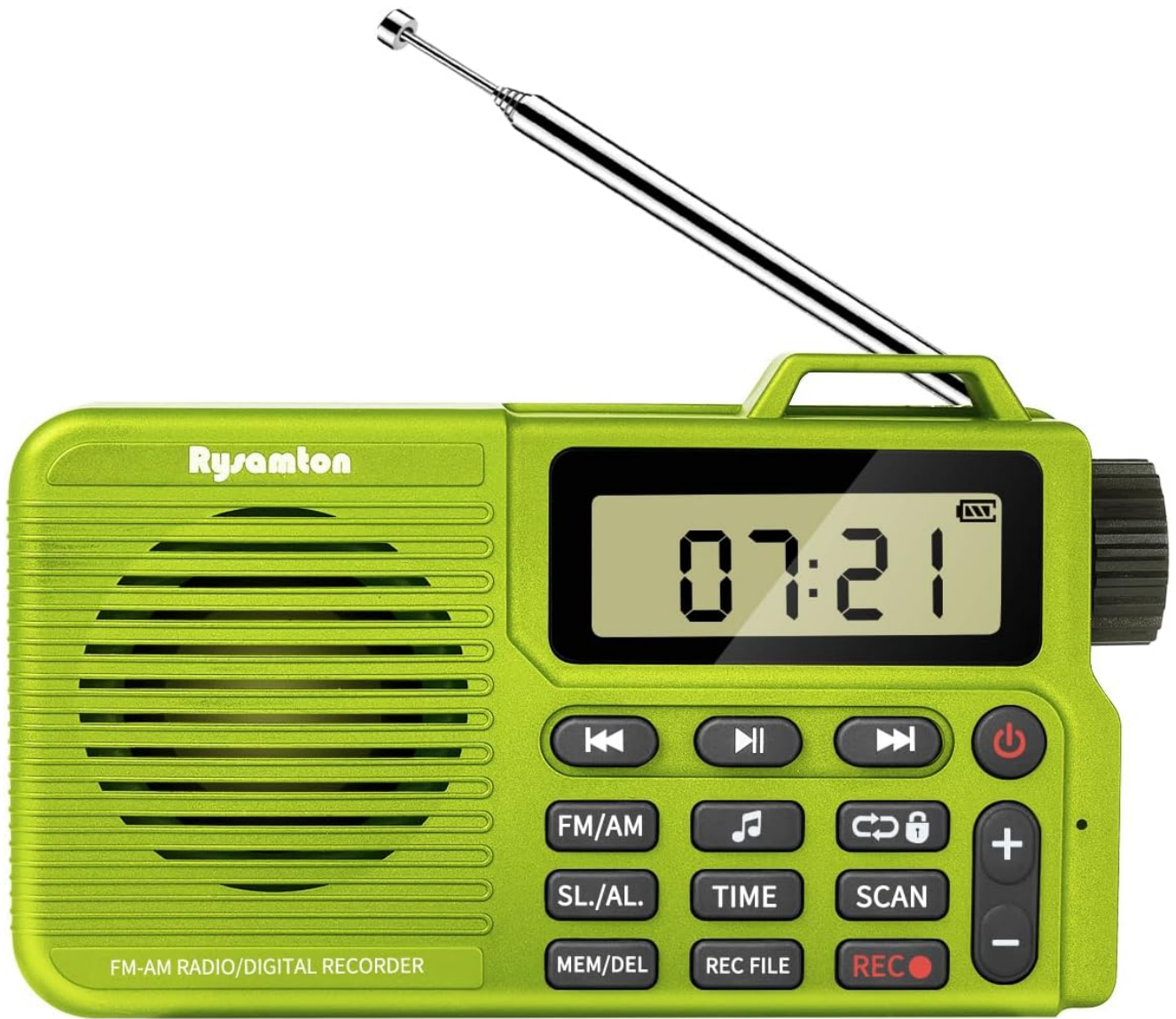
Image: Front view of the Rysamton Portable AM/FM Radio and Digital Recorder, showcasing its compact design and extended antenna.