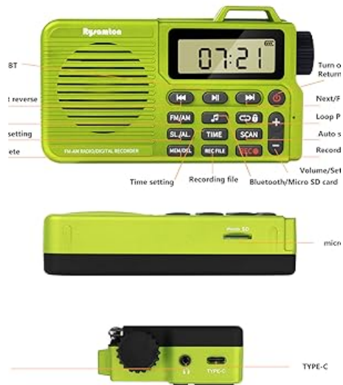
Image: A detailed diagram labeling the various buttons and ports on the Rysamton Portable Radio, such as power, volume controls, mode selection, time setting, scan, record, and memory/delete functions, along with the Micro SD slot, Type-C port, and headphone jack.