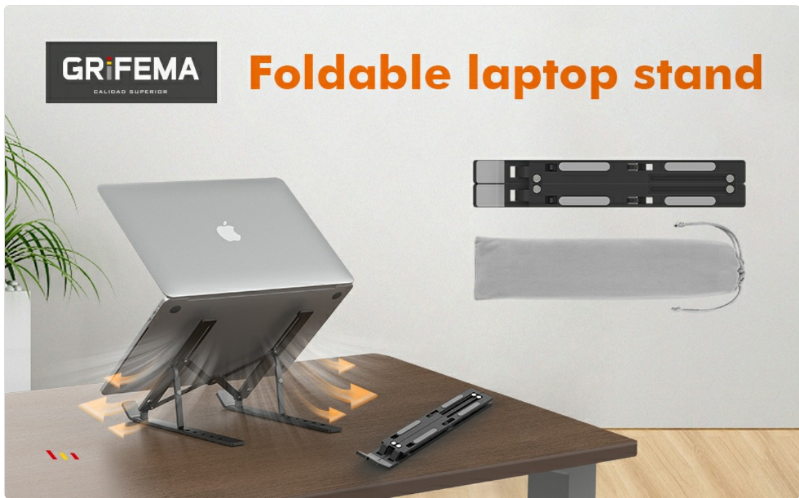
Figure 2: Illustration of the 6 adjustable height and angle settings for ergonomic use.