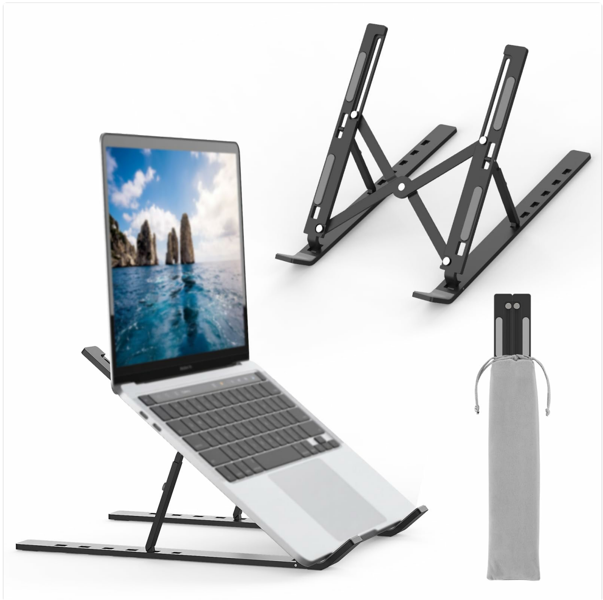
Figure 1: GRIFEMA GB1054B Laptop Stand in use.