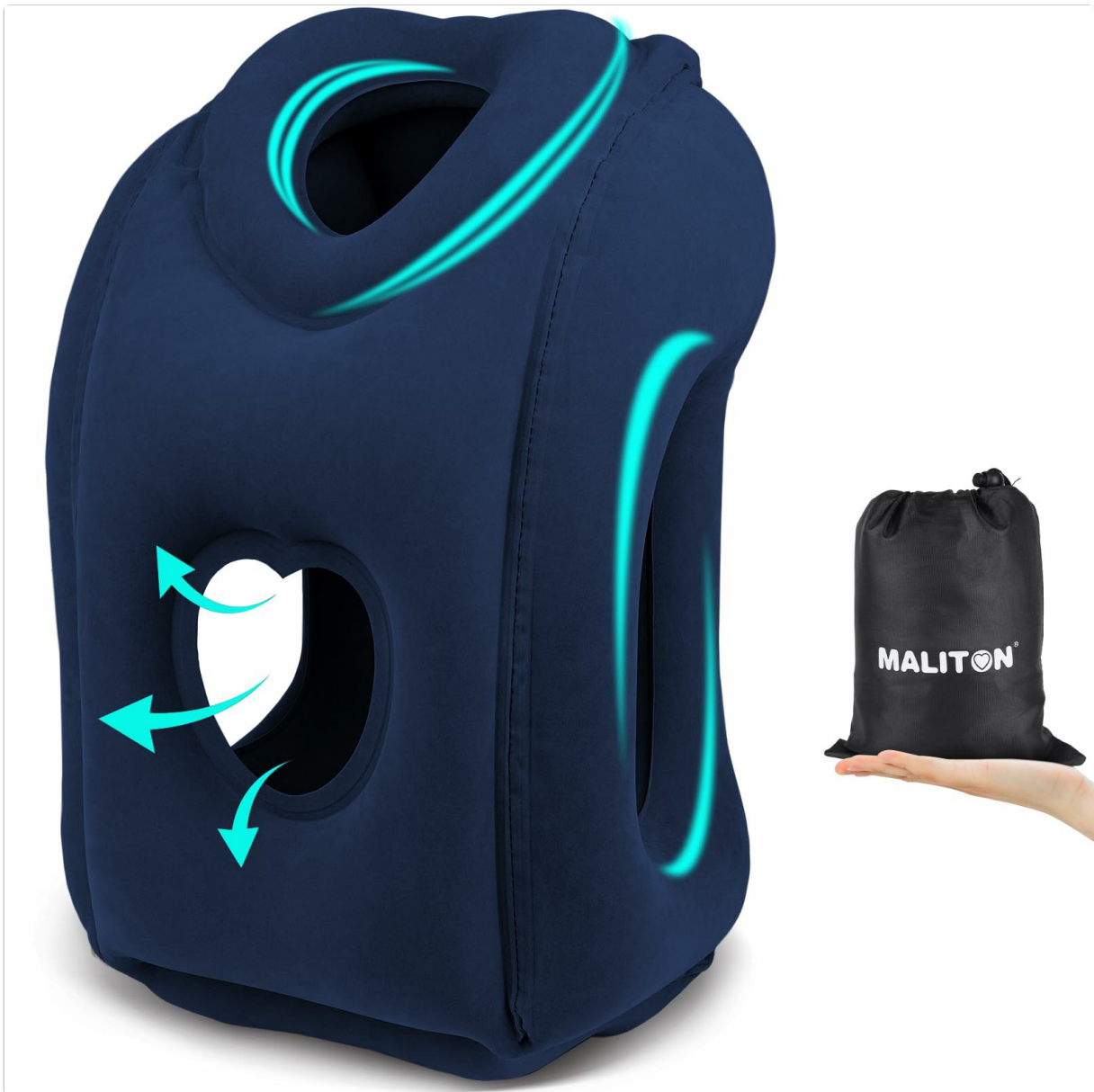
Image: Maliton Inflatable Travel Pillow in blue, showcasing its compact design.