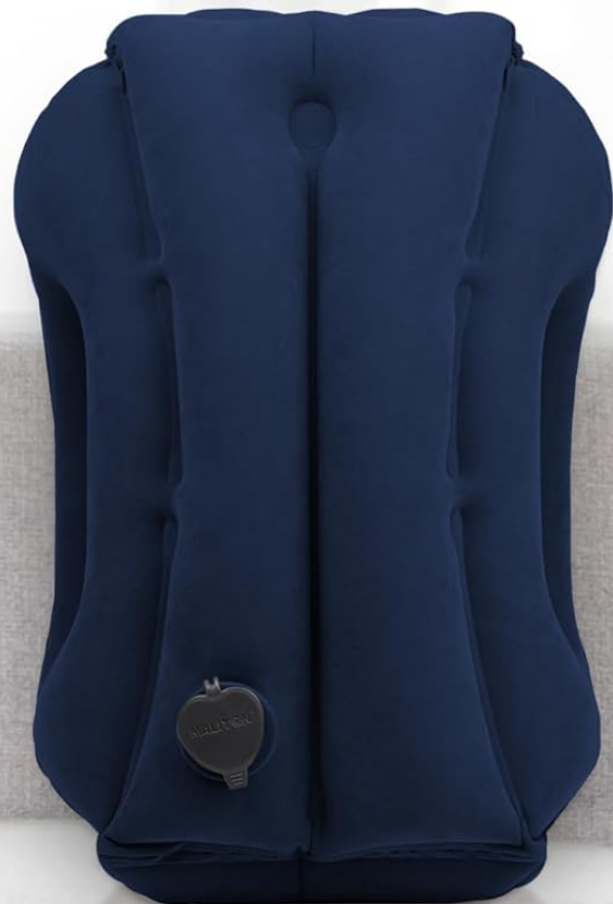
Image: Detail of the large air valve, indicating quick inflation and deflation times.