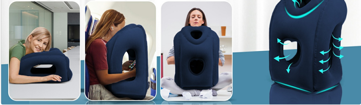
Image: Illustrates different ways to use the pillow, including resting the head forward, using it as a side cushion, or as a backrest.

Your browser does not support the video tag.