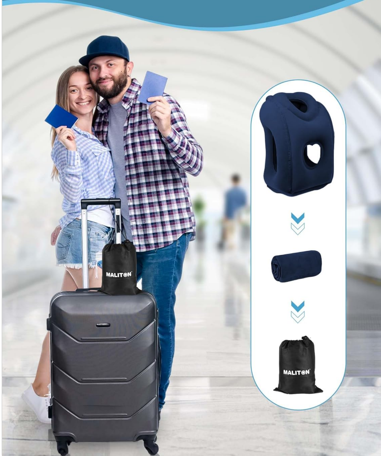
Image: Illustrates the compact size of the pillow when packed, showing it easily fitting into a small storage bag for travel.