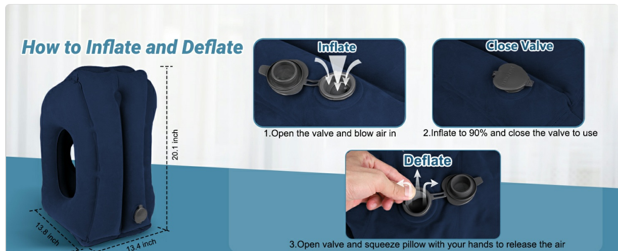
Image: Step-by-step guide on deflating the pillow by opening the valve and squeezing, then folding and placing it into the storage bag.

The deflated pillow measures approximately 4.3 x 4.3 x 6.7 inches and weighs 0.98 lbs, making it highly portable.