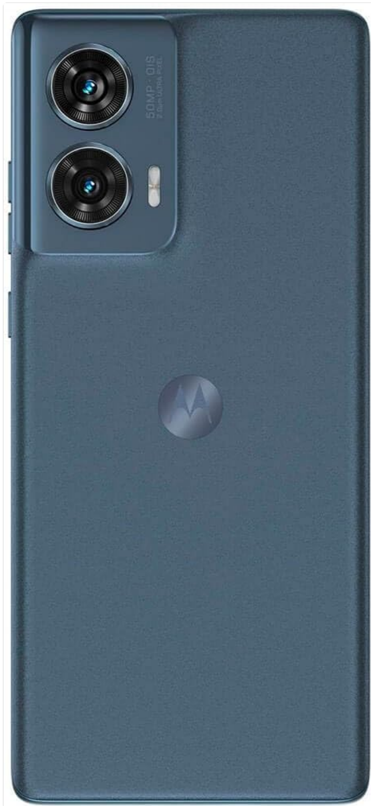
Figure 3.2: Back View. This image displays the rear of the device, featuring the dual camera system with a 50MP OIS main sensor and the iconic Motorola batwing logo.