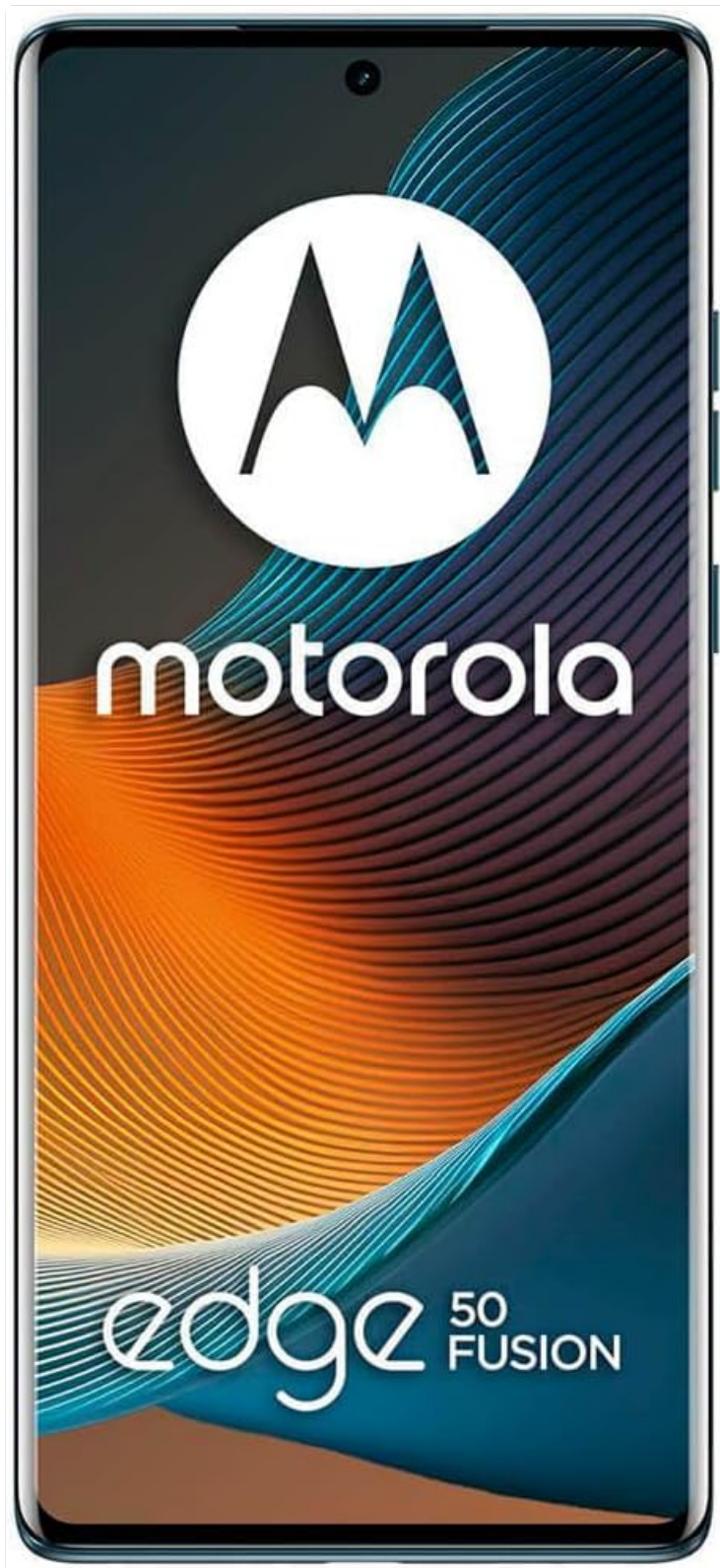
Figure 3.1: Front View. This image shows the front of the Motorola Edge 50 Fusion 5G, highlighting its large display and front camera cutout.