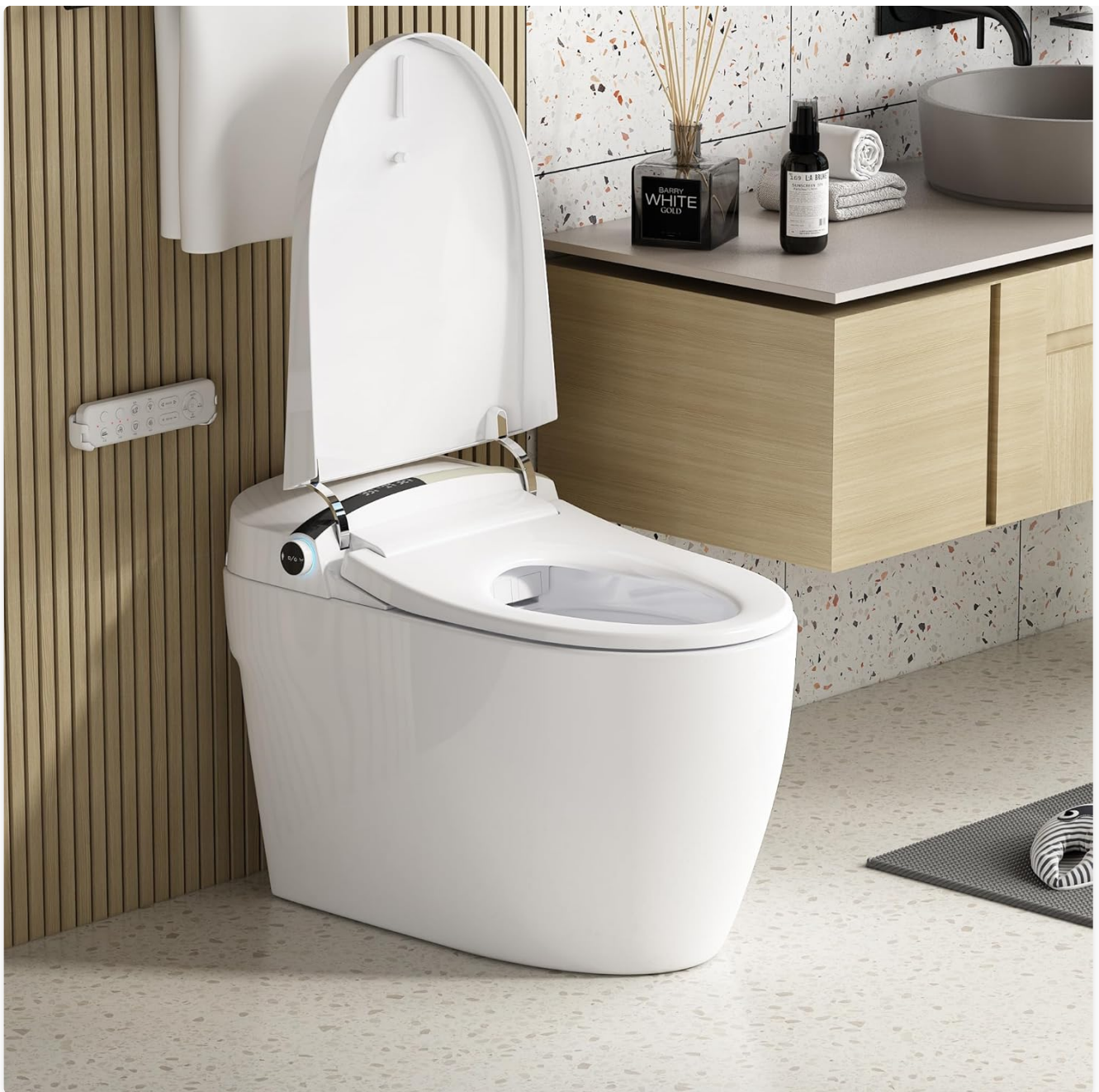
Image: The Flodream Smart Toilet FD-7709, showcasing its sleek design and integrated features.