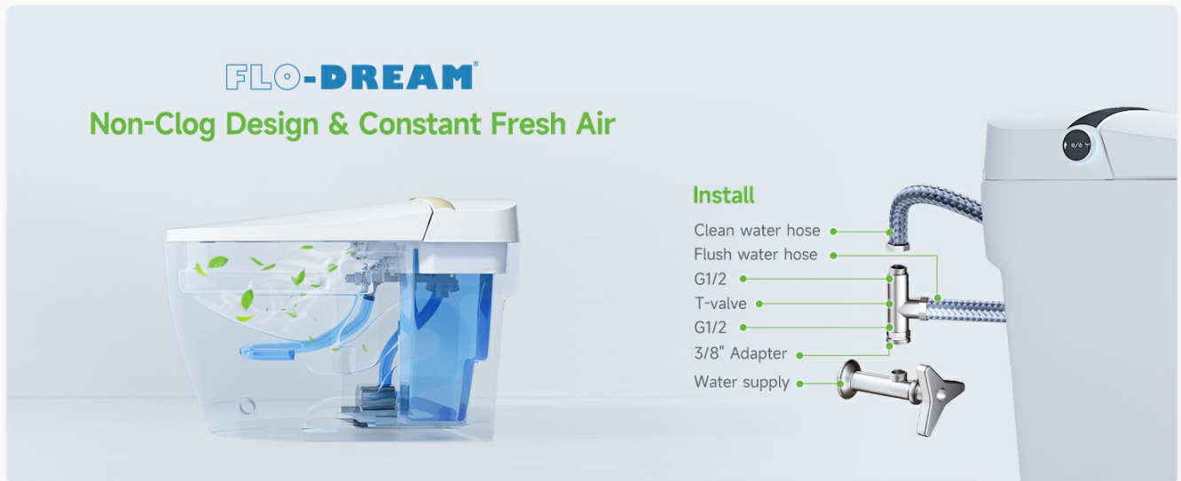
Image: The internal design highlighting the non-clog mechanism and air purification system.