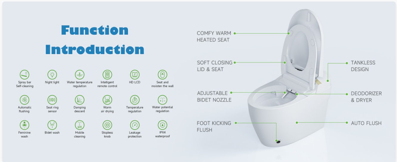
Image: Overview of the smart toilet's functions, including self-cleaning, night light, temperature regulation, and automatic flushing.