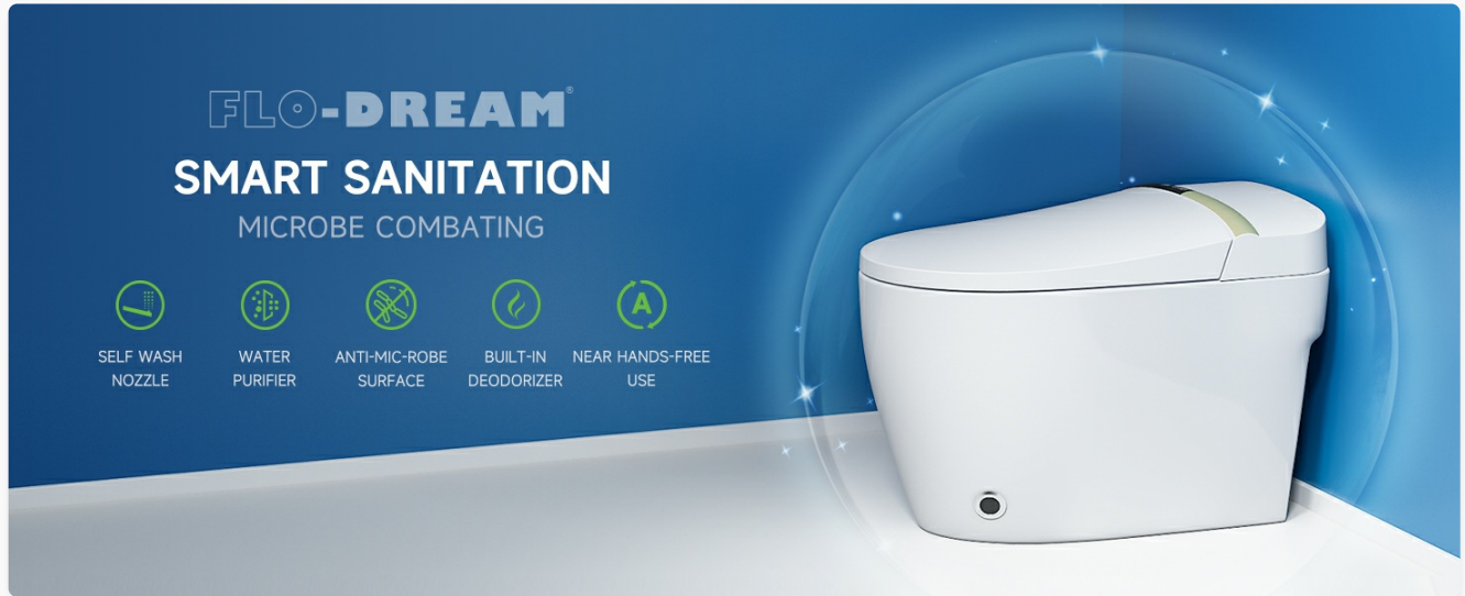
Image: Flodream's commitment to customer service and support.

Please contact us directly if you have any questions about the package or require assistance with installation or operation. We are here to address your concerns promptly.