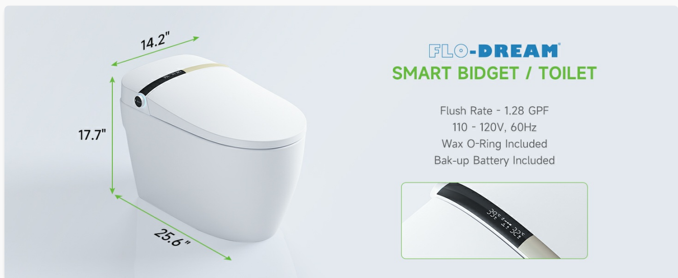
Image: Product dimensions for the Flodream Smart Toilet.