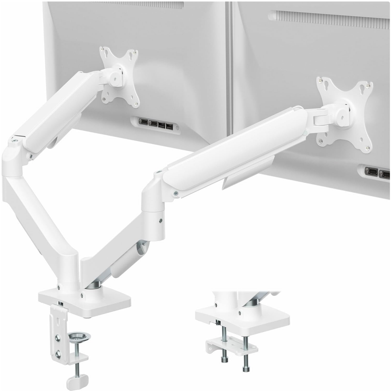
Image showing the VIVO Dual Monitor Desk Mount with both C-clamp and grommet base options.