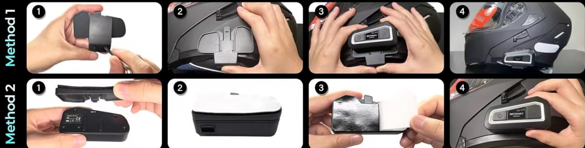
Image 2: Illustrates two types of microphones suitable for different helmets and two installation methods for the main unit.