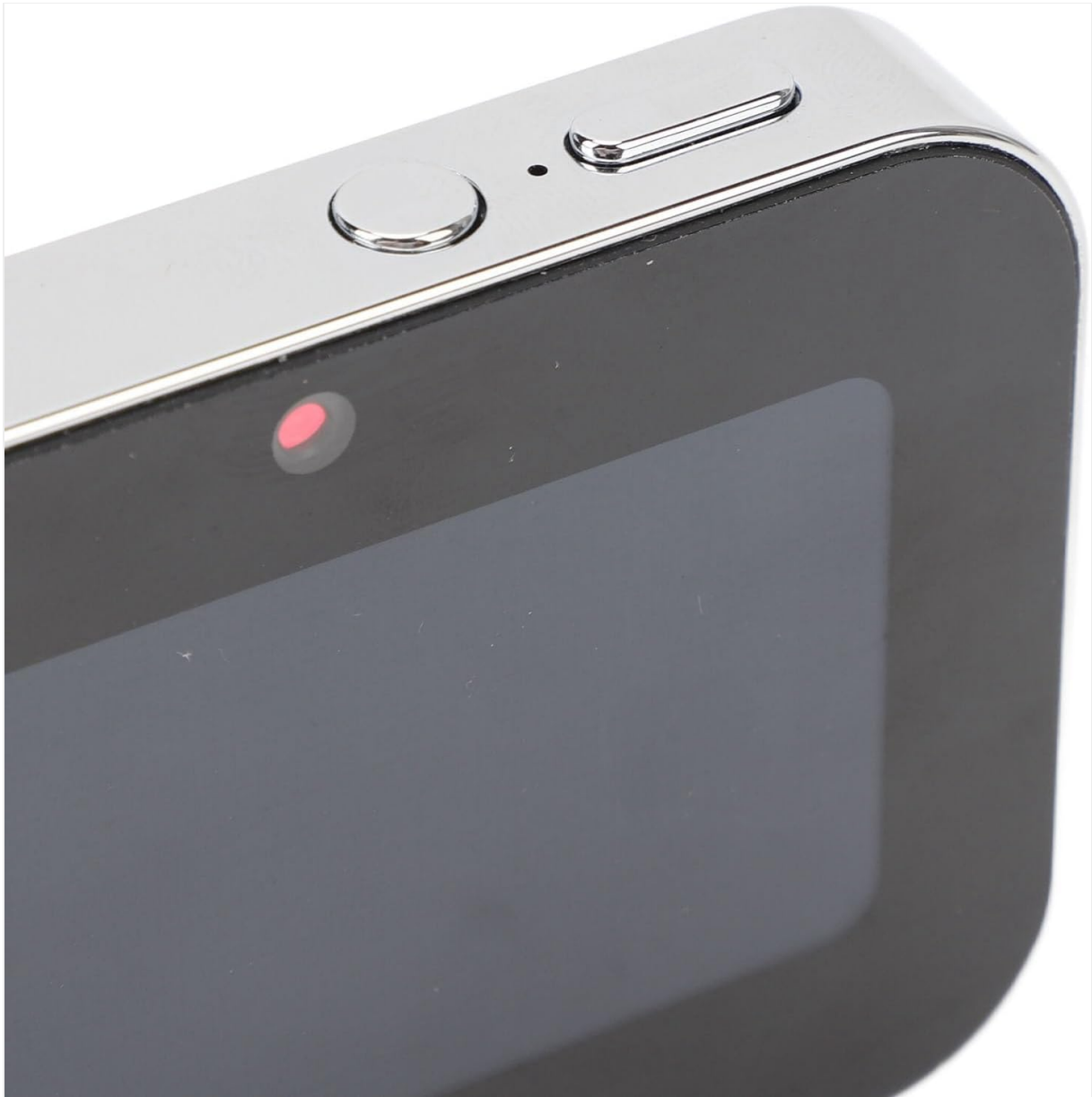
Image: Close-up of the top of the Jectse camera, highlighting the power button and shutter button.