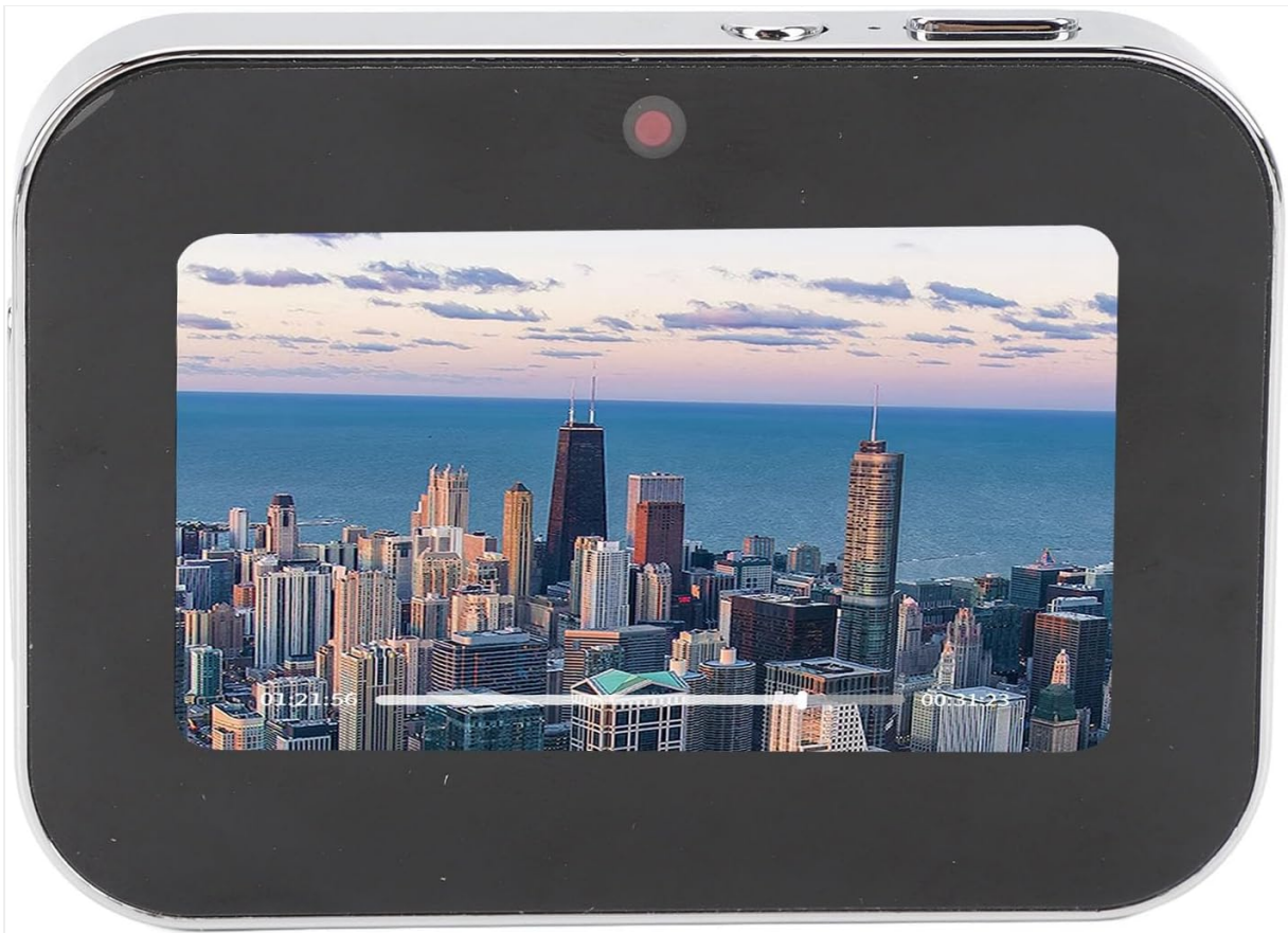
Image: The Jectse camera screen showcasing a vibrant city landscape, demonstrating image playback.