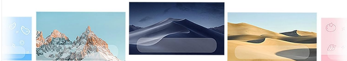
Image: Jectse camera screen demonstrating theme switching and the lock screen alarm clock feature.