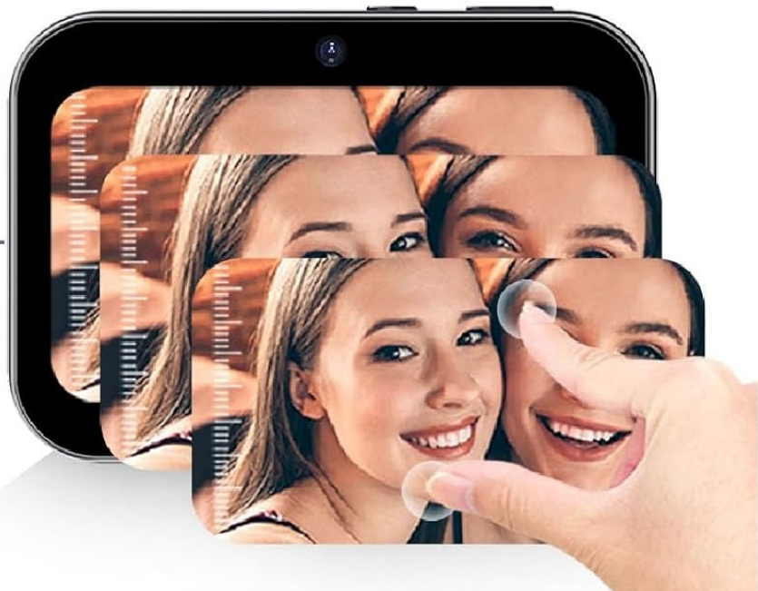
Image: Jectse camera screen showing the alarm clock settings interface and an illustration of photo touch control.