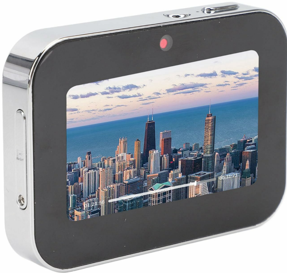
Image: Jectse 4K 64MP Vlogging Camera and included accessories: USB cable, lanyard, screwdriver.