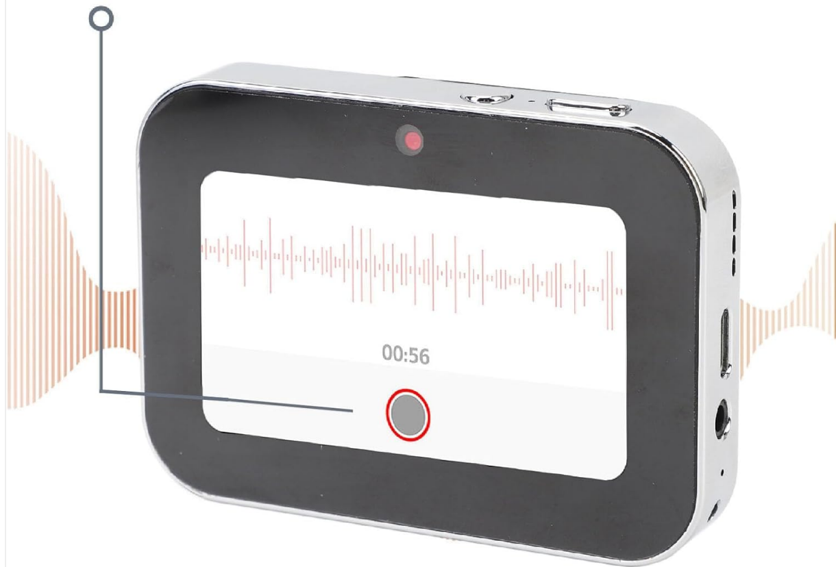
Image: The Jectse camera screen displaying the lossless recording function, with a visual representation of sound waves.