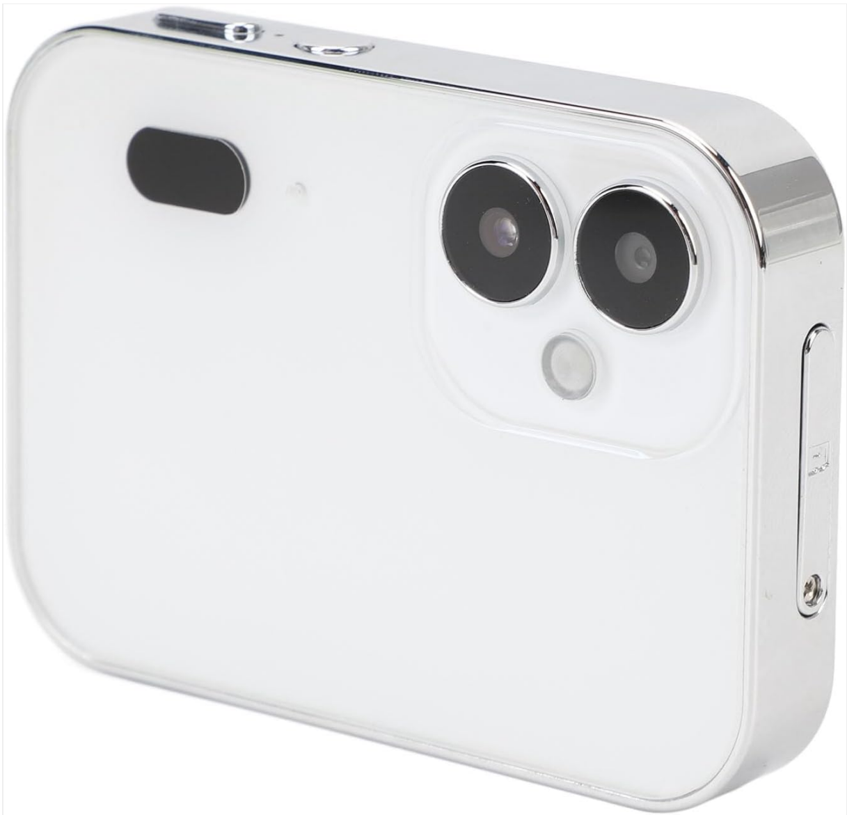
Image: Side view of the Jectse camera, illustrating the location of the memory card slot.