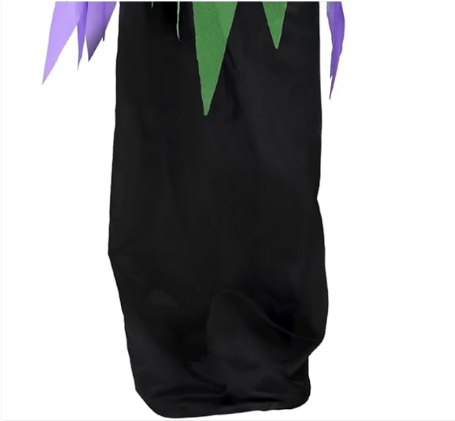
Image: A complete view of the 72-inch Standing Popup Head Witch Animatronic, showcasing its full height and design.