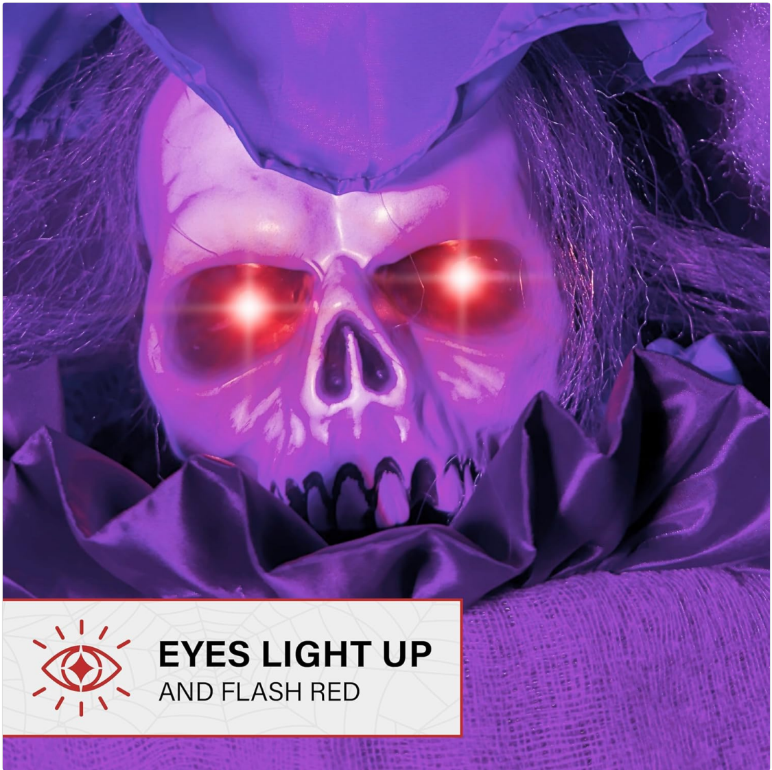
Image: A detailed shot emphasizing the red LED lights in the witch's eyes, which also flash.