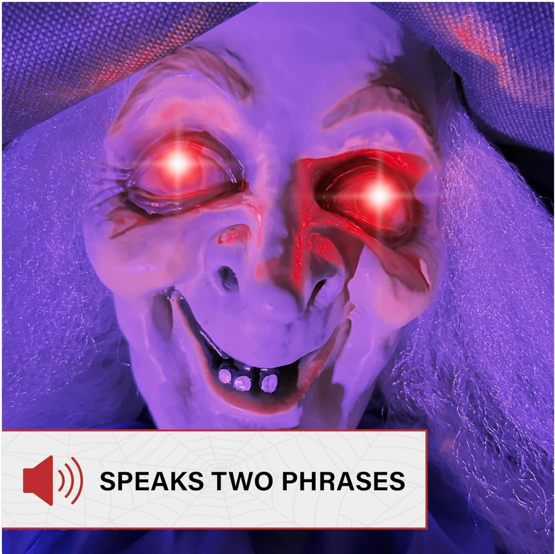
Image: A close-up of the witch's face, indicating its ability to speak two phrases.