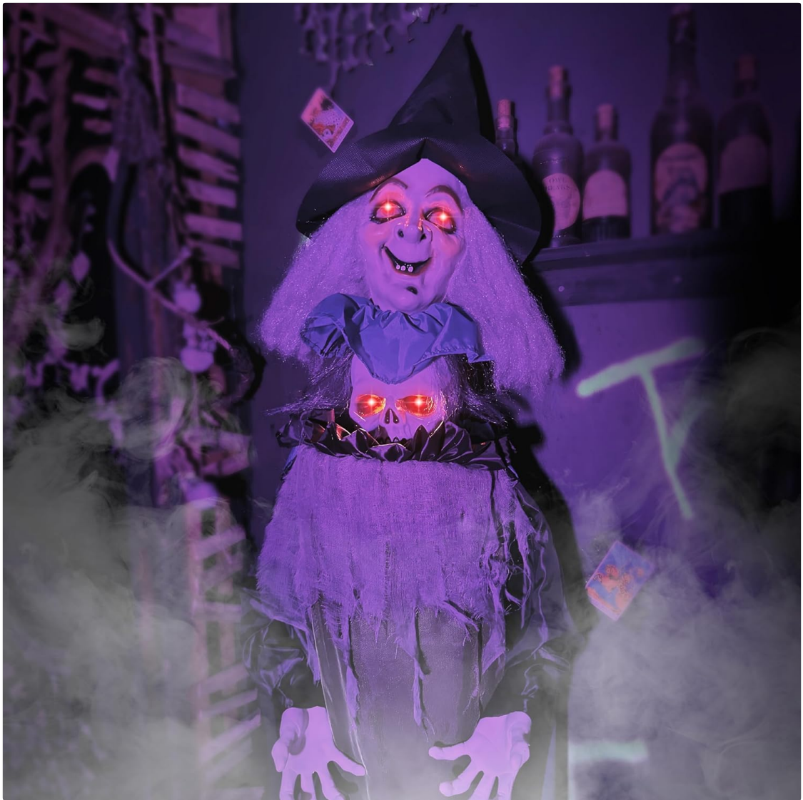
Image: A close-up of the animatronic's two heads, the upper witch head and the lower skull head, both featuring glowing red LED eyes.