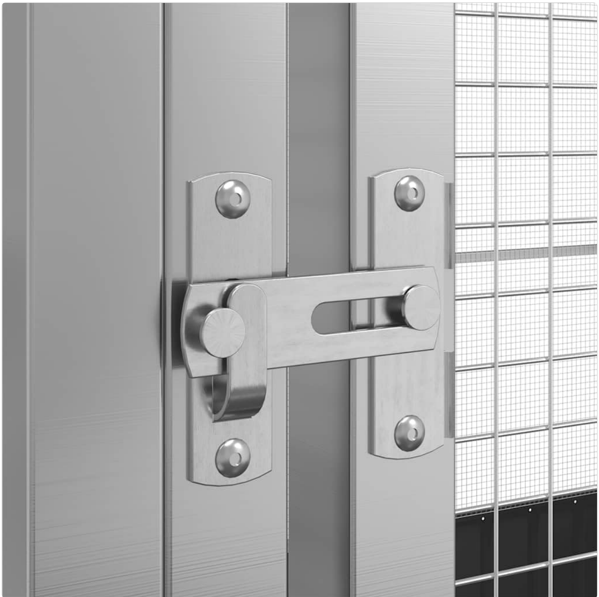
Figure 2: Close-up view of the secure, spring-loaded latch mechanism on the aviary door.