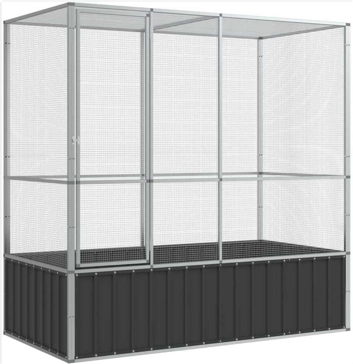
Figure 1: Full view of the vidaXL Aviary Bird Cage, showcasing its galvanized steel construction and spacious design.