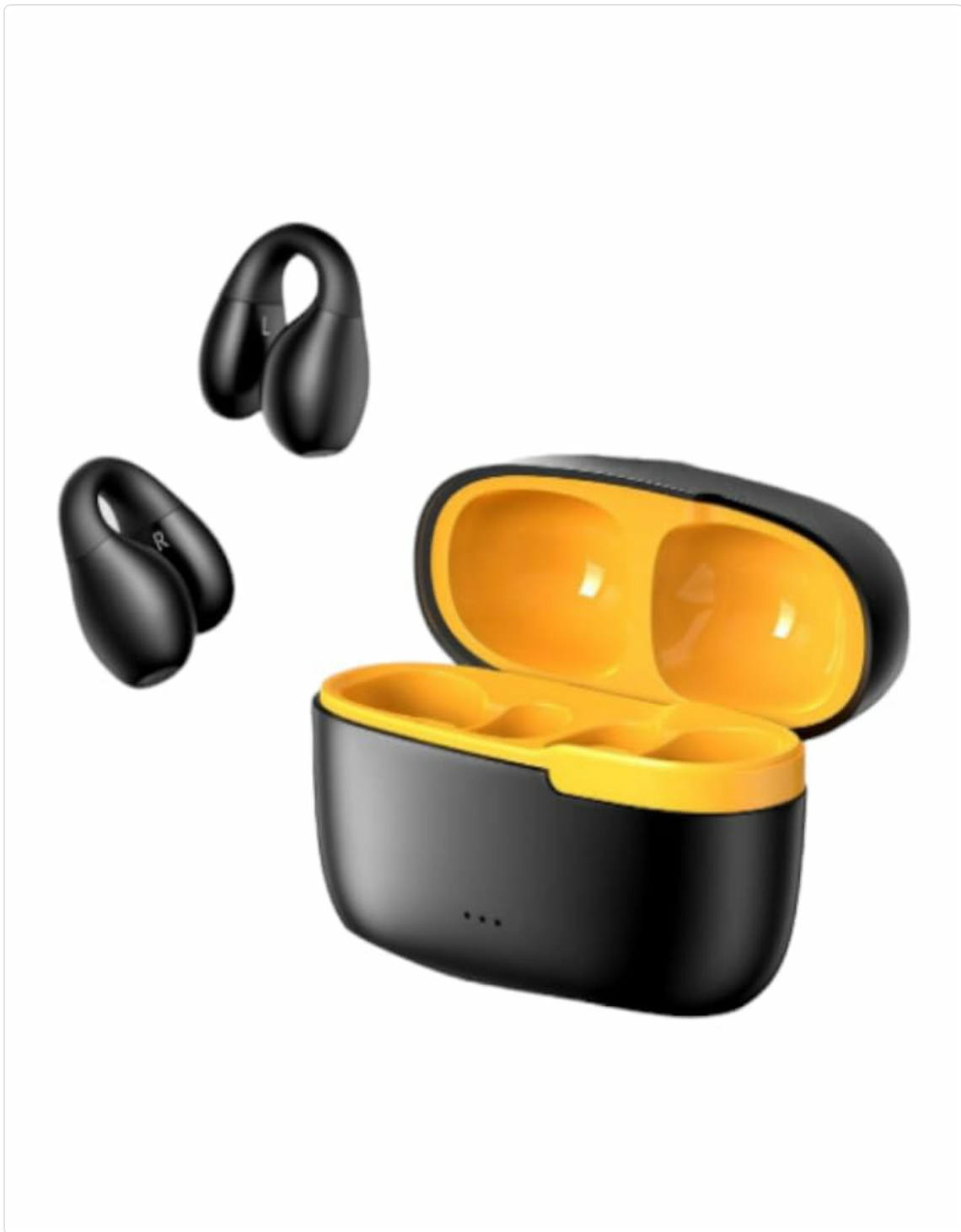
Image: REMAX CozyBuds W11 Earphones and Charging Case. This image displays the earphones in their charging case, highlighting their compact design.