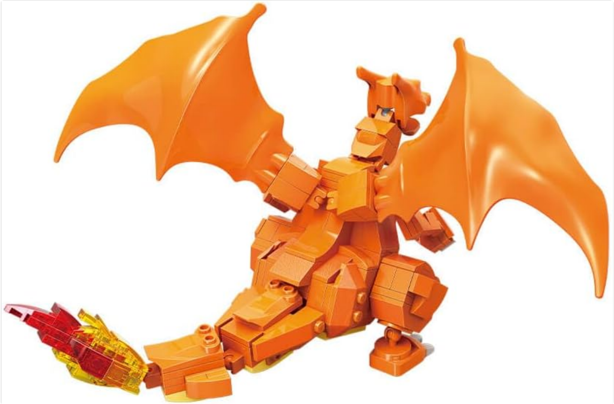
Image: Side view of the fully assembled Keeppley Pokemon Charizard figure, highlighting its wings and tail details.