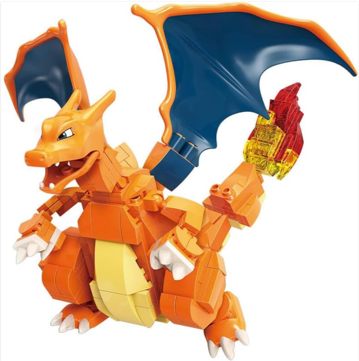
Image: Front view of the fully assembled Keeppley Pokemon Charizard figure, showcasing its detailed design and vibrant orange color.