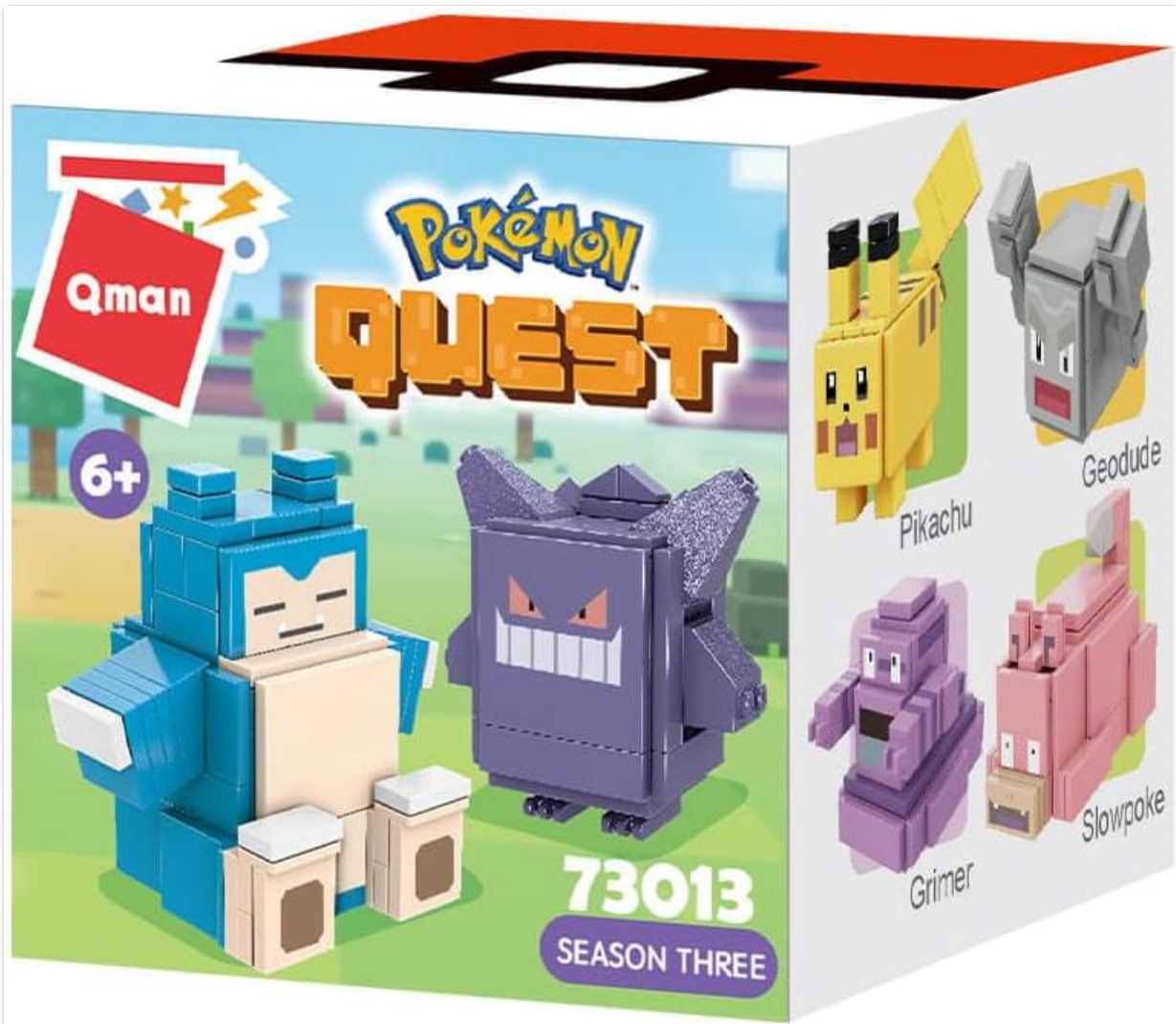
Image: The packaging for the Bingo Qman Pokémon Quest Blind Box 3rd Wave, displaying several possible characters including Snorlax, Gengar, Pikachu, Geodude, Grimer, and Slowpoke. The box indicates "6+" for age and "73013 Season Three".