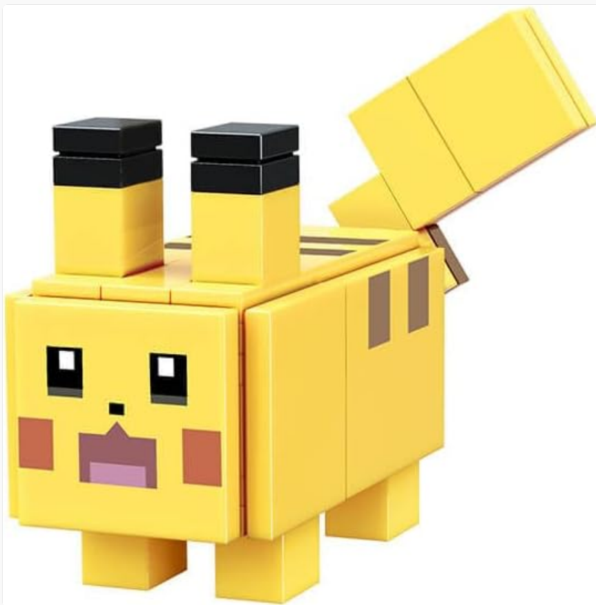
Image: A fully assembled Pikachu building block figure, showcasing its blocky design, black-tipped ears, and brown stripes on its back. The tail appears to be articulated.