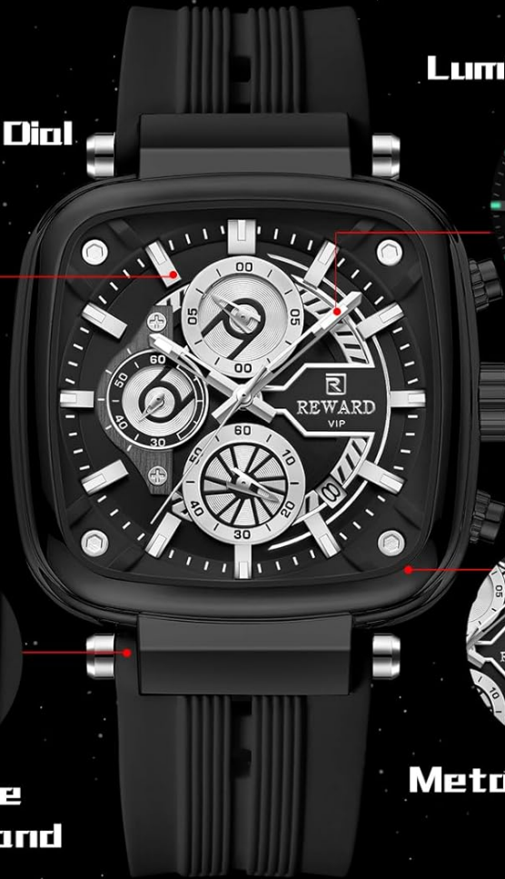
Image: Detailed diagram highlighting the 1/10 seconds dial, minute dial, seconds dial, calendar, luminous display, dust-free silicone band, and metallic square case.