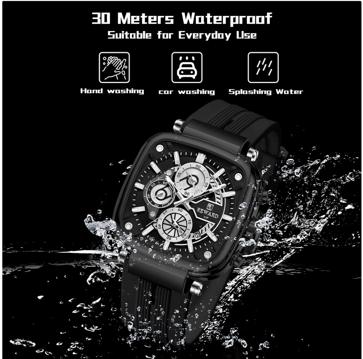
Image: The watch partially submerged in water, illustrating its 30-meter water resistance. This level is suitable for daily activities like hand washing, car washing, and light splashing.

This watch is rated for 3ATM (30 meters) water resistance. This means it is suitable for everyday use and can withstand splashes, rain, and brief immersion in water, such as during hand washing or car washing. It is not suitable for swimming, diving, or showering with hot water, as steam can penetrate the seals.