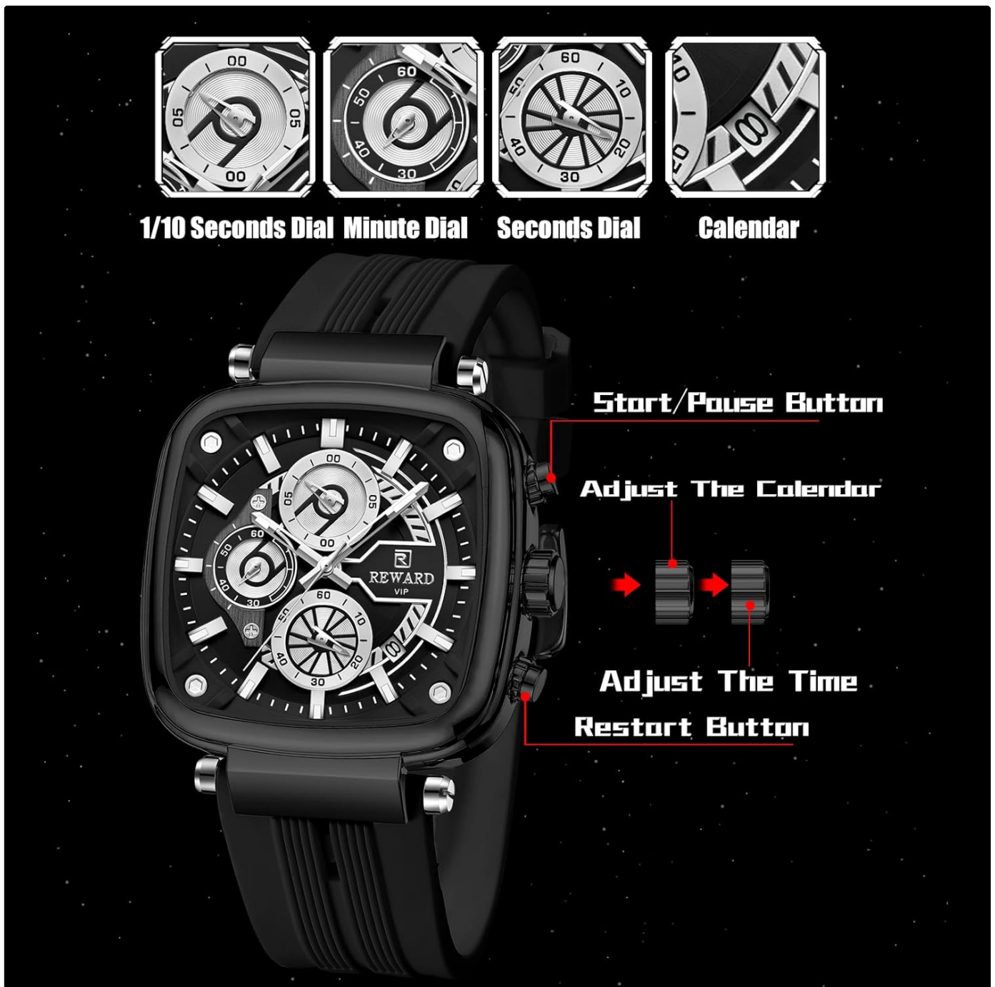
Image: Illustration of the watch's side controls, indicating the functions of the crown and push-buttons.