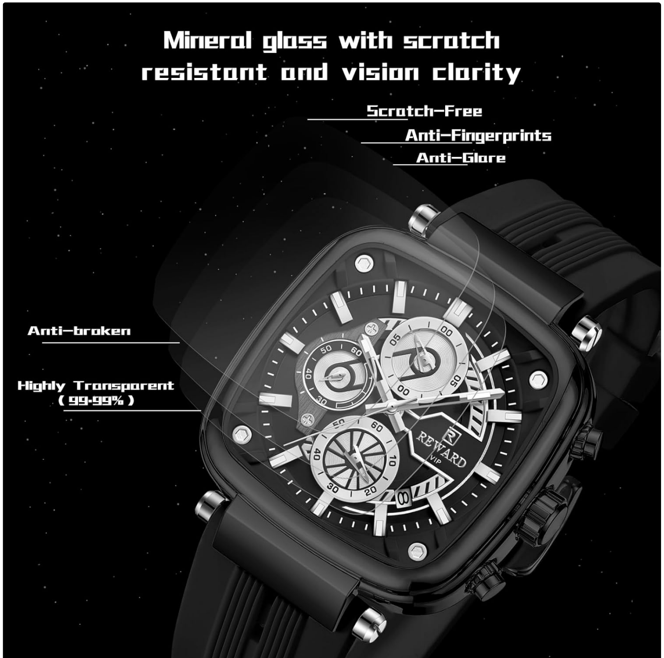
Image: Close-up of the watch crystal, emphasizing its mineral glass construction for scratch resistance and clarity.