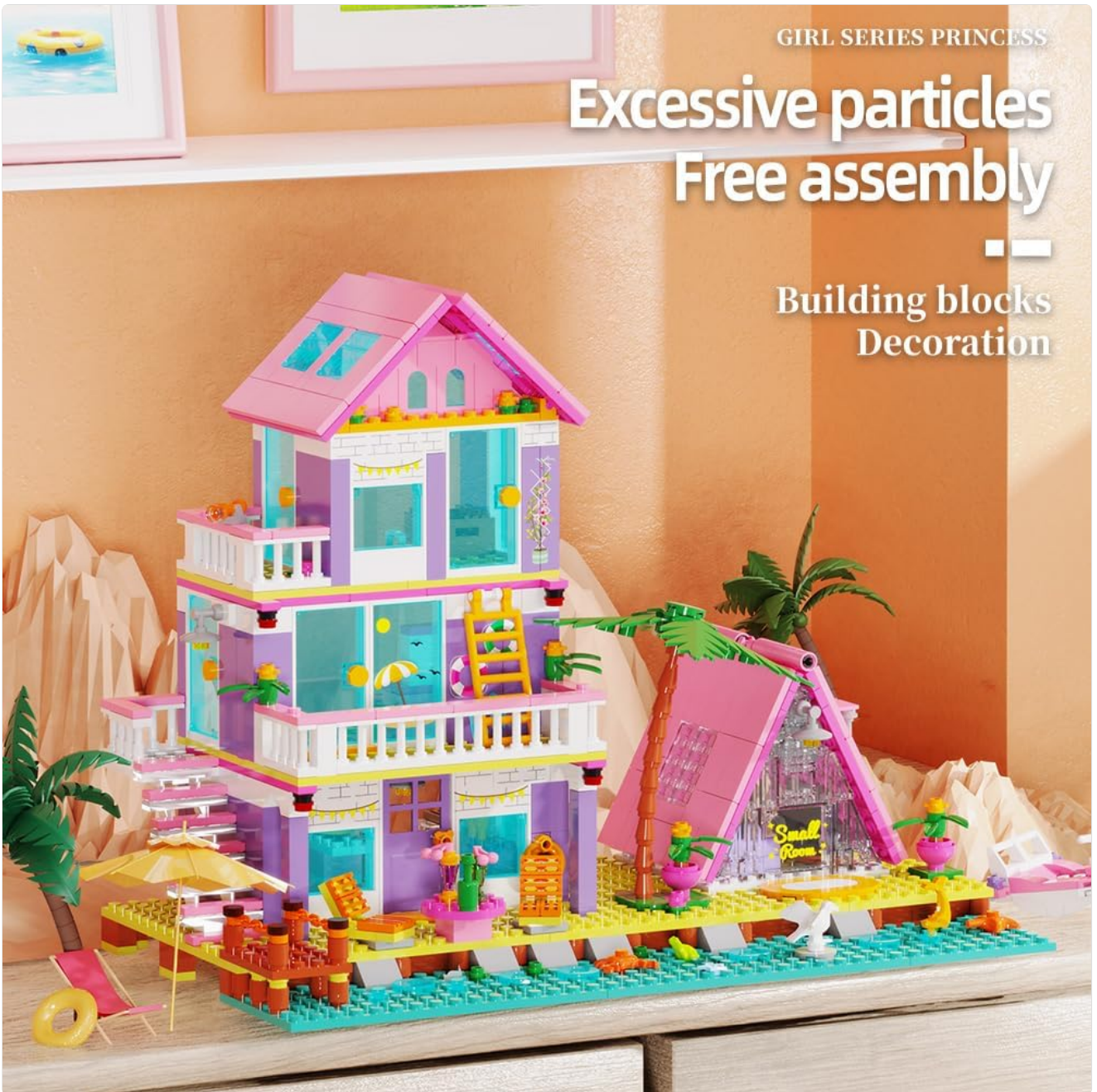
Image: A view of the building set during assembly, showing the various components and the detailed nature of the construction.