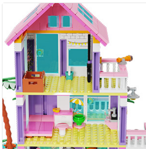
Image: A close-up of the interior of the beach house, revealing the detailed room layouts and accessories.