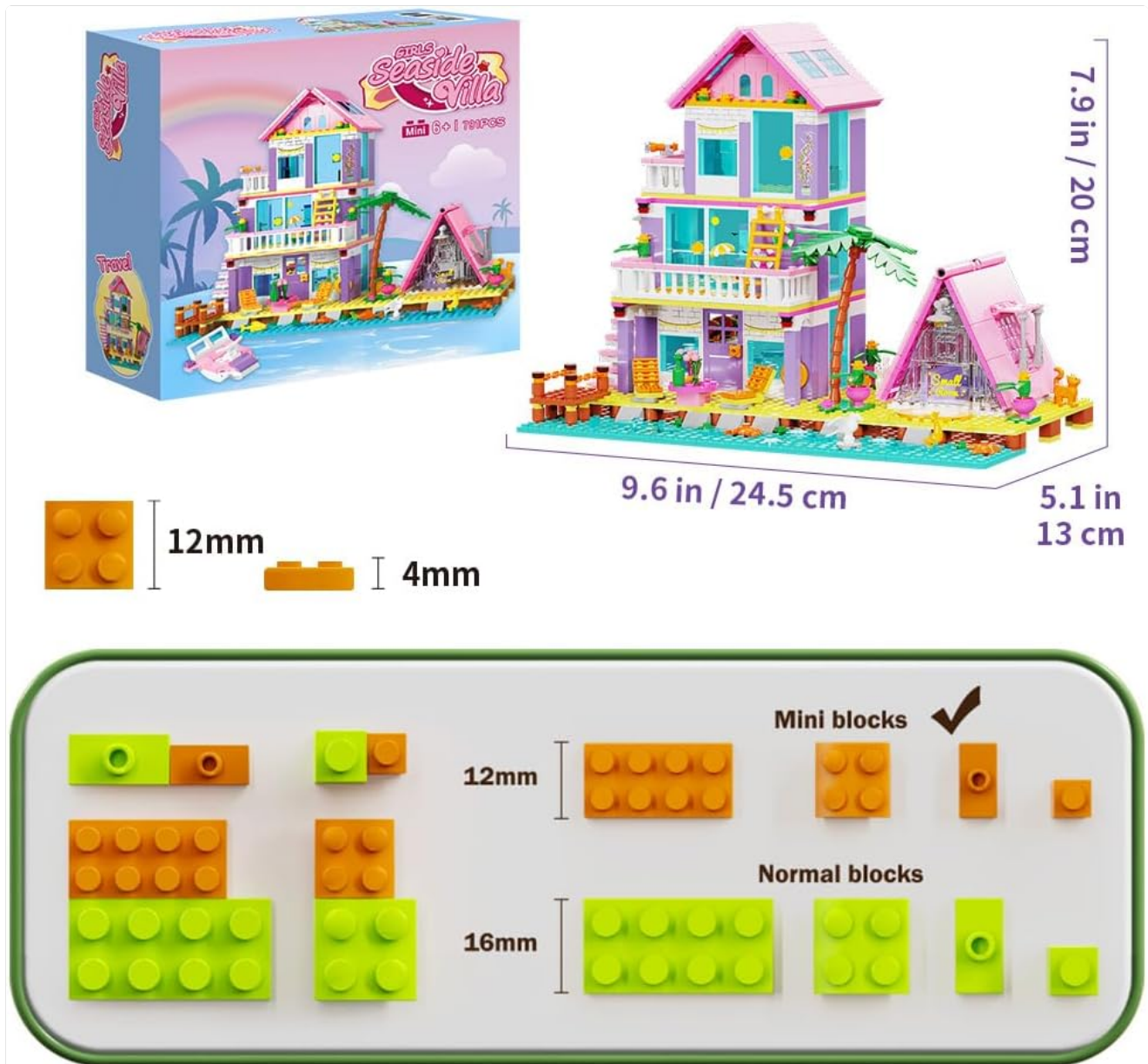
Image: A visual representation of the assembled product's dimensions and a comparison illustrating the size of the mini bricks versus standard building blocks.