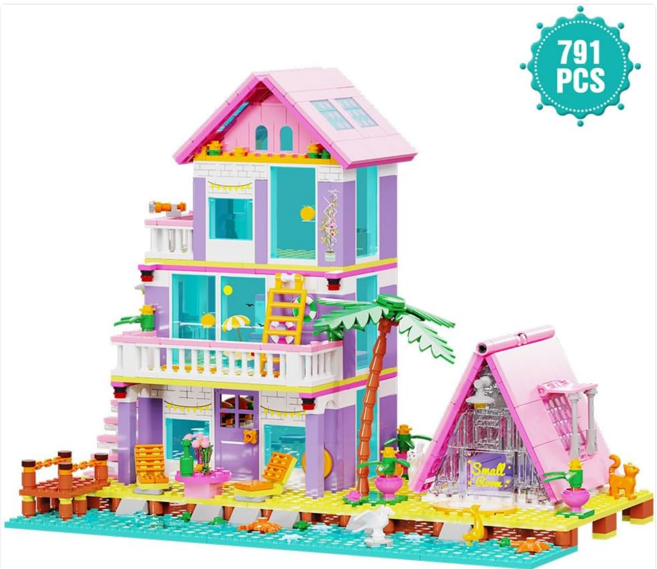
Image: The building set box indicating the total number of 791 pieces included.