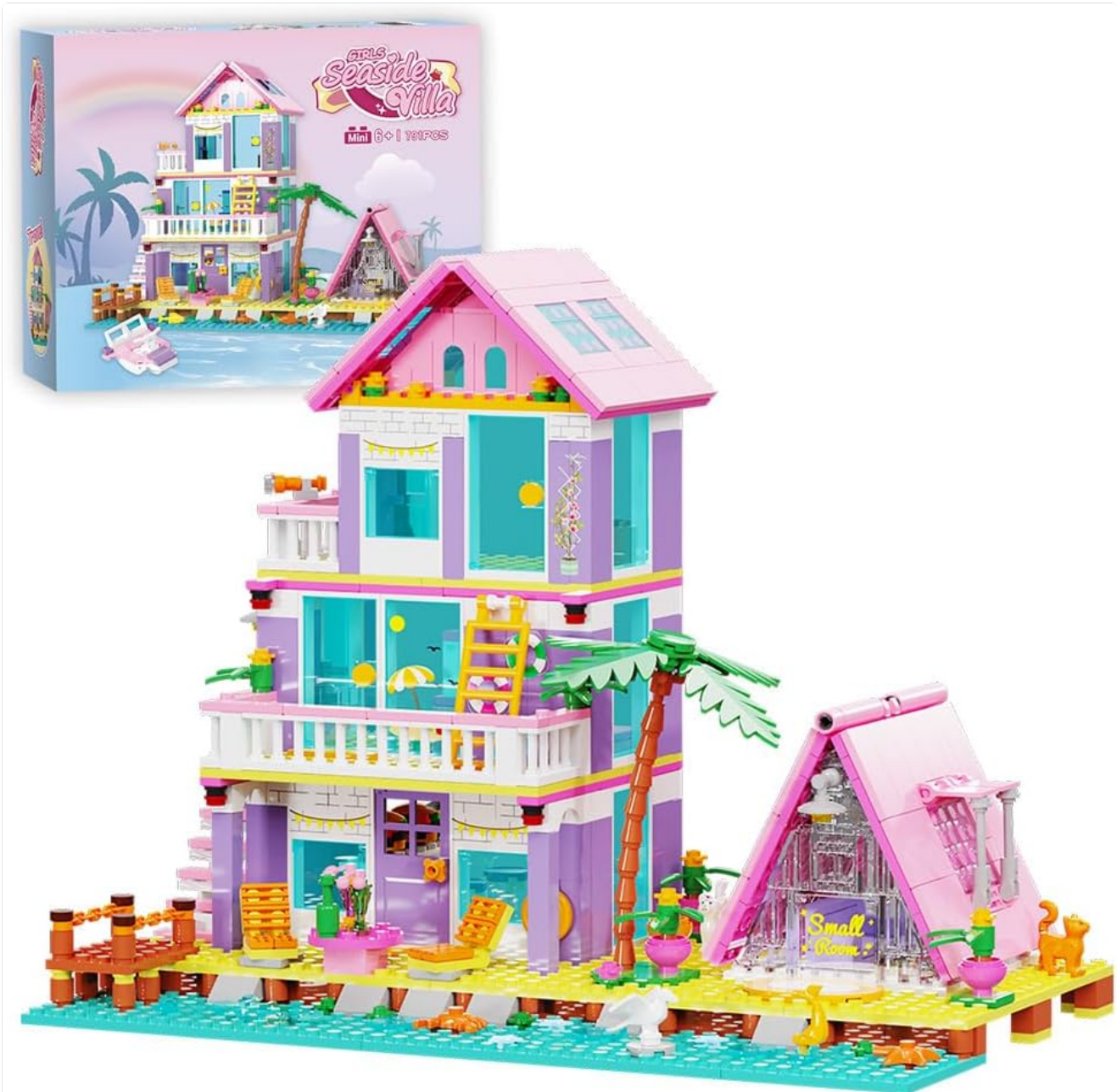
Image: The complete Seaside Villa Building Set, showcasing the multi-story house, separate A-frame structure, and a small boat, all set on a blue and yellow base representing water and sand.

This building set is designed to inspire boundless imagination, allowing children to envision a fun-filled seaside vacation. It includes intricate details such as beach chairs, an umbrella, and even a cute puppy, providing a rich and engaging building and play experience.