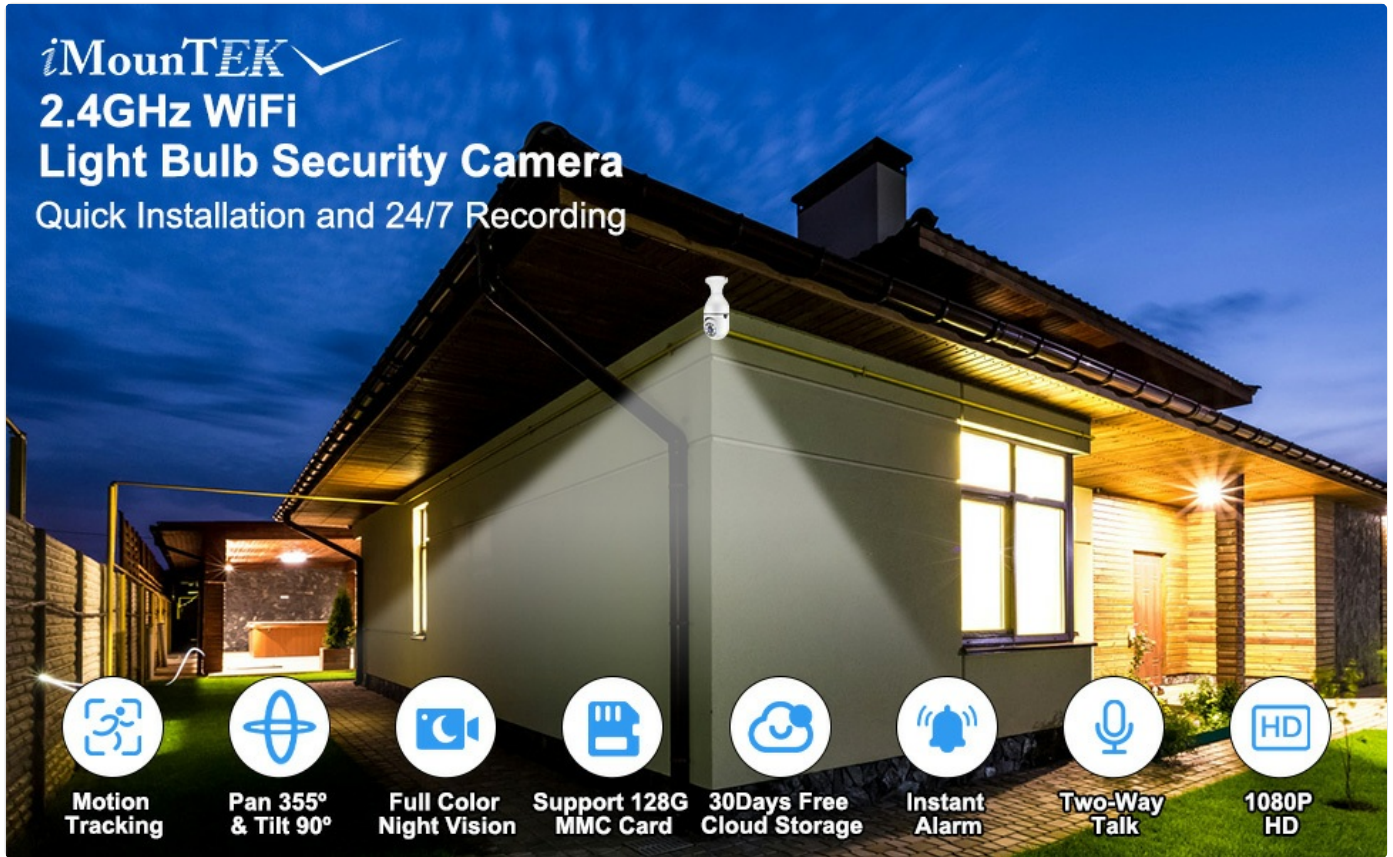
Image: Easy installation by screwing the camera into an E27 light socket. The camera supports 2.4G WiFi.