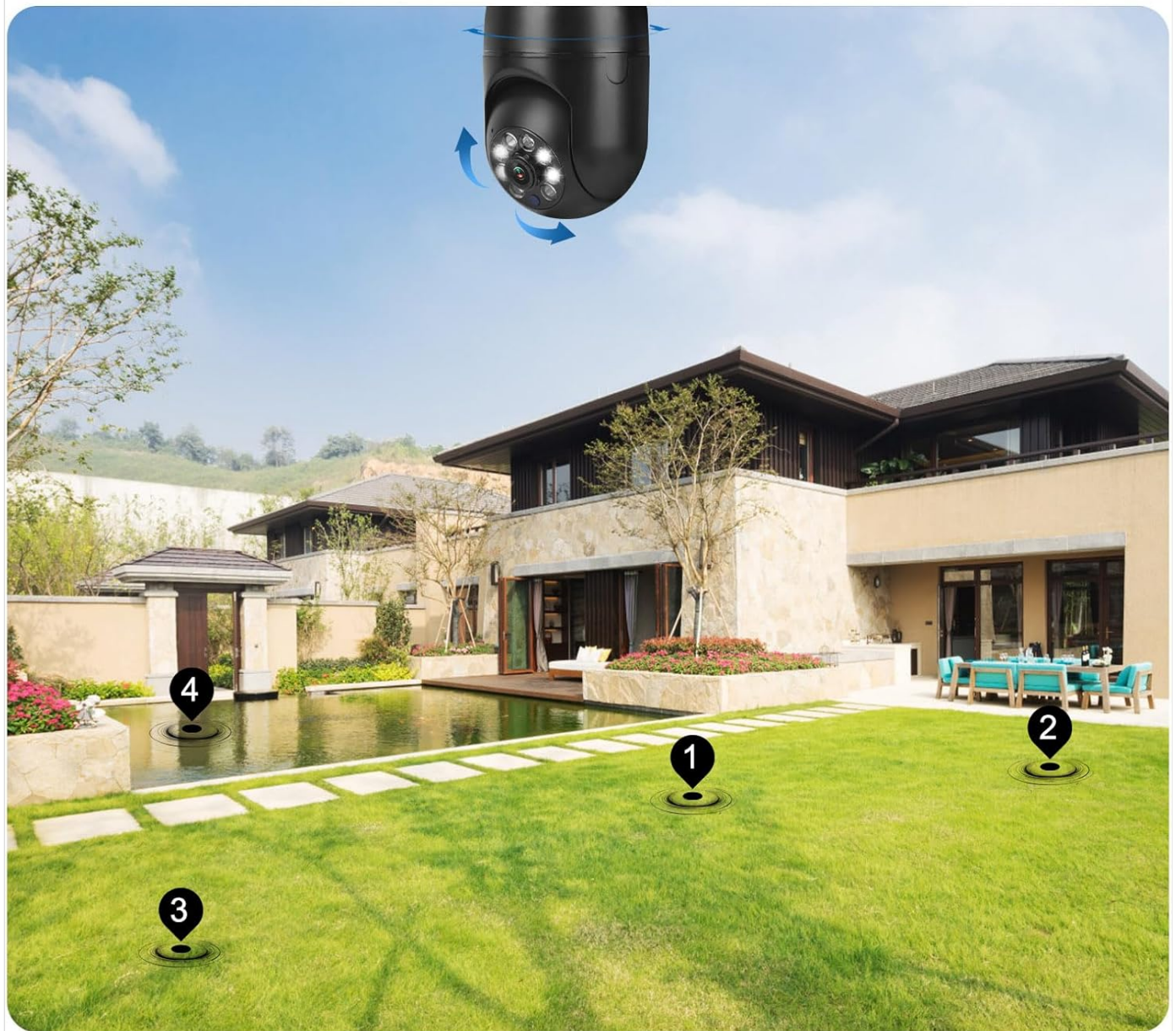
Image: Illustration of the camera's panorama or site patrol capability, capturing all angles throughout the day or on a scheduled cycle.

Capture all angles throughout the day or in a scheduled cycle.