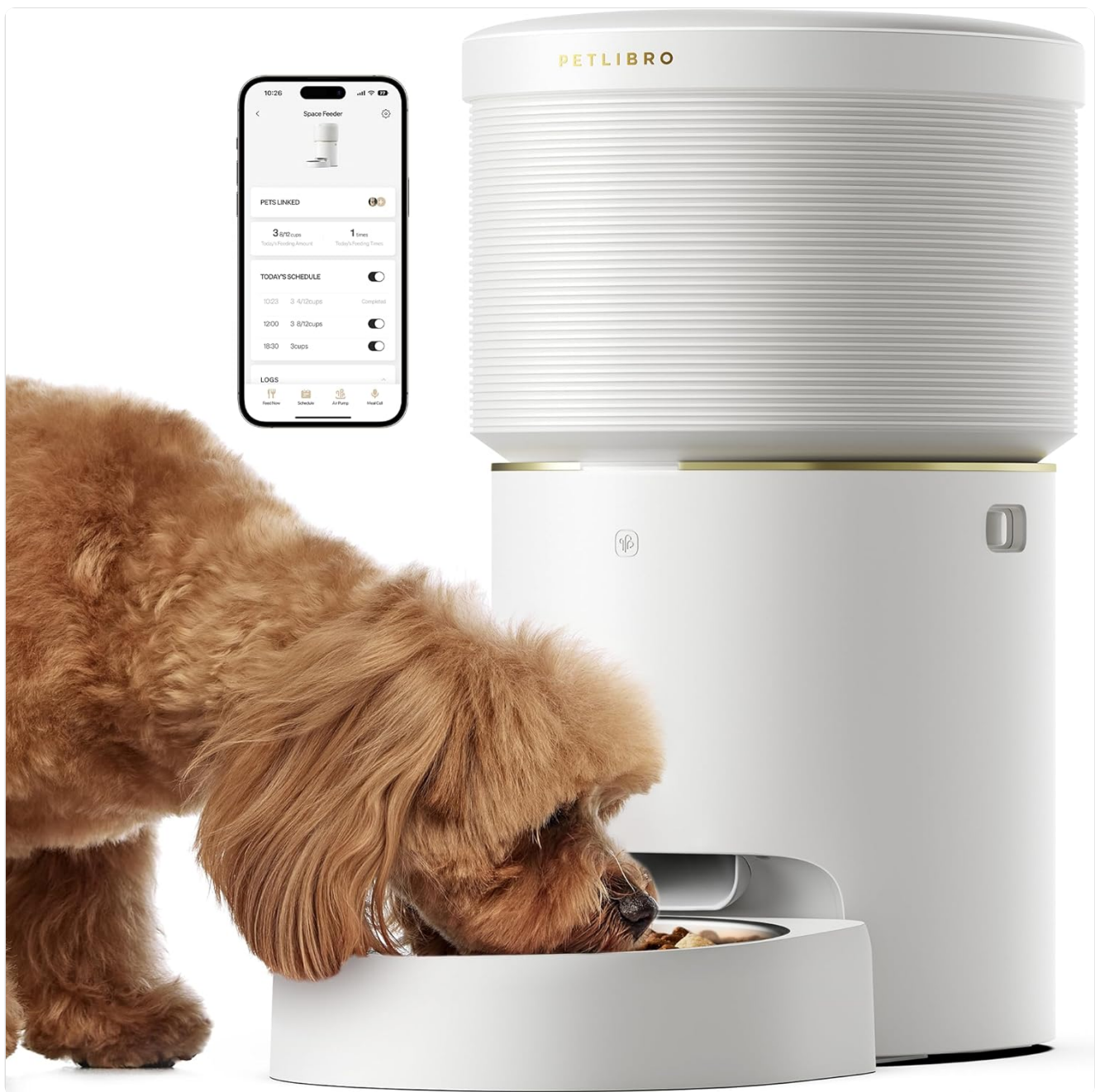
Image: The PETLIBRO Automatic Pet Feeder in white, with a dog eating from its bowl and a smartphone displaying the feeder's app interface.