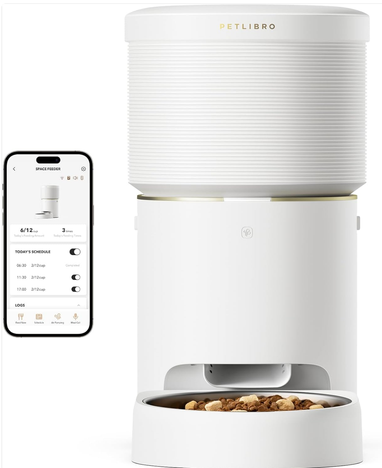
Image: The PETLIBRO app interface on a smartphone, displaying the daily feeding schedule and logs of dispensed meals.