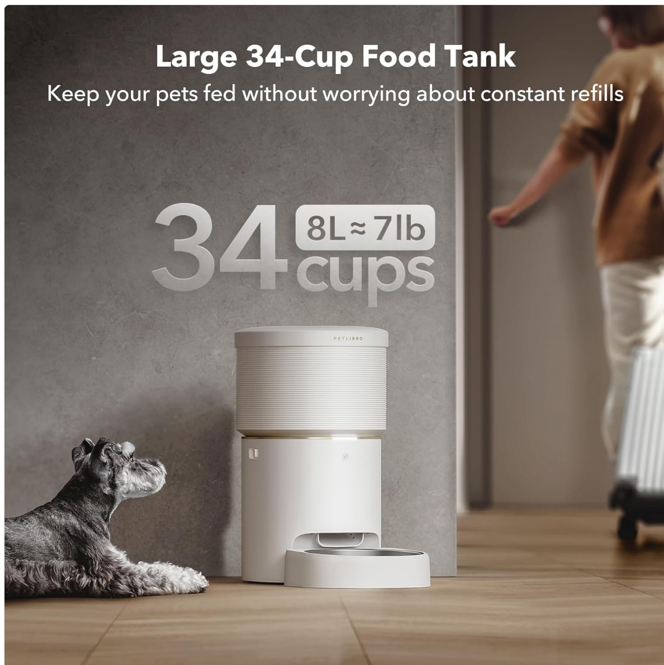
Image: The large 34-cup food tank of the PETLIBRO feeder, illustrating its capacity for extended use.

Open the lid of the food tank. Fill the tank with dry pet food only. The feeder accommodates kibble sizes between 2mm and 18mm in diameter. The large 8L (34-cup) capacity reduces the frequency of refills.