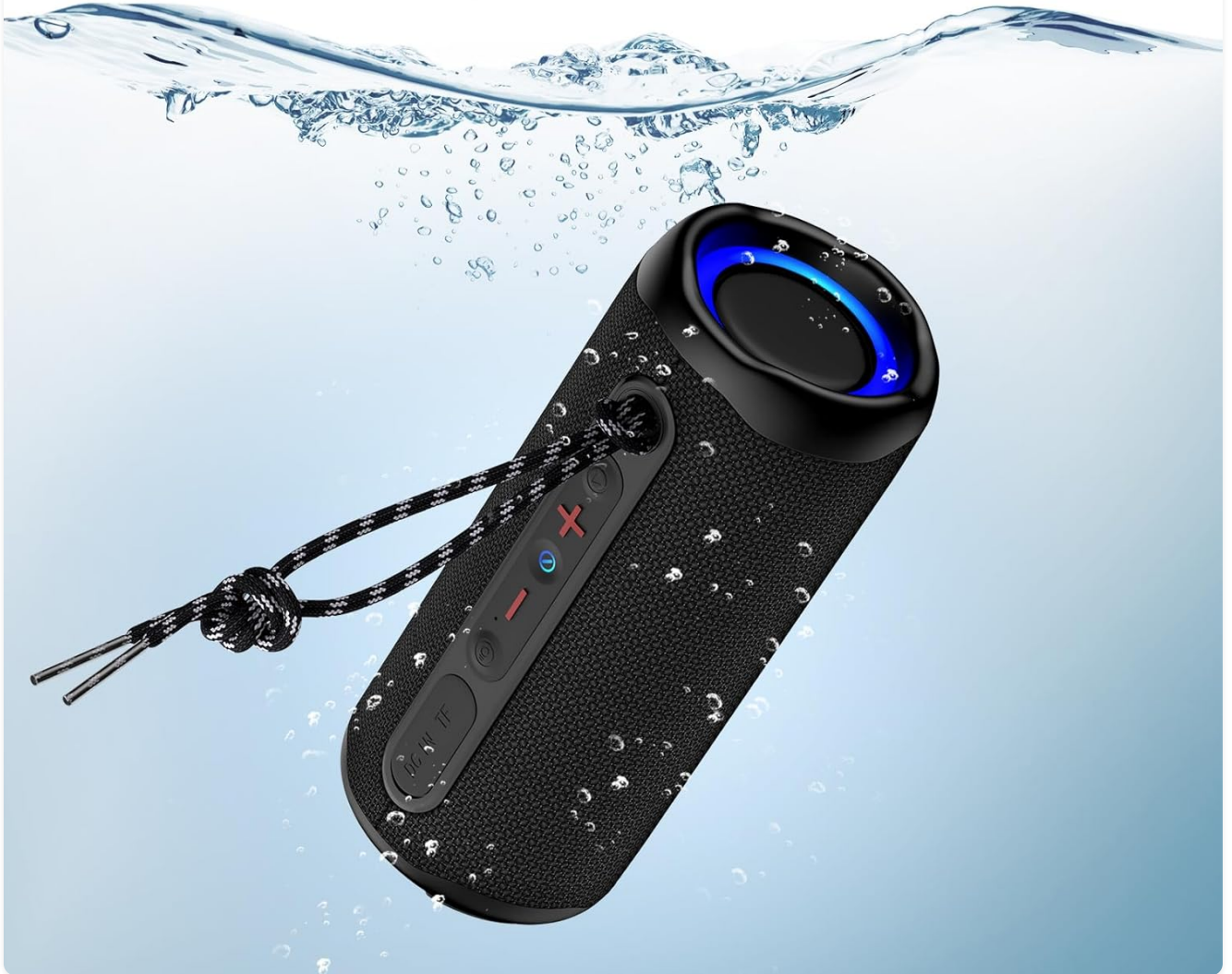
Image: The speaker submerged in water, illustrating its IPX7 waterproof design.