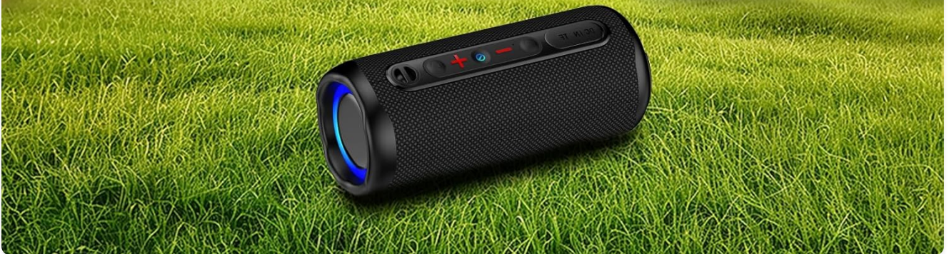
Image: The speaker in an outdoor environment, symbolizing its extended battery life for continuous enjoyment.