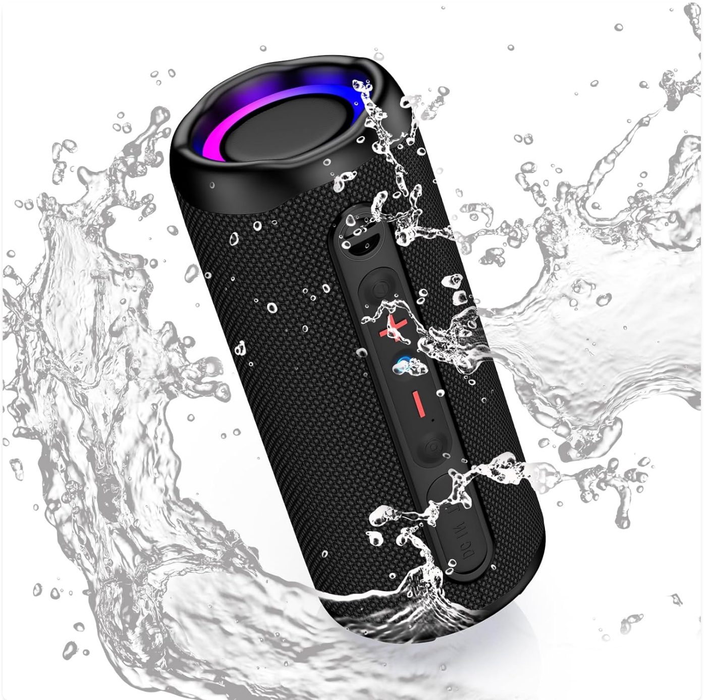
Image: The Sicodo Bluetooth Speaker, showcasing its robust design and water resistance with water splashing around it.