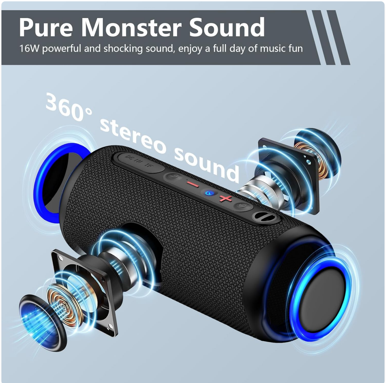
Image: An exploded view of the speaker illustrating its 360-degree stereo sound architecture.