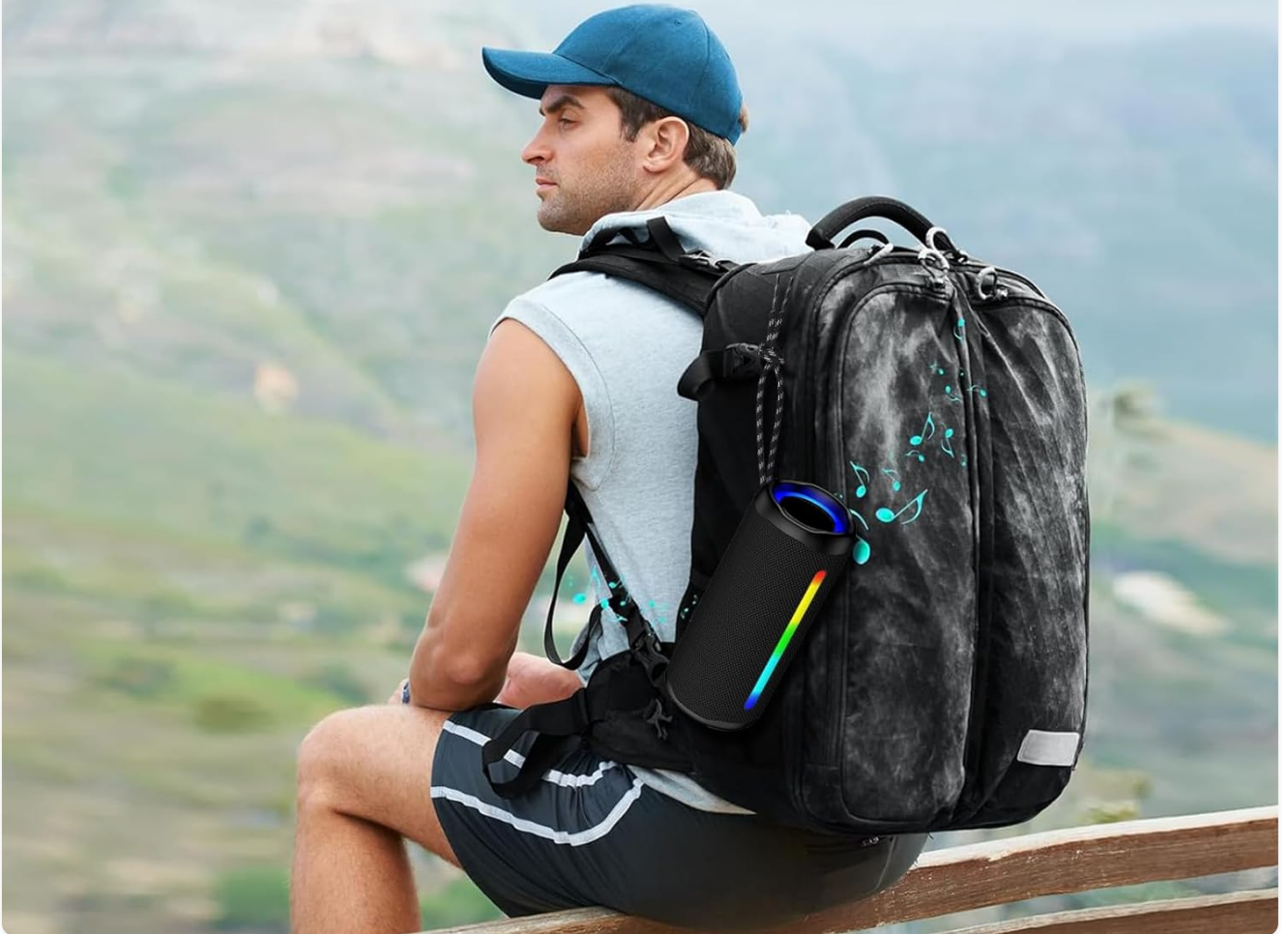
Image: The speaker attached to a backpack, highlighting its compact size and portability for outdoor adventures.

The small size and detachable lanyard make it easy to bring your tunes wherever you go.