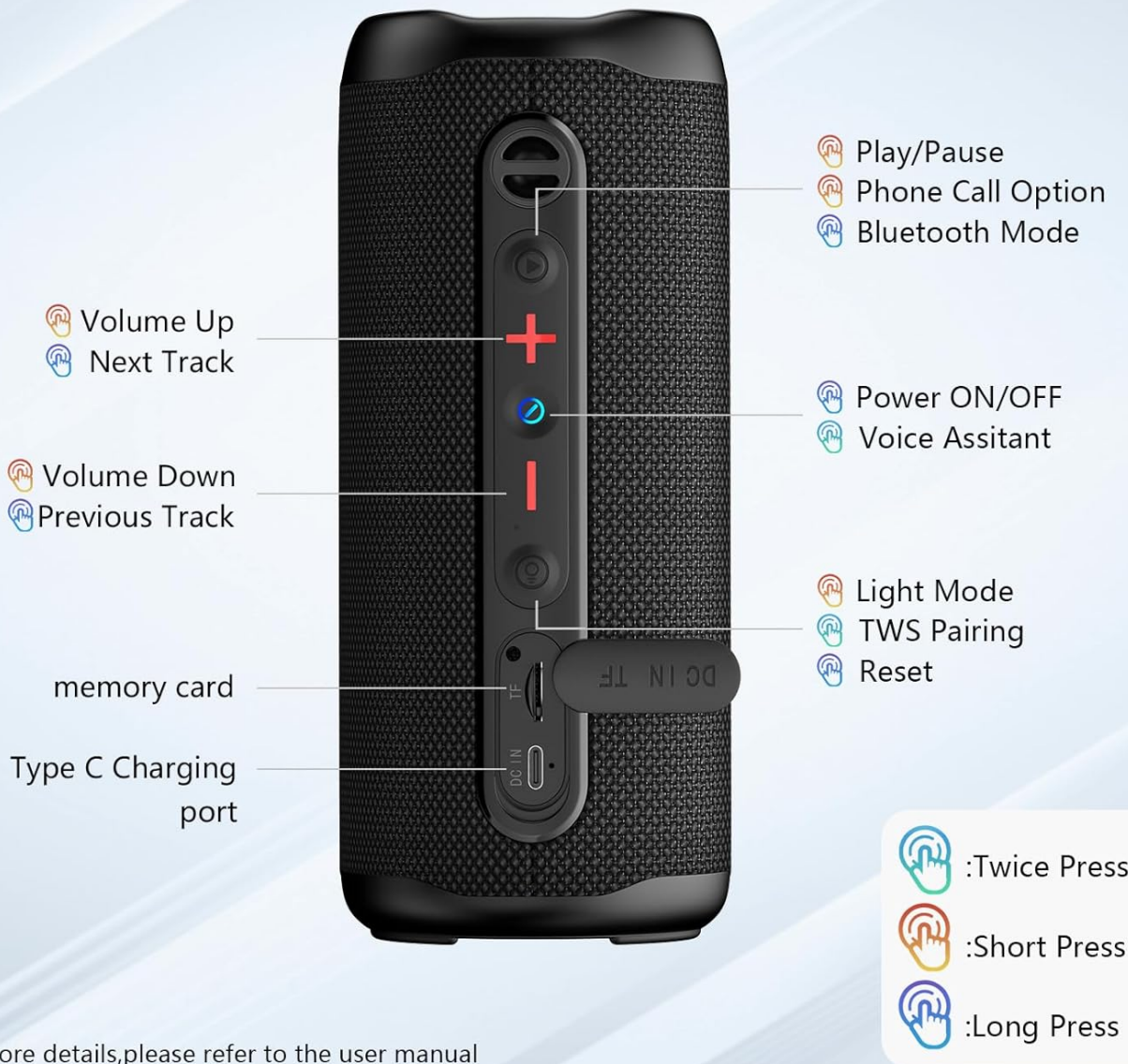
Image: A close-up view of the speaker's control panel, indicating the location and function of each button and port.