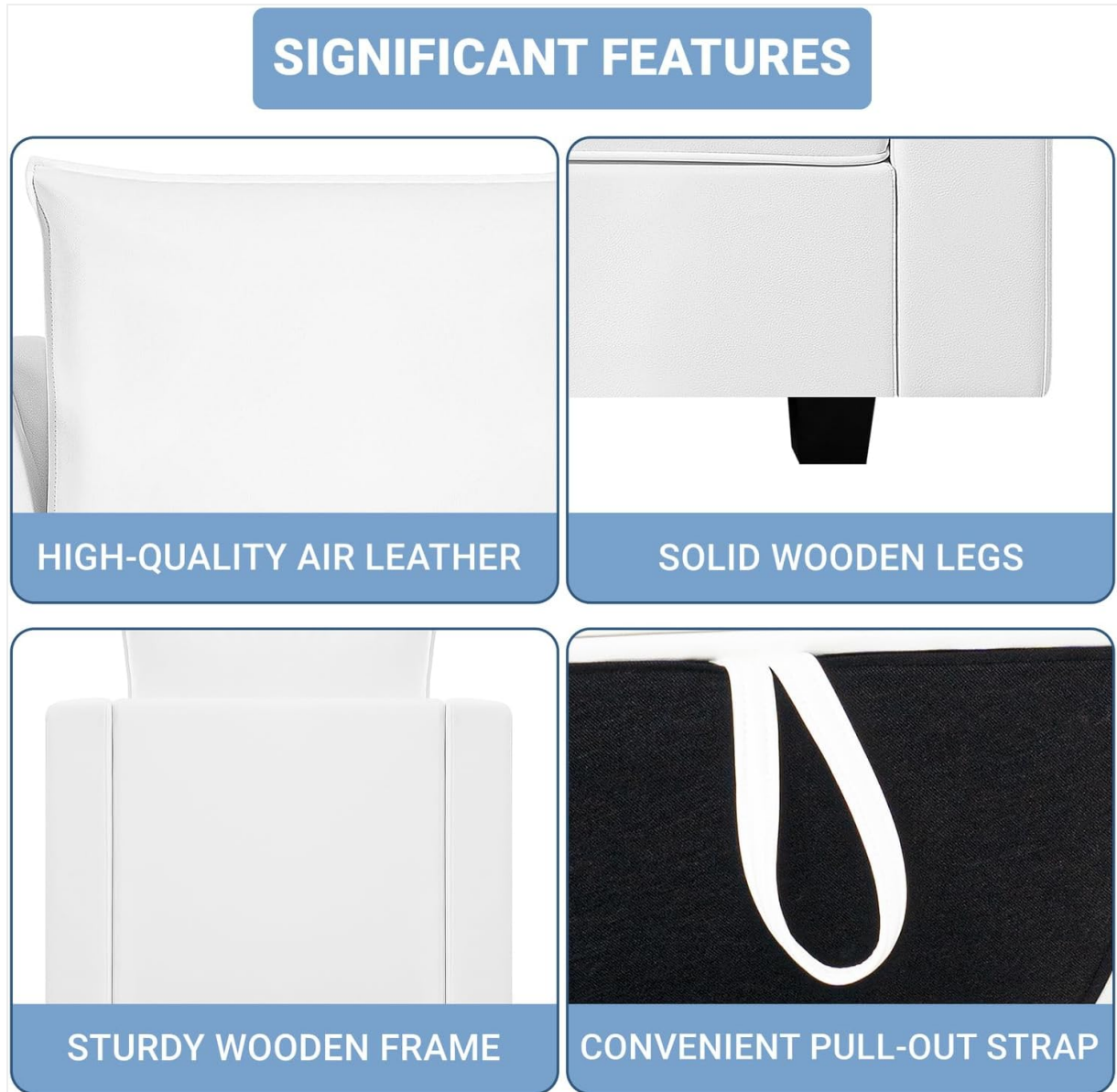
Image: High-quality Air Leather material and solid wooden legs, emphasizing durability and ease of care.