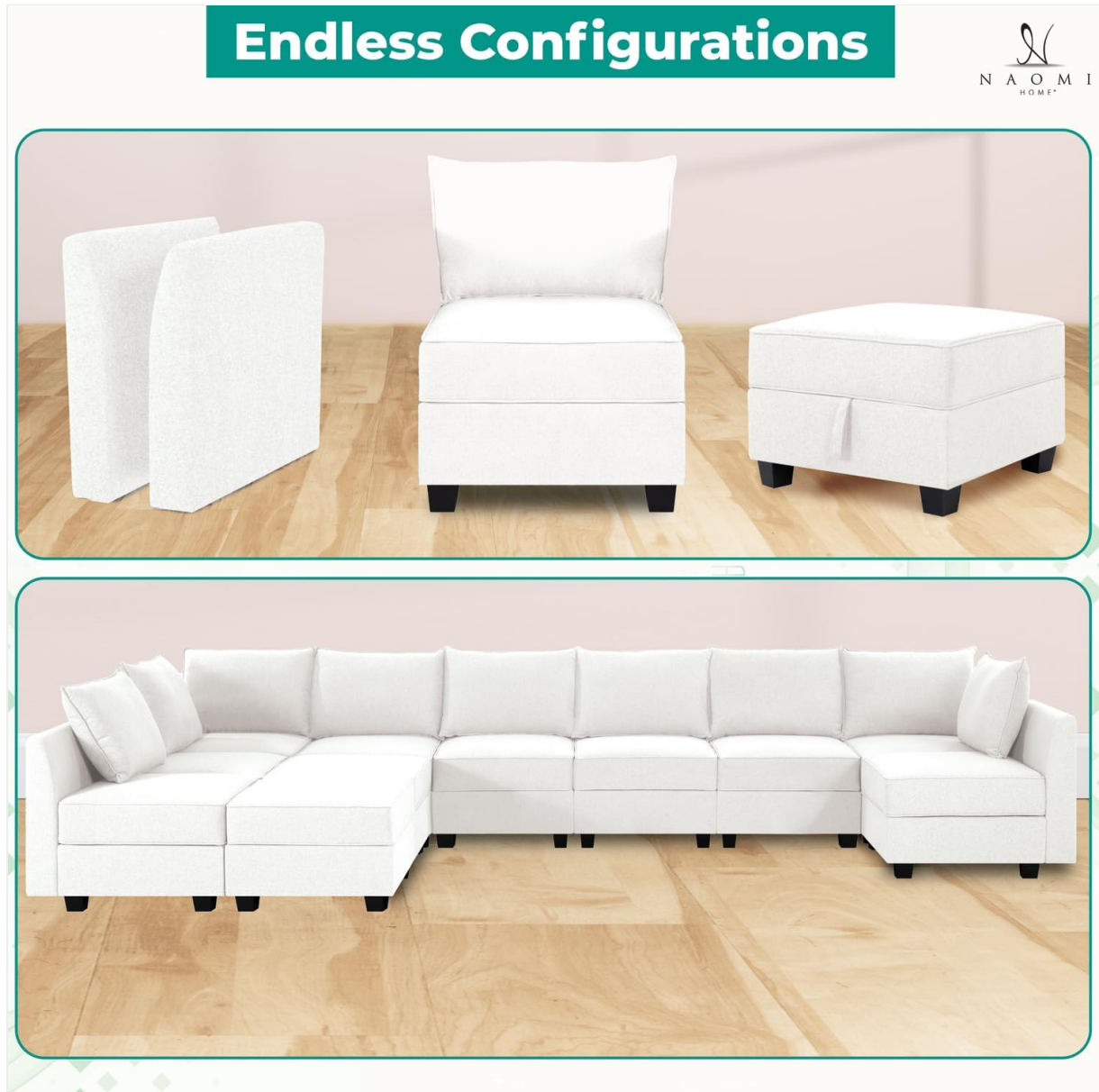
Image: Examples of endless configurations possible with the Elizabeth Modular DIY Collection.

The Elizabeth DIY Collection Armrest Module is designed for versatility. It serves as an end piece for your modular sofa, providing comfortable arm support and defining the shape of your seating arrangement. You can easily reconfigure your sofa by disconnecting and reconnecting modules as needed to adapt to different room layouts or seating requirements.