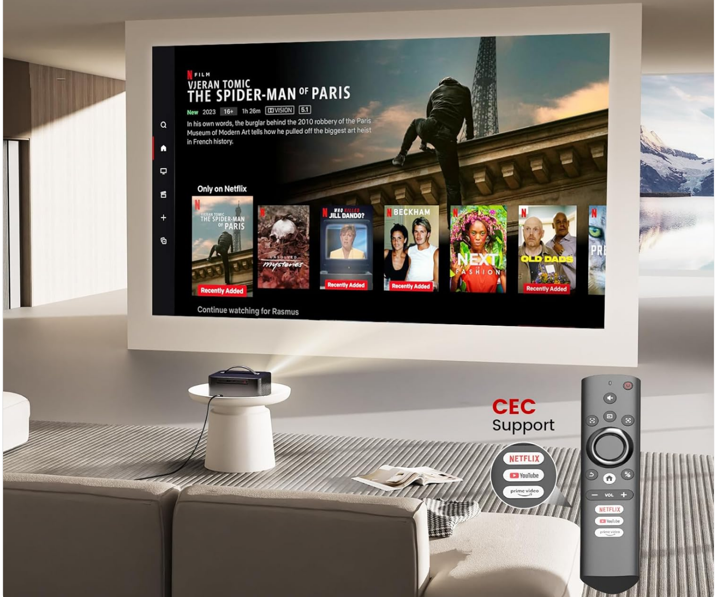
Image: The projector displaying streaming content in a living room, with the remote control highlighting dedicated buttons for Netflix, YouTube, and Prime Video, and CEC support.