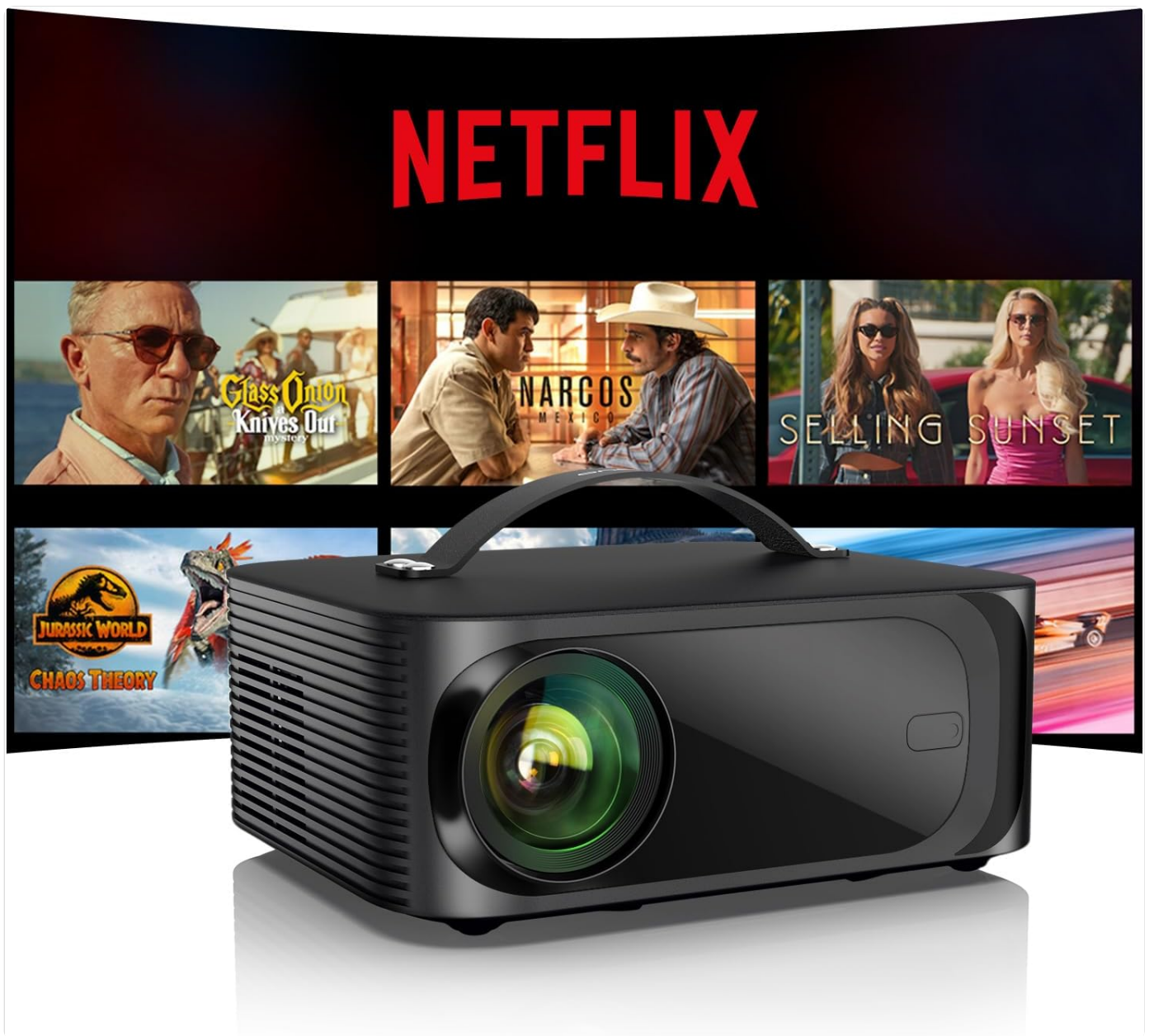
Image: The ONOAYO ONO3 Pro Projector in use, projecting a screen with various streaming content, including Netflix.