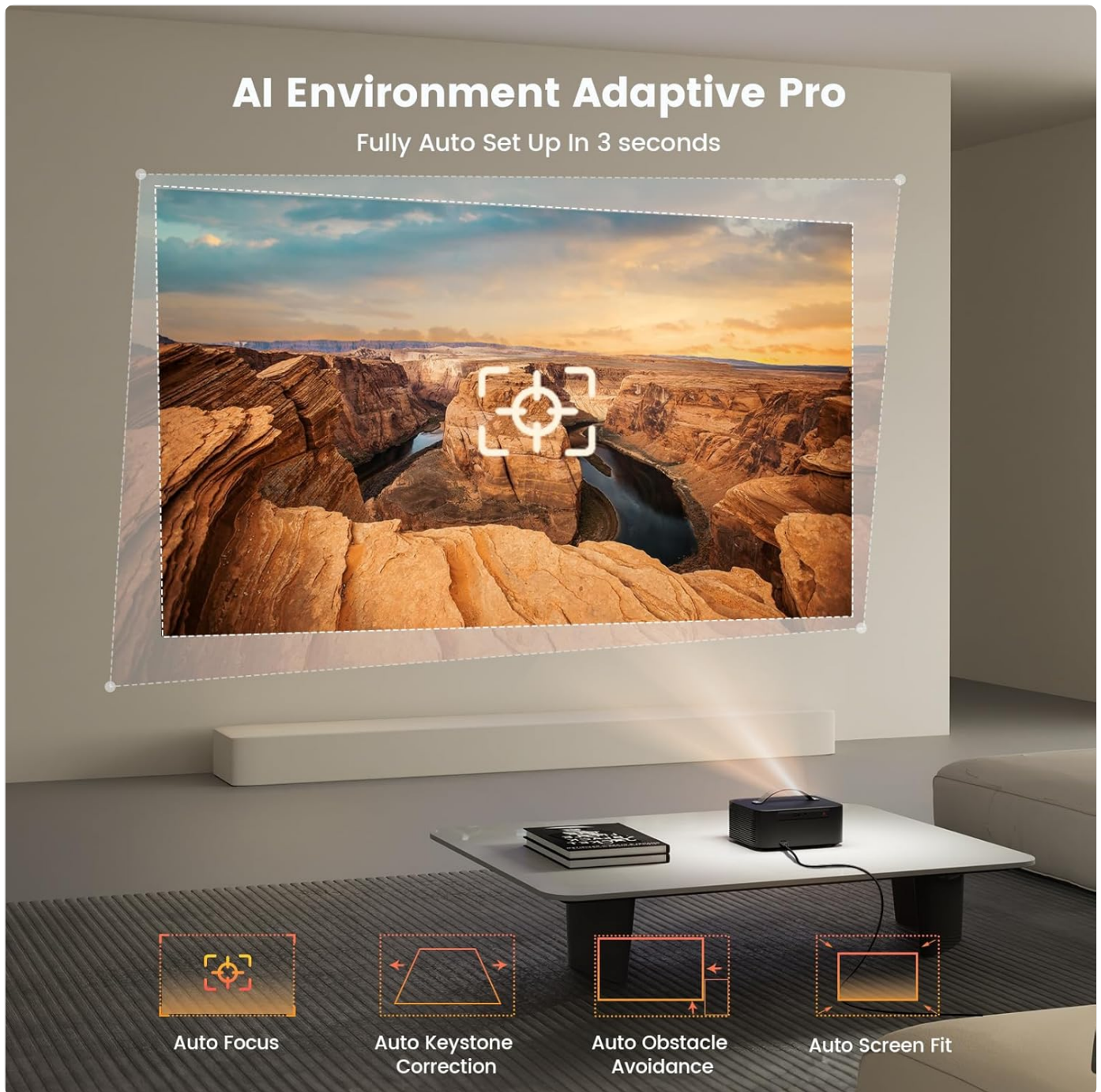
Image: Visual representation of the projector's AI Auto Environment Adaptive Pro features, including auto focus, keystone correction, obstacle avoidance, and screen fit.