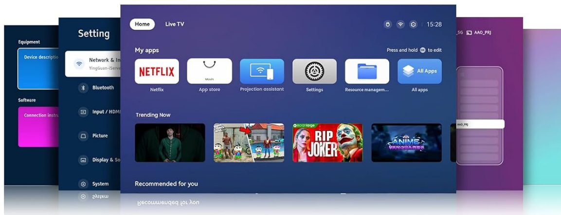
DIY Home Page