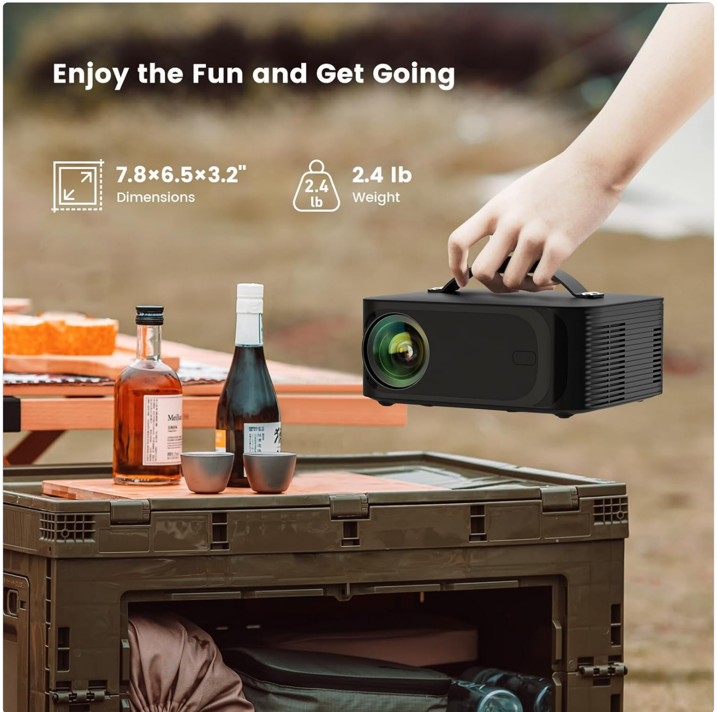
Image: The ONOAYO ONO3 Pro Projector, highlighting its portable design with dimensions of 7.8x6.5x3.2 inches and a weight of 2.4 lbs.

Place the projector on a stable, flat surface or mount it using a compatible tripod or ceiling mount (M4 screw port at the bottom). Connect the power cord to the projector and a power outlet. The projector will boot up in seconds.