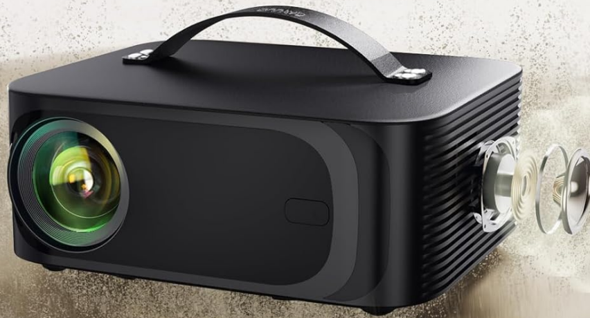
Image: The projector highlighting its Dolby Audio and AI Sound Balancing capabilities, with sound waves emanating from the device.