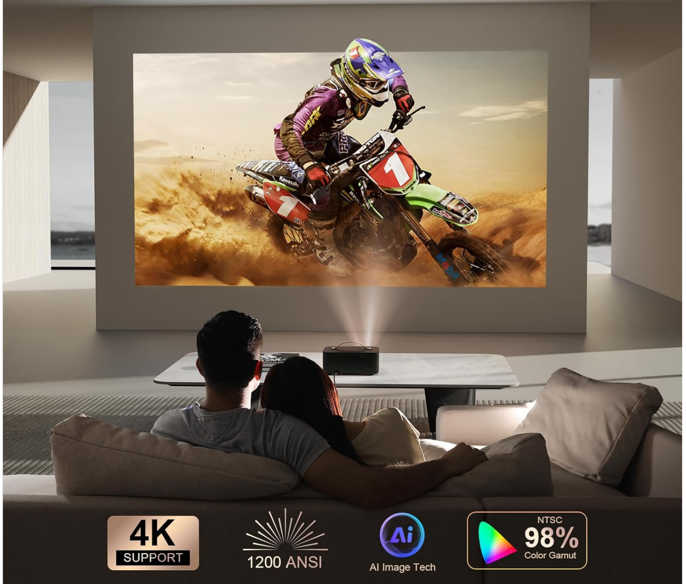
Image: A visual highlighting the projector's superior image quality, including 4K support, 1200 ANSI brightness, AI image optimization, and 98% NTSC cinematic-wide color gamut.