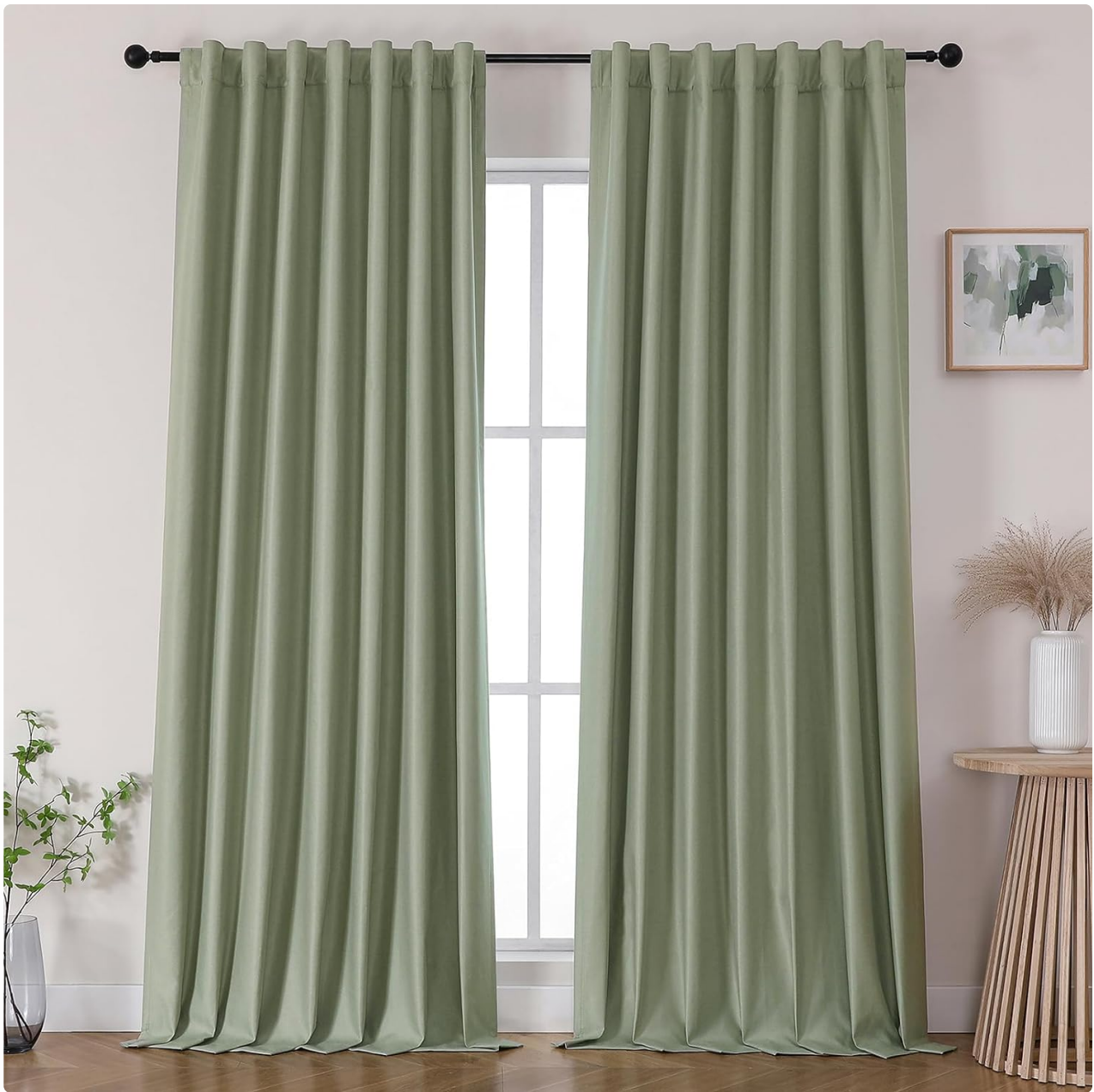
Image: A close-up view of the curtain fabric, emphasizing its soft texture and quality.