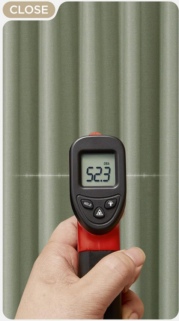
Image: A comparison illustrating noise reduction, with a decibel meter showing lower readings when the curtains are closed.