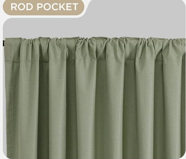
Image: A detailed graphic demonstrating the three available hanging styles: back tab, rod pocket, and using clip rings.