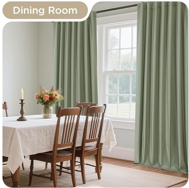
Image: Joydeco blackout curtains shown in various room settings: living room, bedroom, and dining room, highlighting their versatile application.