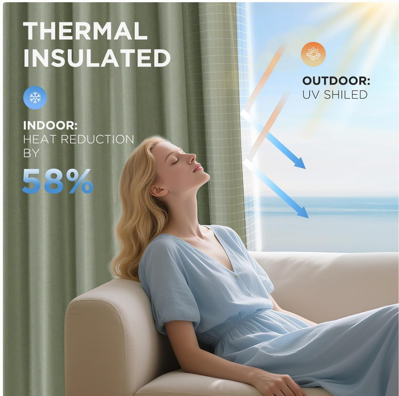
Image: Visual representation of the thermal insulation properties, showing heat reduction indoors and UV shielding outdoors.

When closed, the curtains also provide thermal insulation, helping to regulate room temperature and reduce energy consumption. The thick fabric contributes to noise reduction, creating a quieter indoor environment.