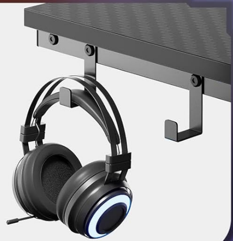
Practical Hooks ×2