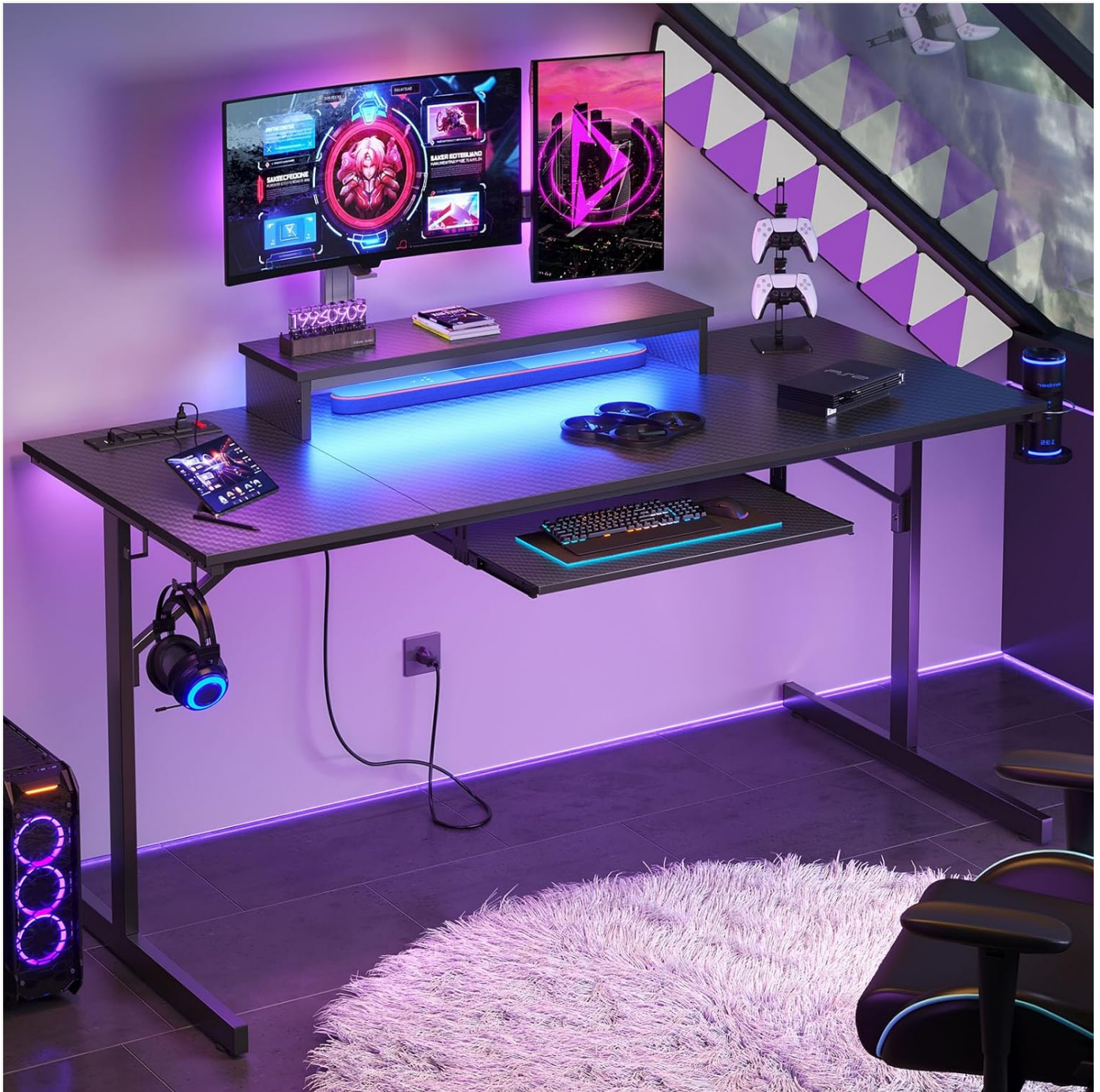
Image: The Bestier 63 Inch Gaming Desk fully assembled, showcasing the LED lighting, monitor stand, keyboard tray, and accessories.

Attach the LED light strip to the designated panel of the monitor stand using the provided clamps and screws. Ensure the wiring is neatly tucked away.