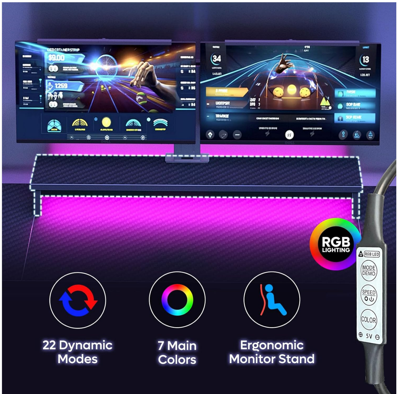
Image: The LED light controller, illustrating the options for 22 dynamic modes and 7 main colors, integrated into the ergonomic monitor stand.