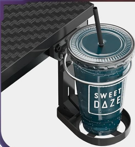
Foldable Cup Holder