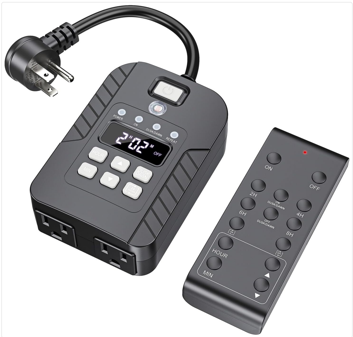
Image: The HITRENDS Outdoor Light Timer unit with its accompanying remote control. The timer unit is black, rectangular, with a digital display and control buttons. The remote control is also black with various function buttons.