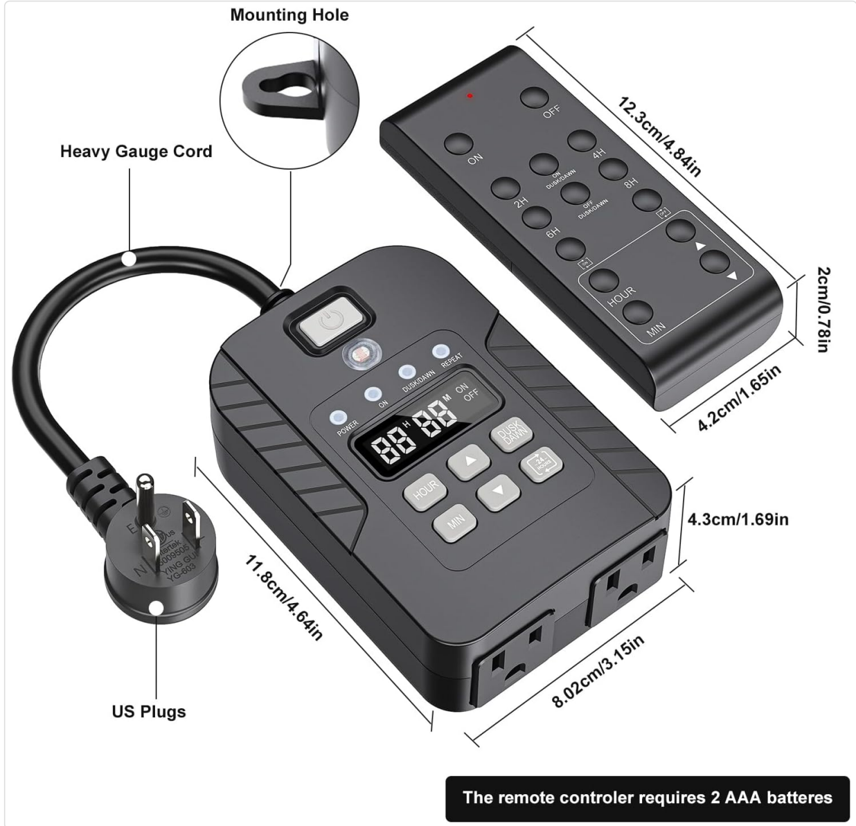
Image: A diagram showing the dimensions of the HITRENDS Outdoor Light Timer unit and its remote control. The timer unit measures approximately 8.02 inches by 4.3 inches, and the remote is 4.84 inches by 1.65 inches. It also highlights the heavy gauge cord, US plugs, and mounting hole.