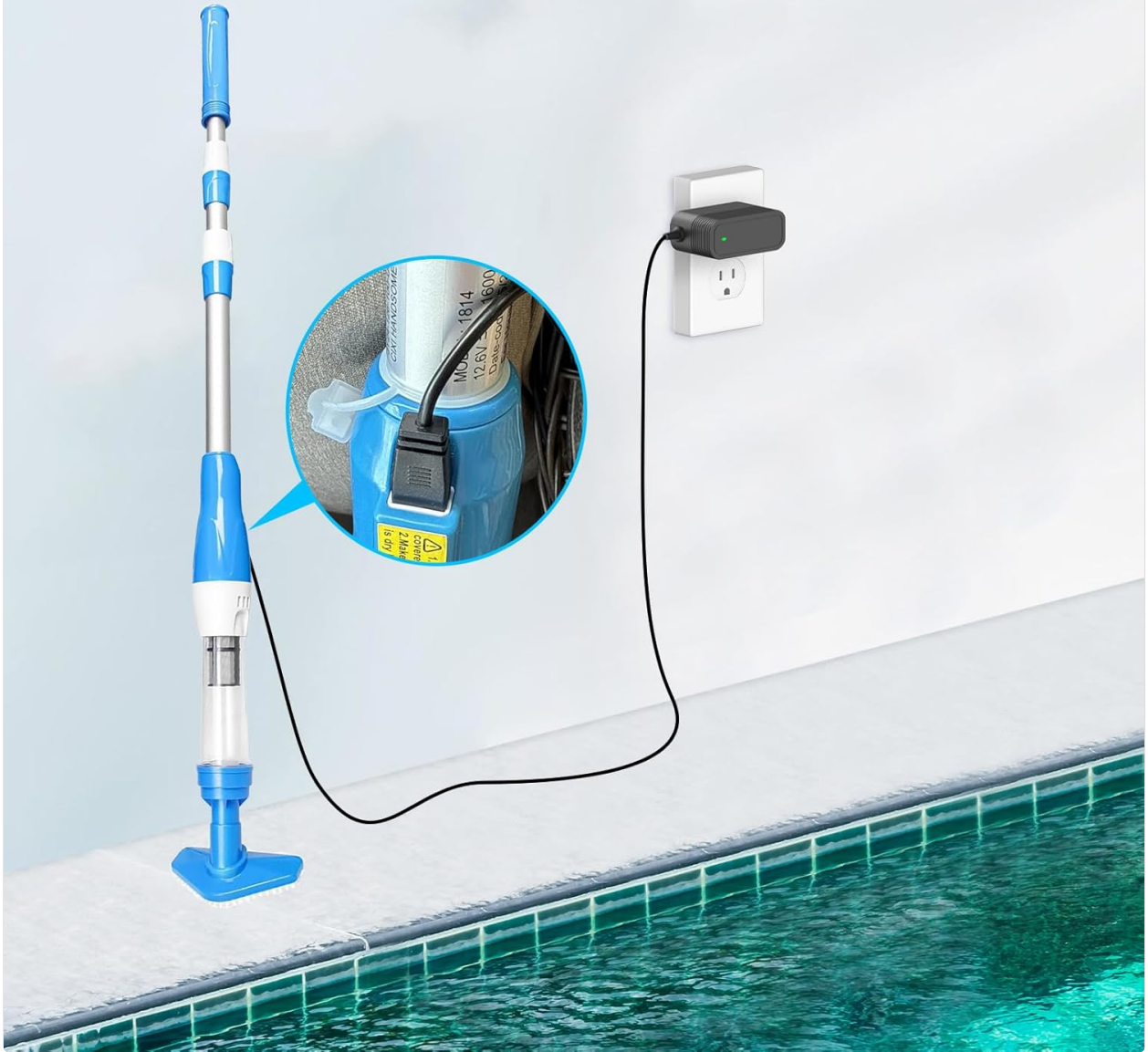
Image: The 12.6V charger connected to a YSMJ pool vacuum cleaner, demonstrating proper connection for charging.