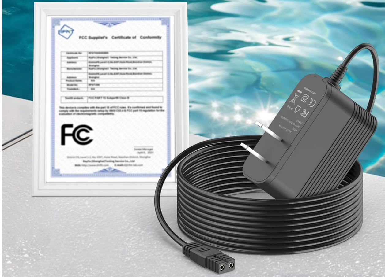
Image: The charger displayed alongside its FCC Certificate of Conformity, indicating compliance with safety and reliability standards.