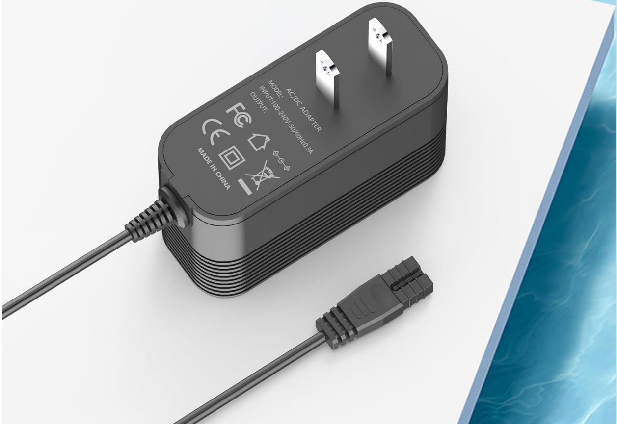
Image: A visual representation highlighting the multiple protection features of the charger, including over-temperature, overcurrent, short circuit, overcharge, overpower, and overvoltage protection.