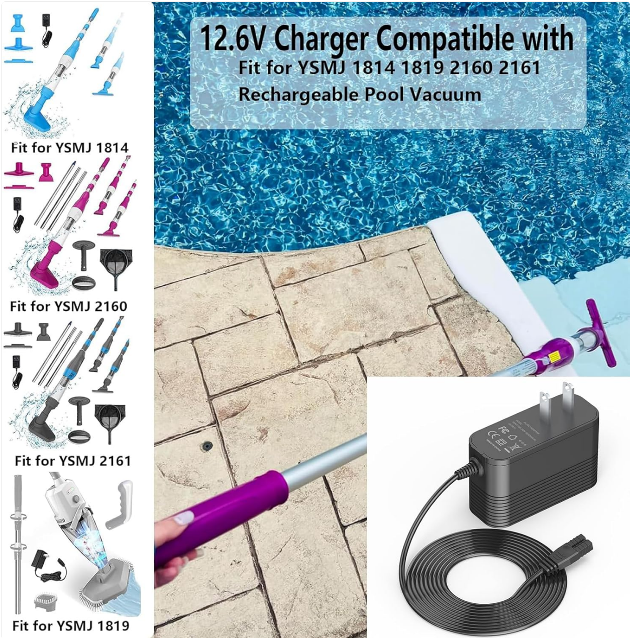
Image: Visual representation of the charger's compatibility with various YSMJ pool vacuum models, including 1814, 1819, 2160, and 2161.