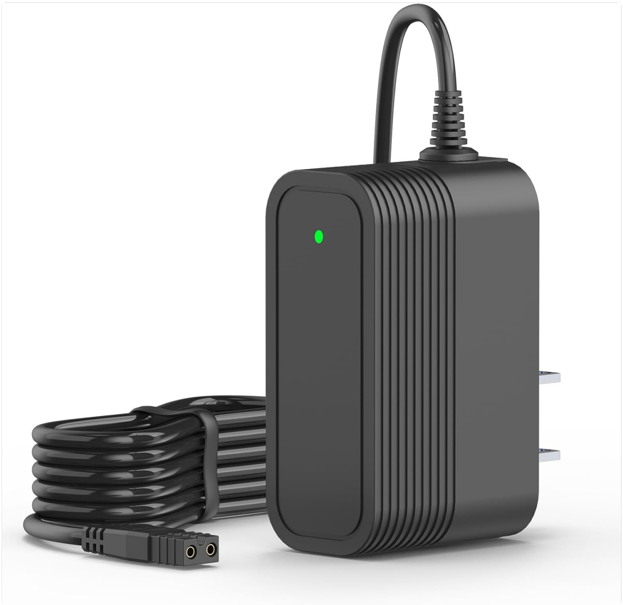
Image: The 12.6V charger unit displaying its green LED indicator, signifying active power or charging status.