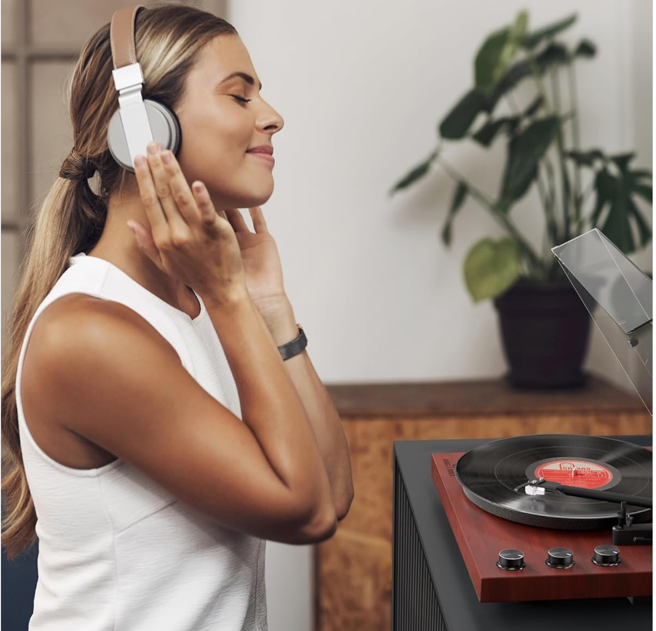
Figure 5: Enjoy your vinyl collection with the convenience of Bluetooth 5.3 wireless output to headphones or speakers.

Support lossless output with bluetooth 5.3 function