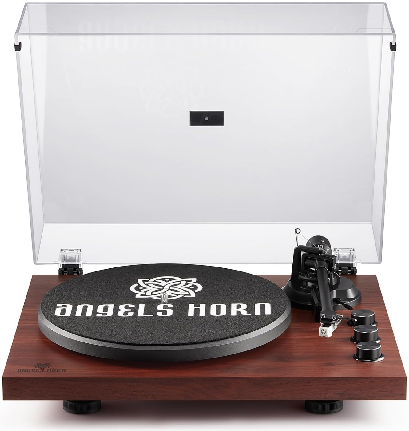
Figure 1: ANGELS HORN AT-3600L Vinyl Record Player Turntable (Brown finish)