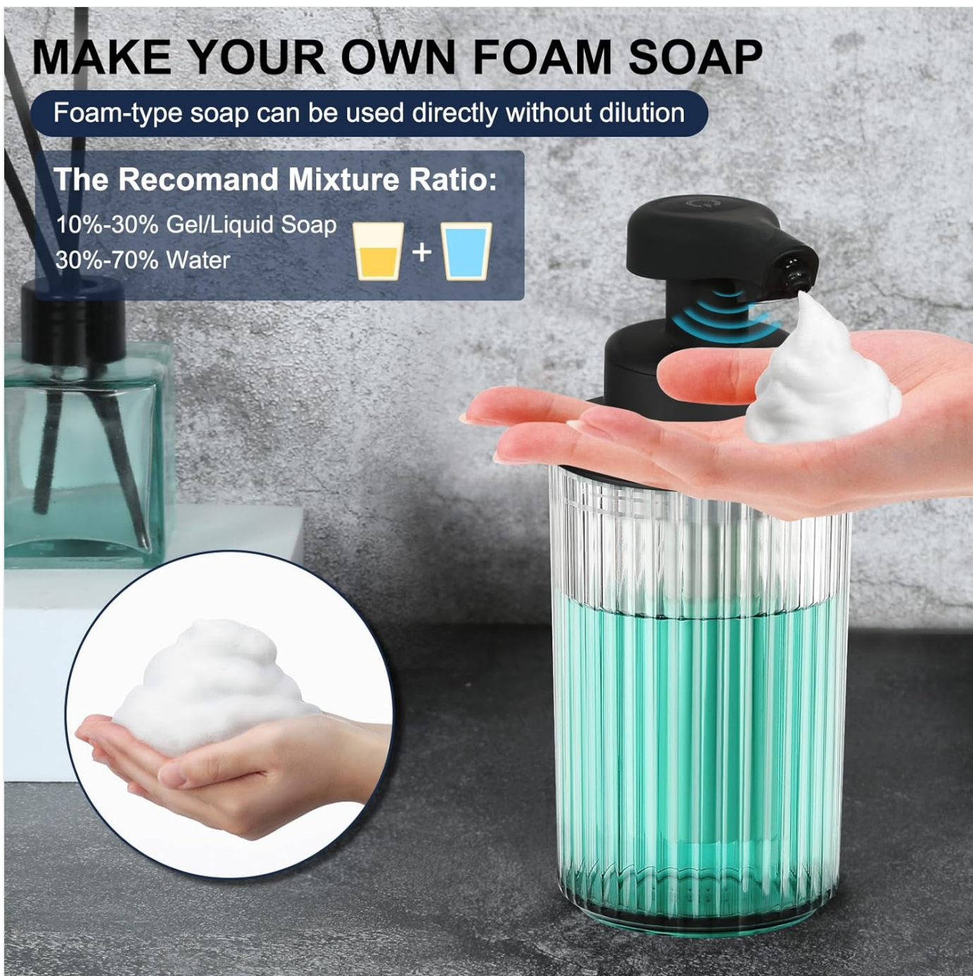
Image: A visual guide for mixing liquid gel soap with water to achieve the correct foaming consistency.