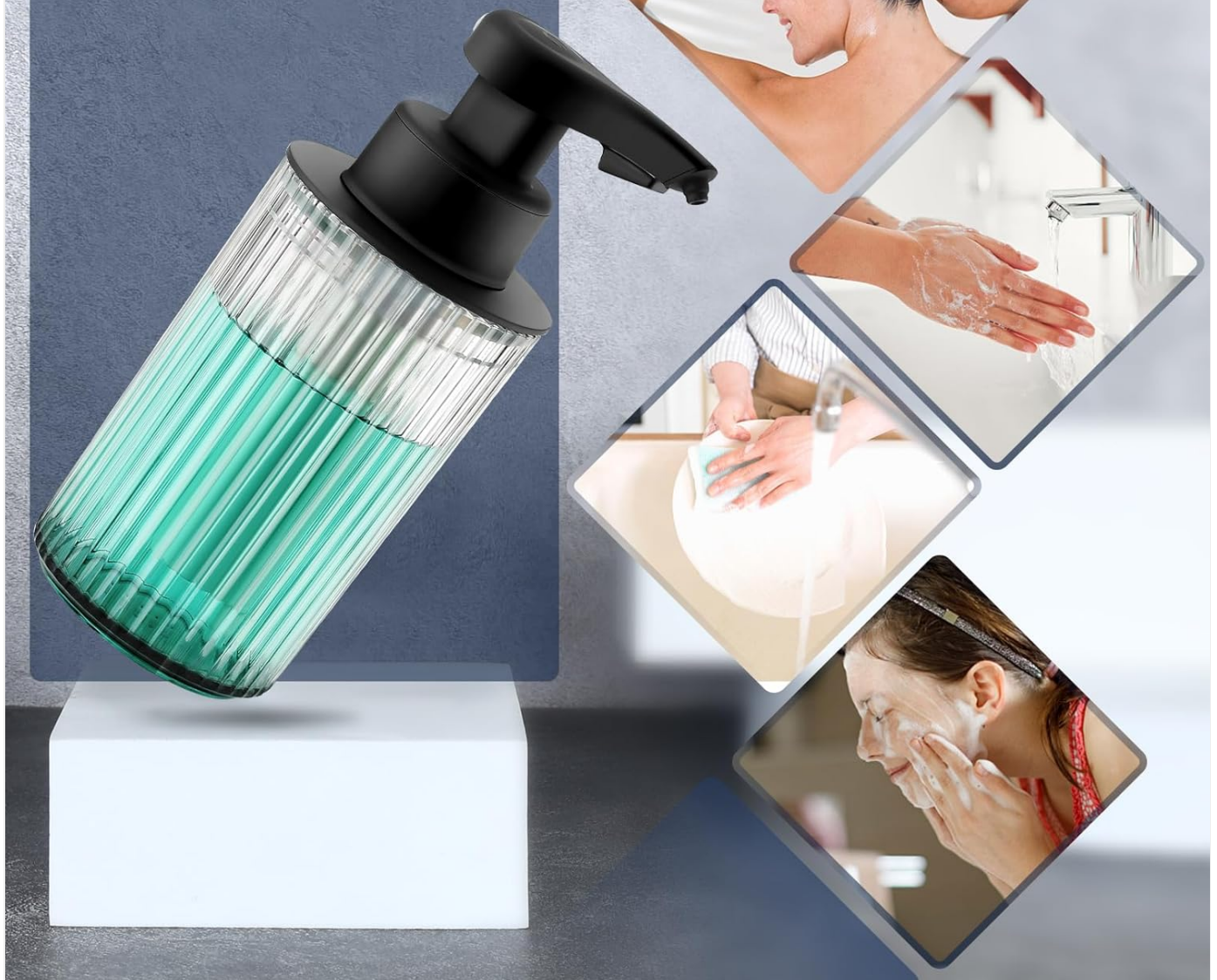
Image: The Phneems dispenser being used in different settings, including handwashing, dishwashing, and facial cleansing.