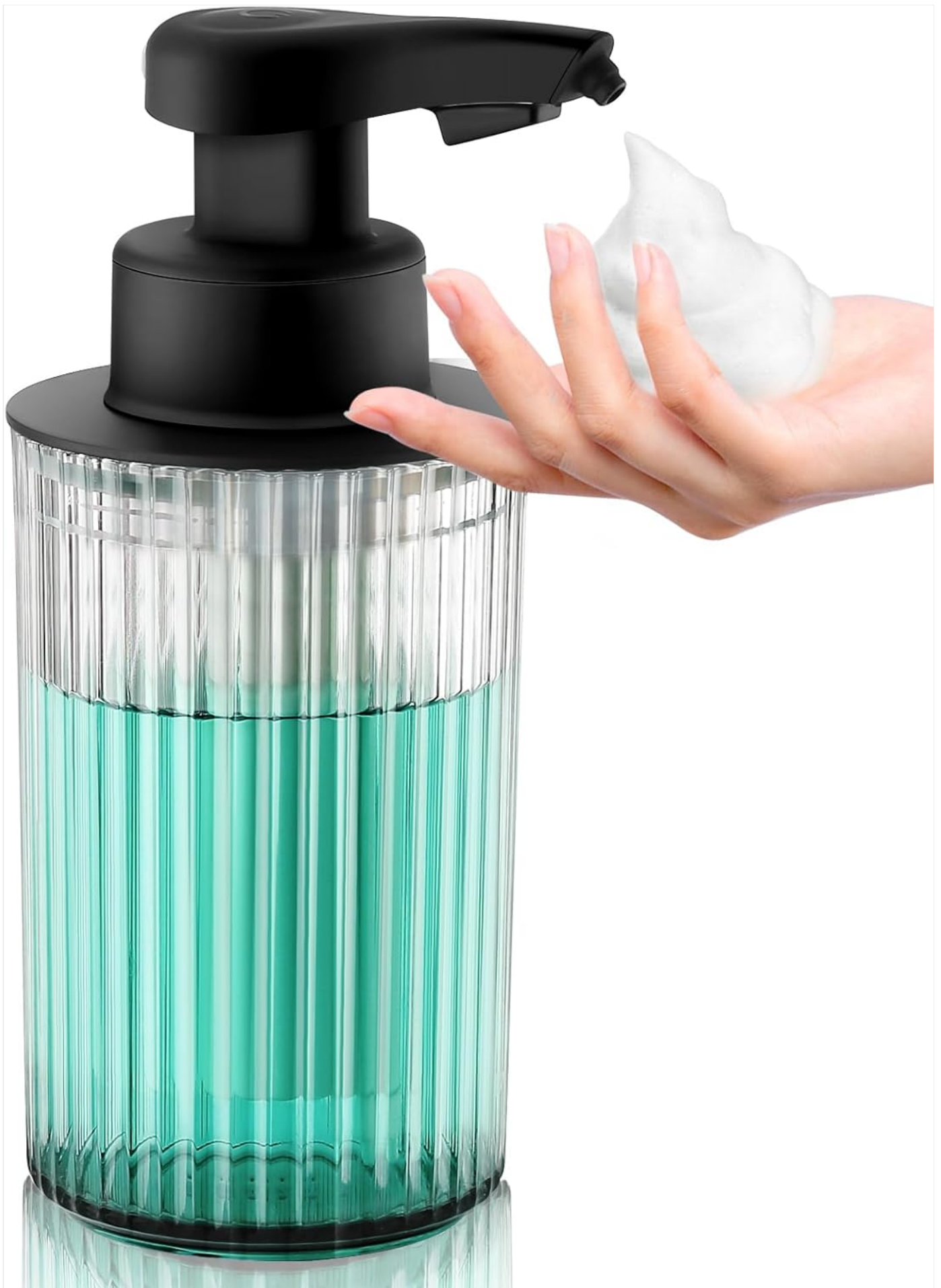
Image: The Phneems Automatic Foaming Soap Dispenser in black acrylic, dispensing rich foam into a hand.