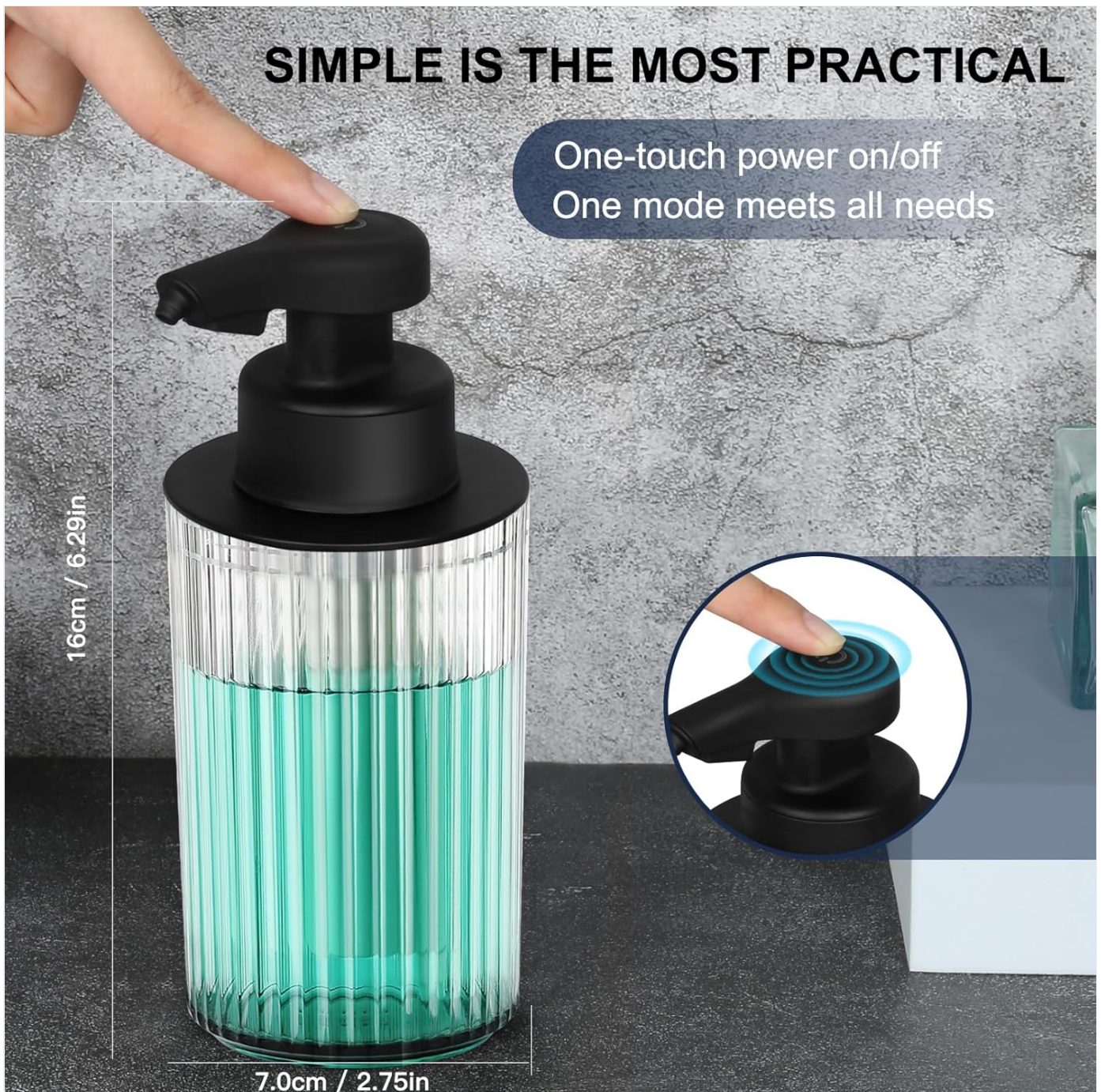
Image: The Phneems Automatic Foaming Soap Dispenser showing its dimensions (16cm/6.29in height, 7.0cm/2.75in diameter) and the location of the one-touch power button.

One-touch power on/off One mode meets all needs