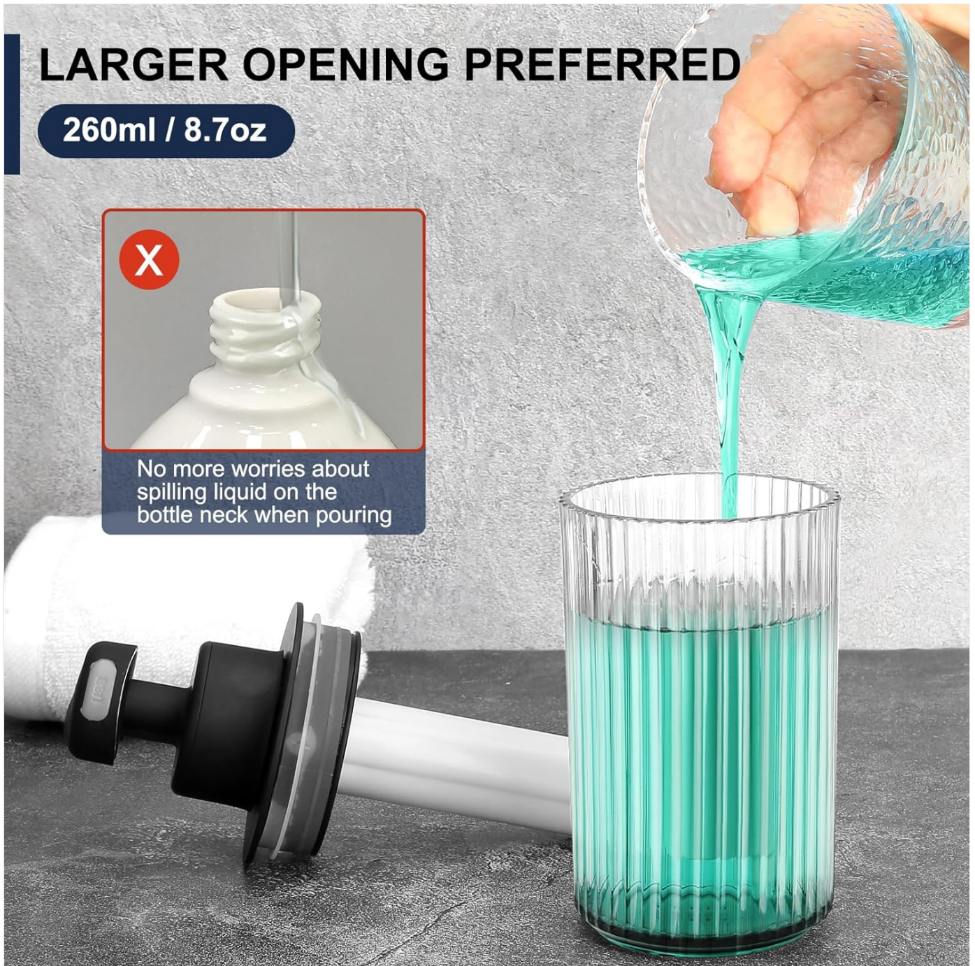
Image: The Phneems dispenser with its top removed, showing the wide opening for easy filling of soap.