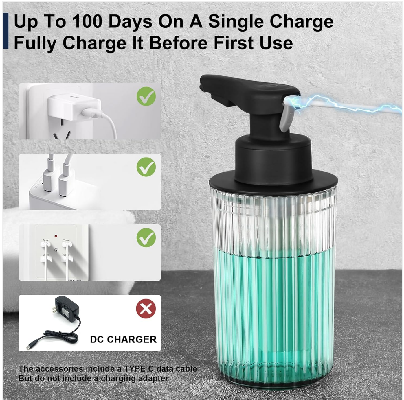
Image: Acceptable USB-C charging methods (wall adapter, multi-port charger, wall outlet with USB-C) and an unacceptable DC charger.