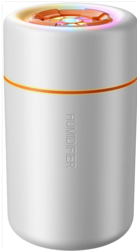
Step 1: Filling the humidifier water tank.