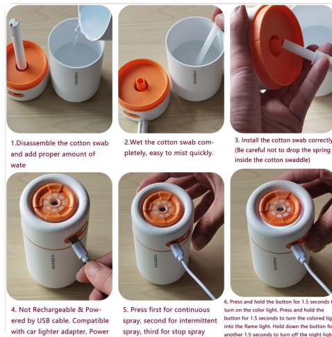
Step 2: Soaking the cotton swab.