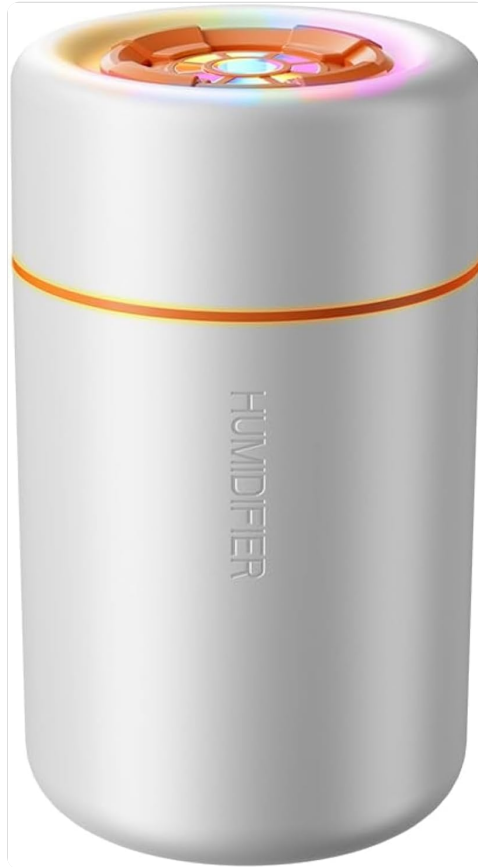
Front view of the KISSWILL Mini Humidifier, highlighting its sleek white design and the mist outlet at the top.

The KISSWILL Mini Humidifier features a compact design with intuitive controls.