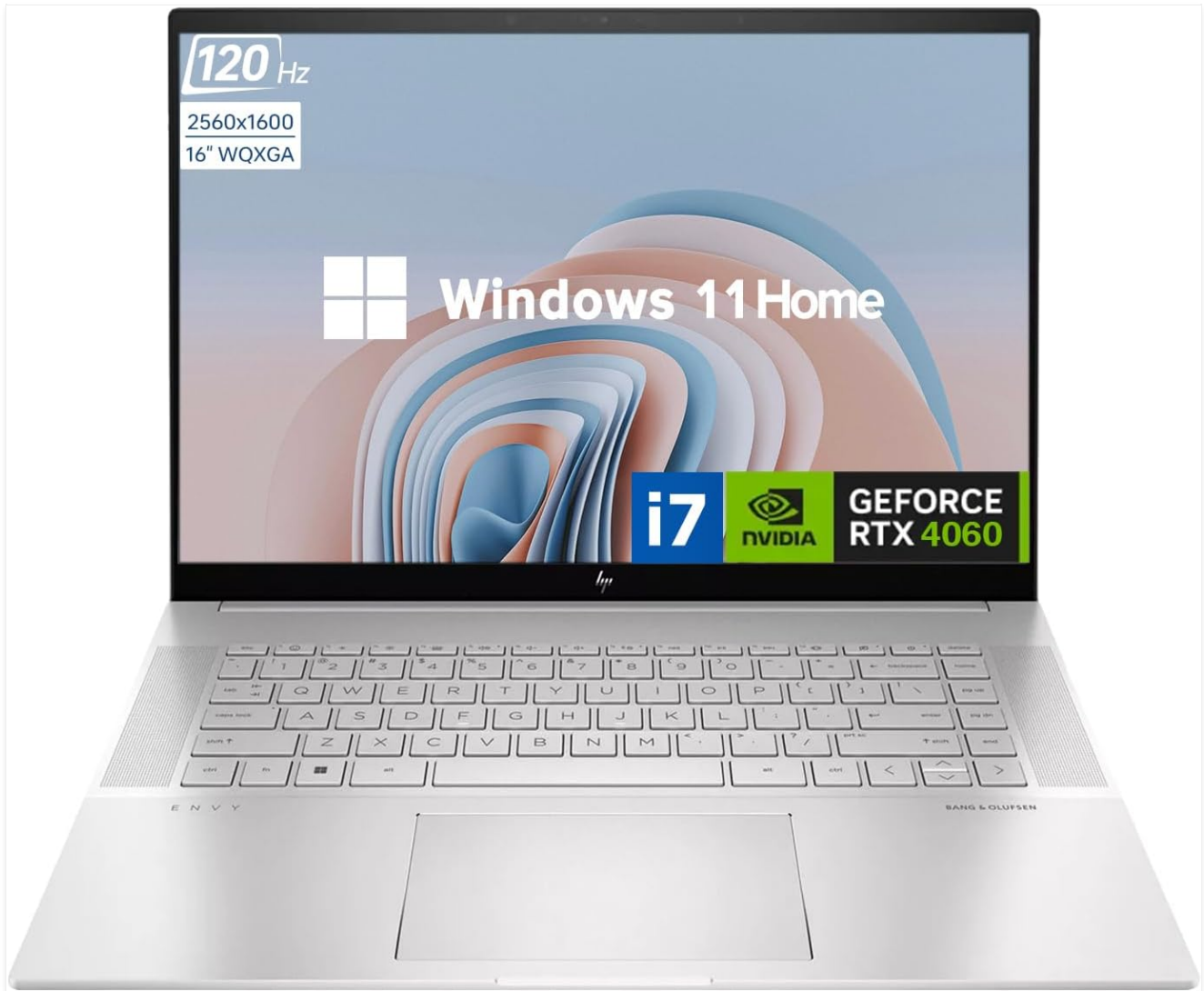
Figure 1: Front view of the HP Envy 16 Laptop, showcasing its display and key features.