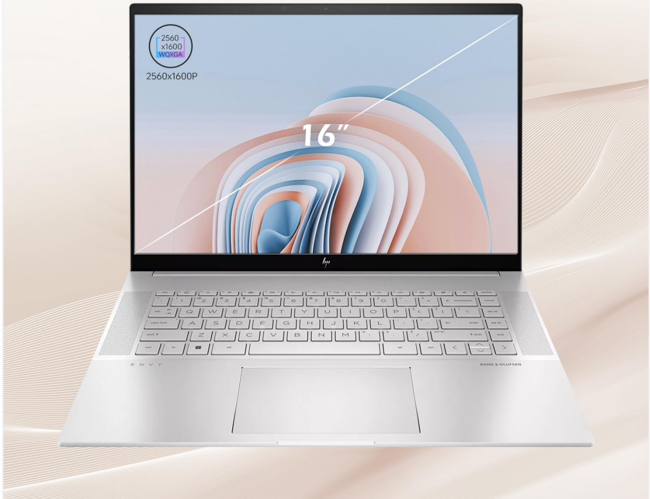
Figure 2: The 16-inch WQXGA display offers high resolution and a 120Hz refresh rate.