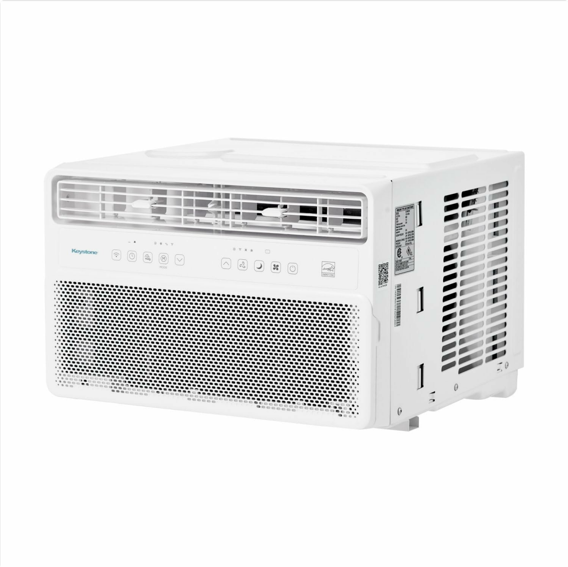
Figure 1: Keystone 24,000 BTU Window Mounted Inverter Air Conditioner, front view.

optimizes motor speed for precise temperature control and is 23% more energy-efficient than standard window units. Enjoy quiet operation and convenient features like a remote control, Energy Saver mode, Sleep mode, and a 24-hour programmable timer.