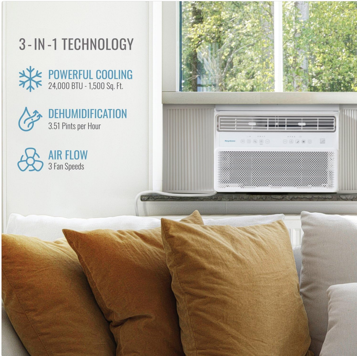
Figure 2: The unit offers 3-in-1 technology for powerful cooling, dehumidification, and adjustable air flow.