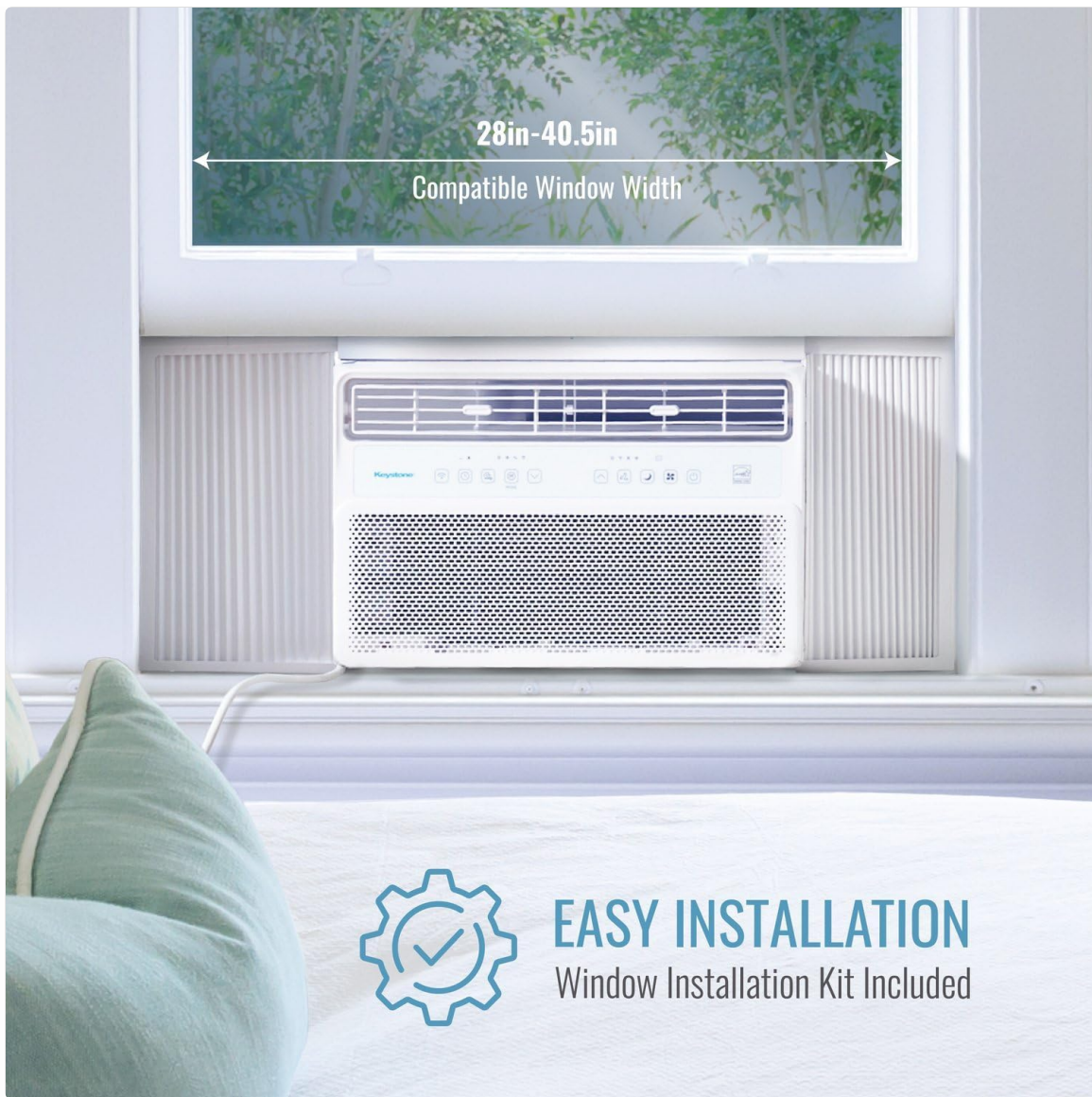
Figure 4: The unit comes with an easy installation window kit for compatible window widths.