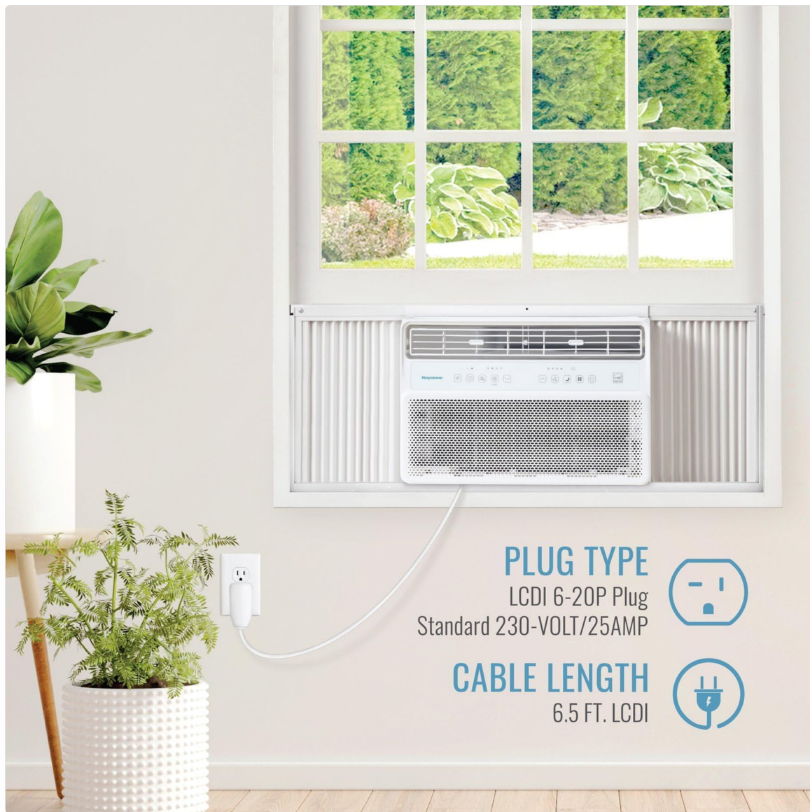
Figure 5: The unit requires a 230V/25AMP outlet with an LCDI 6-20P plug.