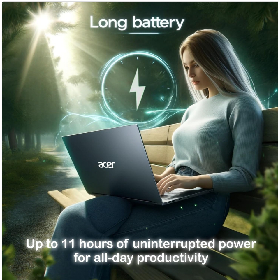
Image: A user working on the Acer Aspire laptop outdoors, illustrating its long battery life with a battery icon overlay. The laptop offers up to 11 hours of battery life, providing extended usage without frequent recharging.