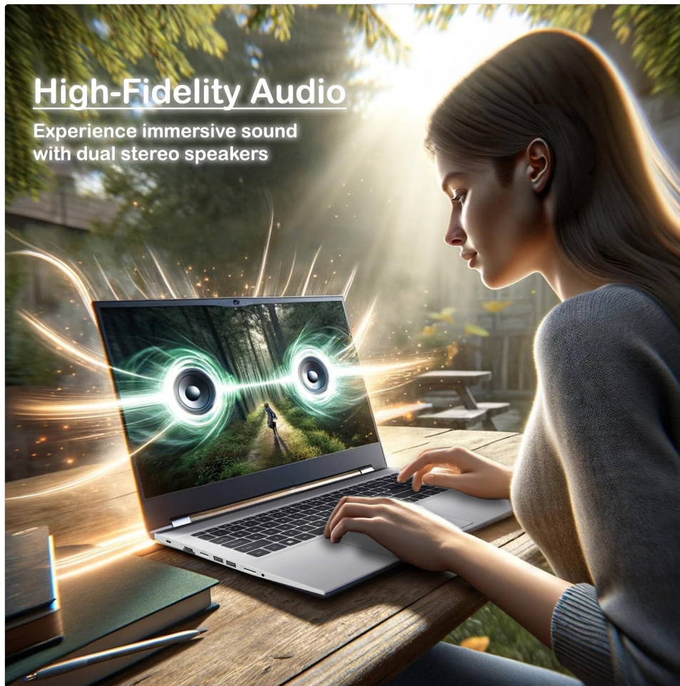
Image: The Acer Aspire laptop screen showing audio waves, representing its high-fidelity sound from dual stereo speakers. Experience clear audio with the laptop's dual 1.5W stereo speakers, enhanced by Nahmic Audio Technology.