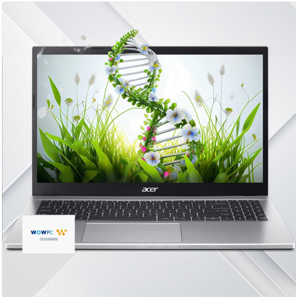
Image: The Acer Aspire Premium Laptop, showcasing its sleek design and 15.6-inch display.