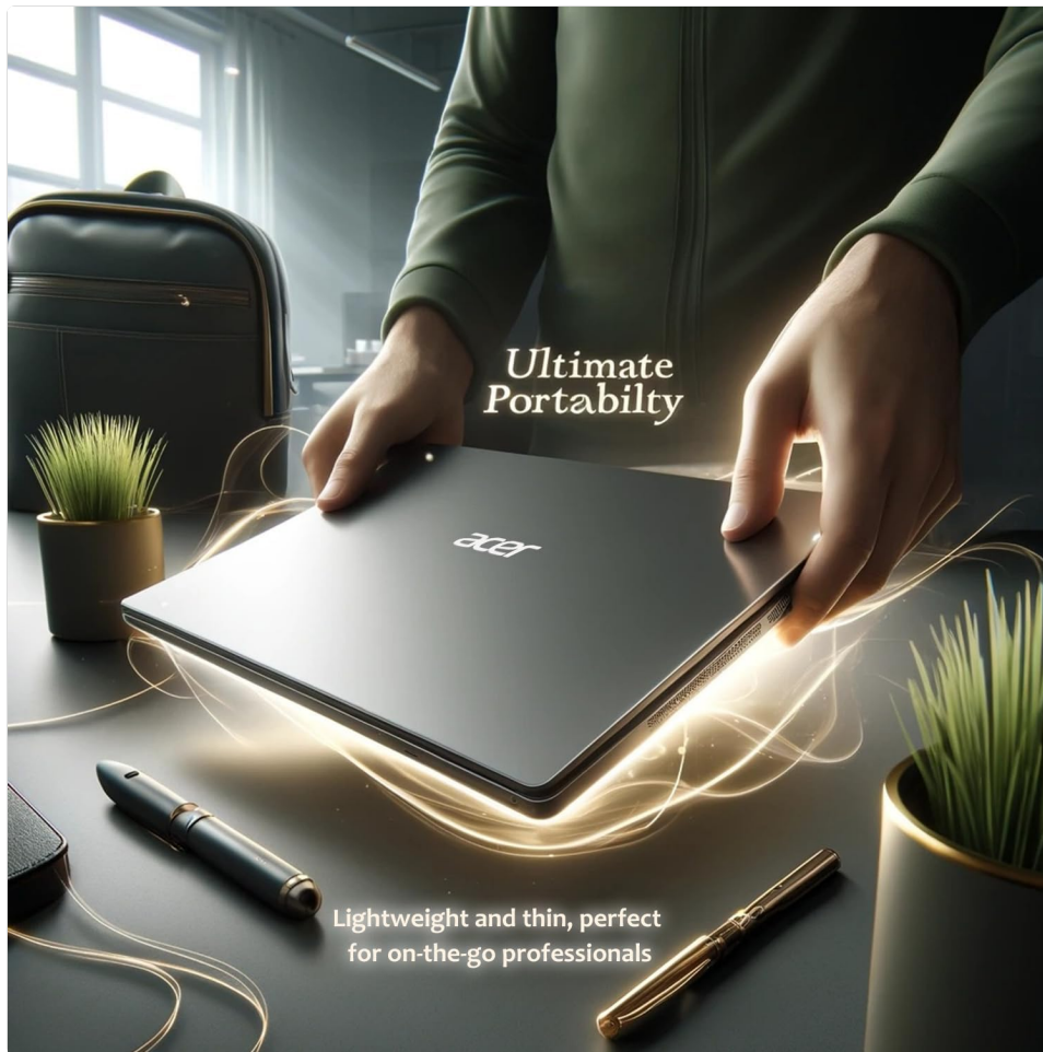
Image: A person holding the Acer Aspire laptop, emphasizing its lightweight and thin profile for easy transport. Weighing approximately 3.5 lbs and with dimensions of 14.19"L x 9.42"W x 0.78"Th, the Acer Aspire is designed for portability, making it suitable for on-the-go use.