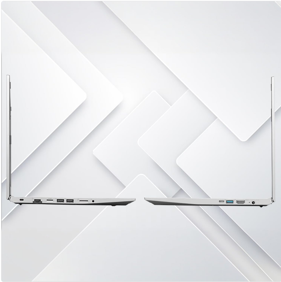
Image: Side profile views of the Acer Aspire laptop, illustrating the placement of its various connectivity ports.

The laptop includes a range of ports for connectivity: 1x USB 3.2 Gen1 (Type A), 2x USB 2.0 (Type A), 1x USB 3.2 Gen2 (Type C), 1x HDMI, 1x RJ-45 Ethernet Port, and 1x Headphone/Mic Combo Jack. It also features a MicroSD media card reader.