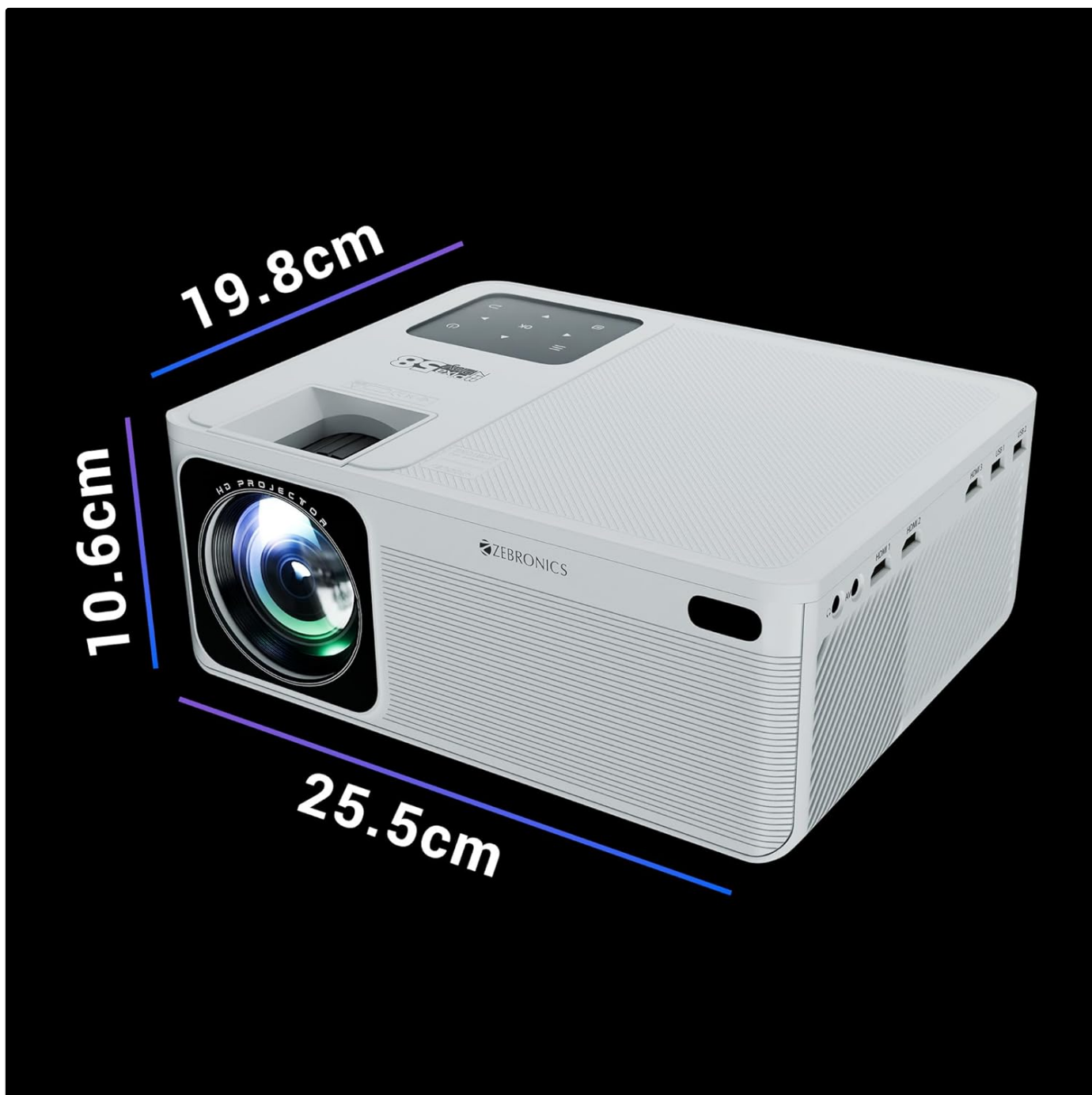
Image: A visual representation of the projector's dimensions, indicating its compact size.