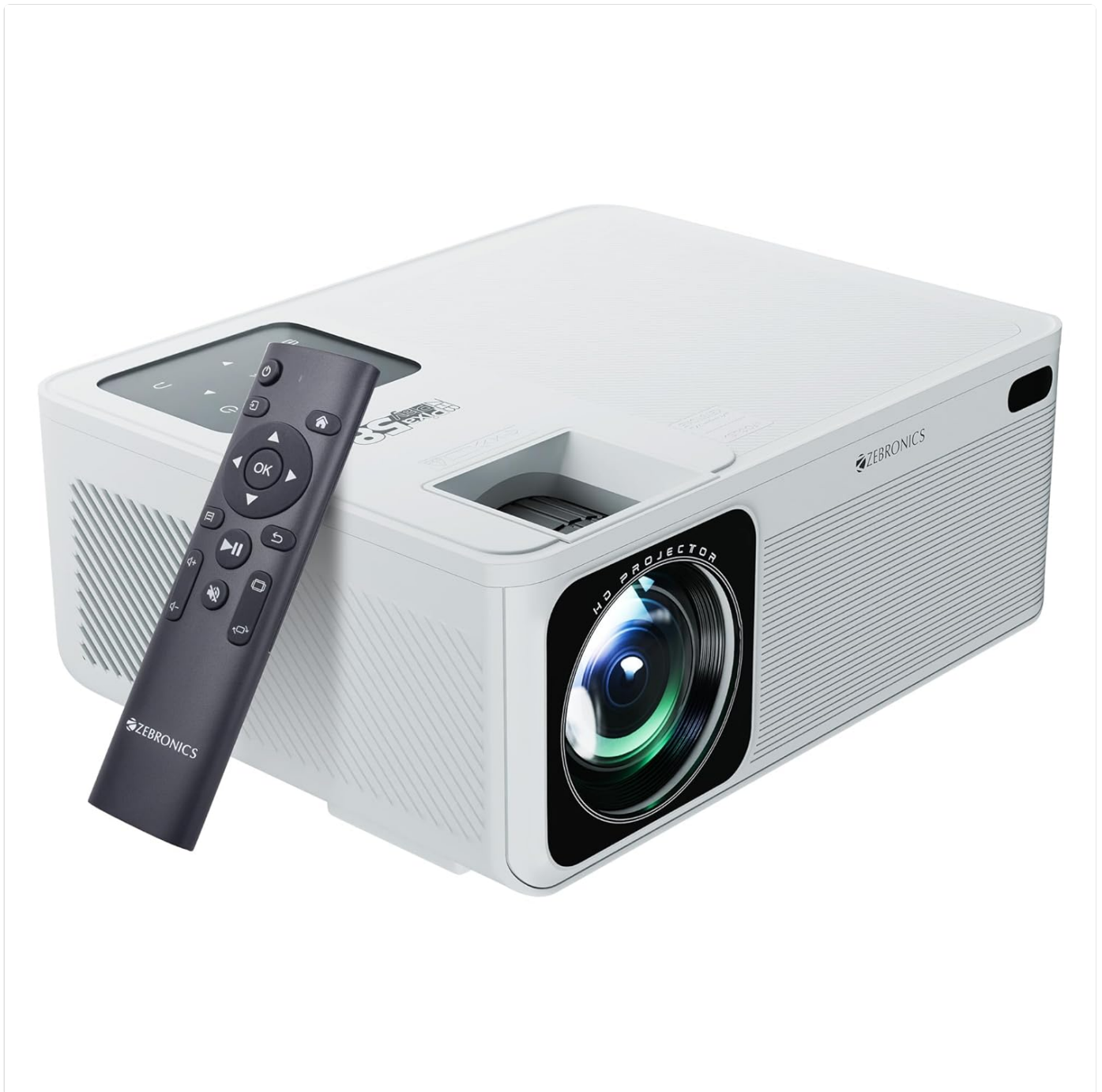
Image: The ZEBRONICS PIXAPLAY 58 Smart Projector shown with its remote control, highlighting its compact design and front lens.