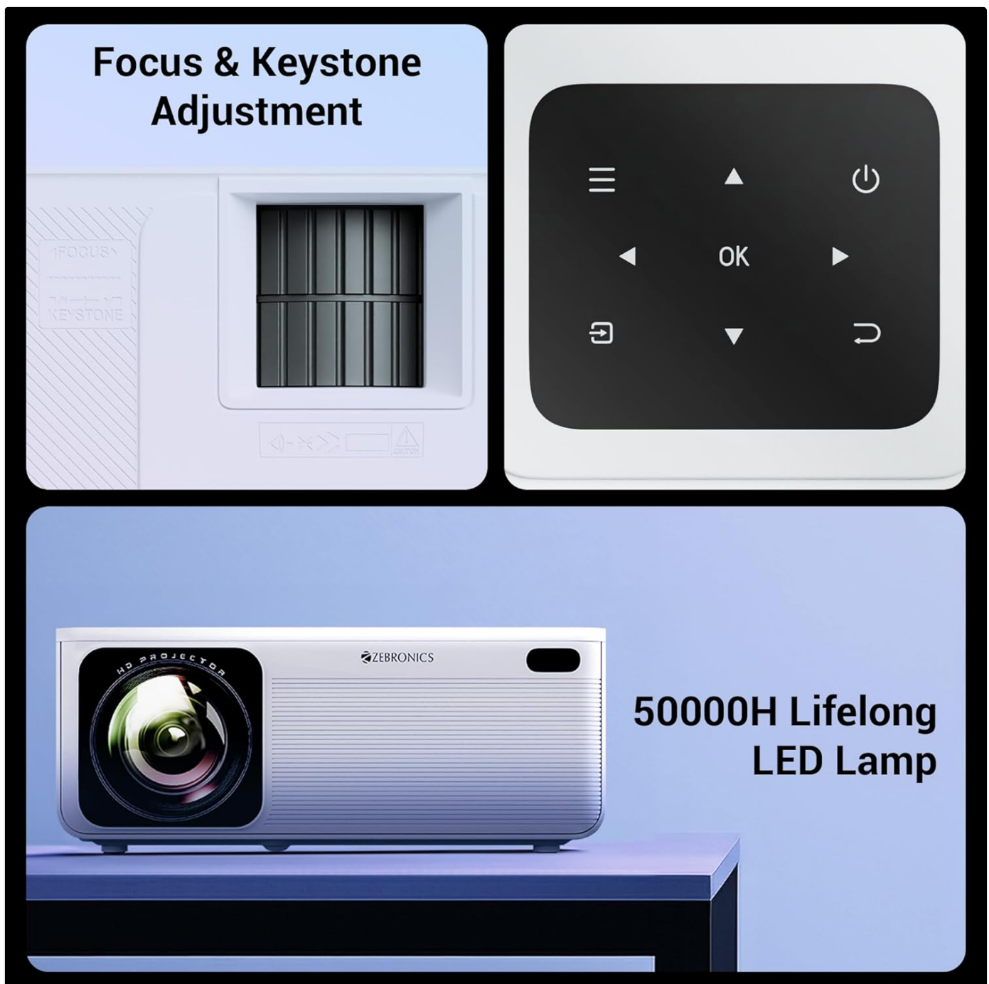
Image: Detailed view of the projector's manual focus and keystone adjustment mechanisms, along with the integrated control panel buttons.